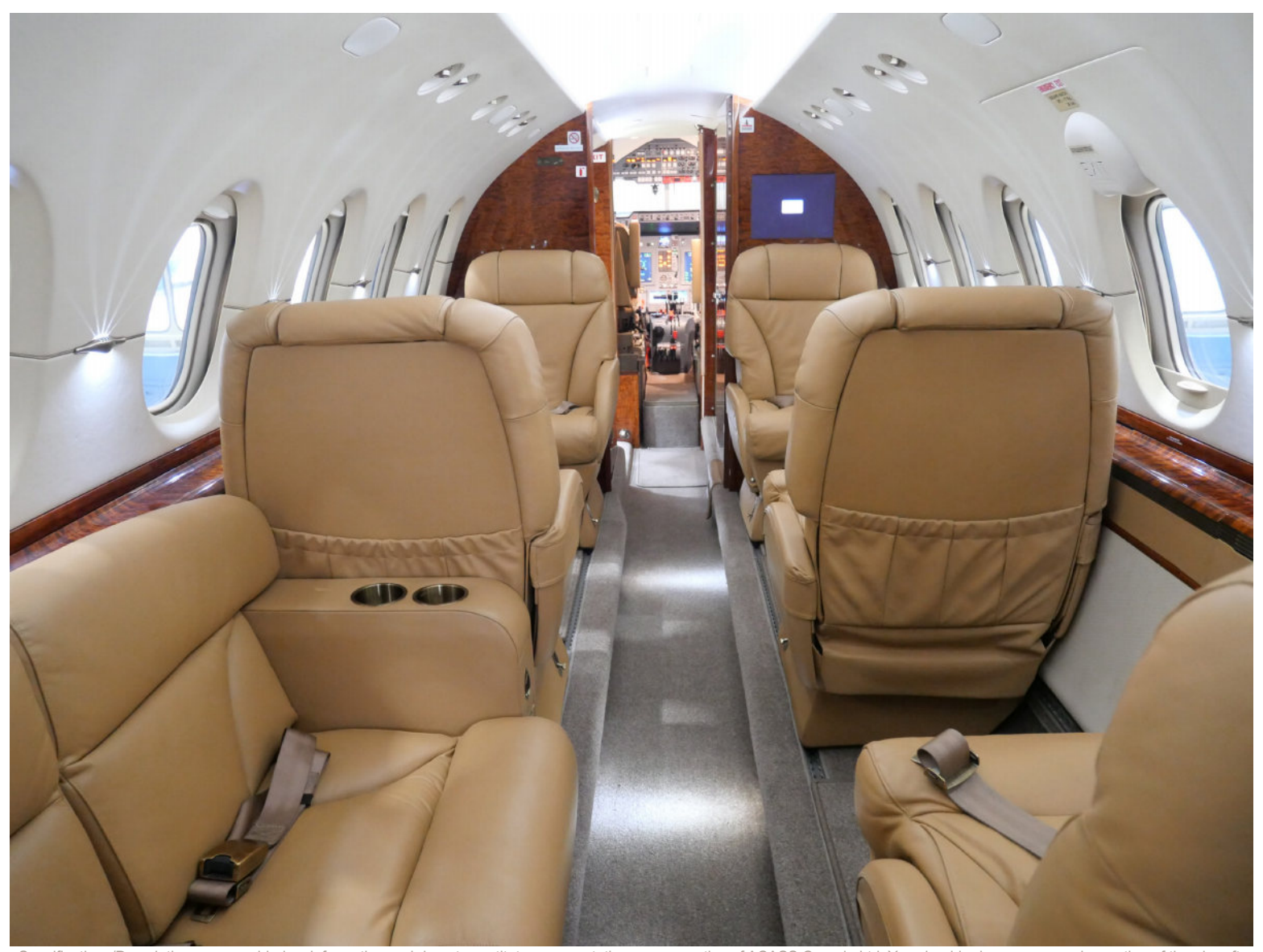
Specifications/Descriptions are provided as information and do not constitute representations or warranties of ACASS Canada Ltd. You should rely on your own inspection of the aircraft. Any proposed transaction is subject to final execution of a contract acceptable in form and substance to ACASS Canada Ltd., its clients, and their counsel.