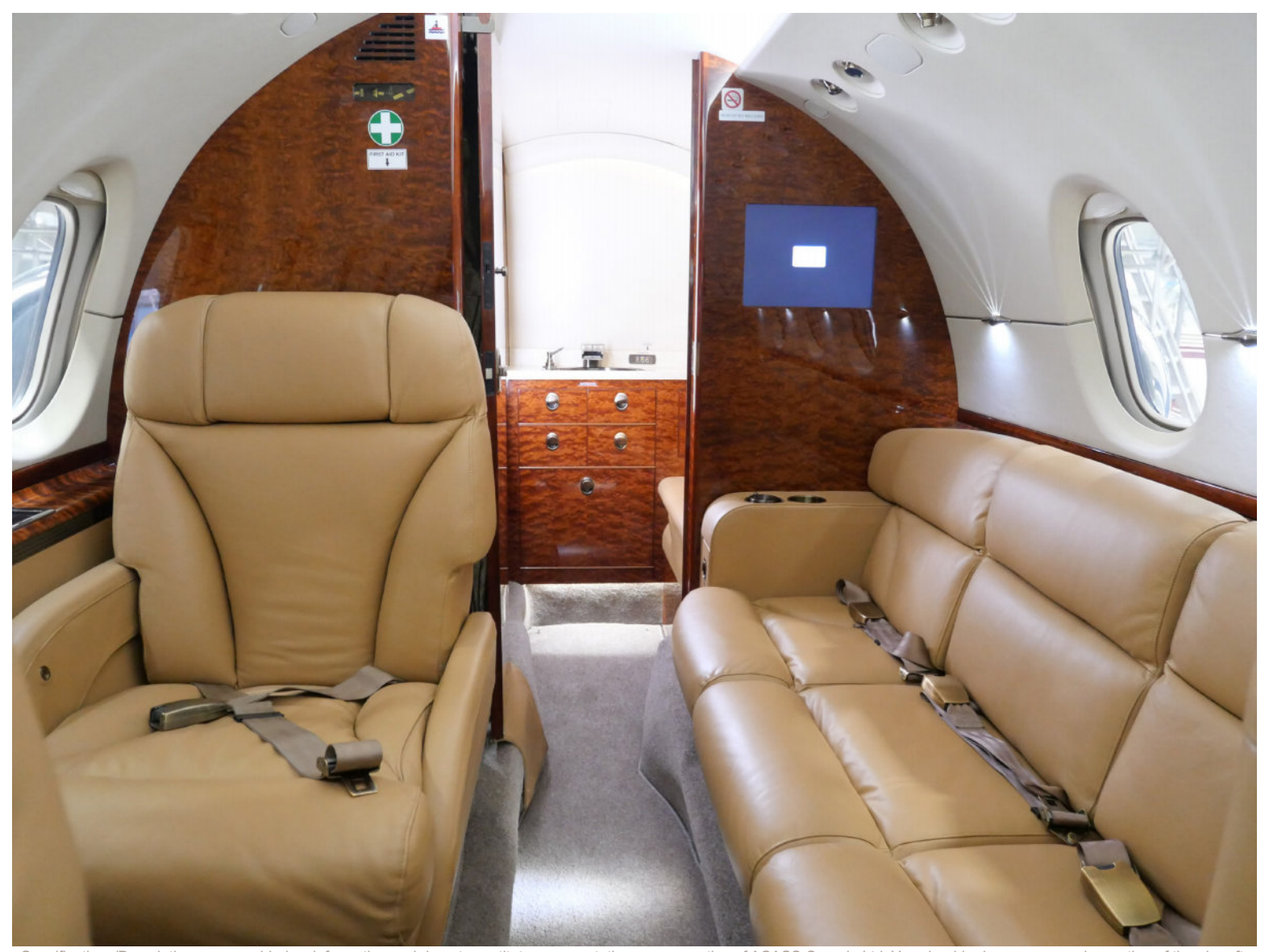
Specifications/Descriptions are provided as information and do not constitute representations or warranties of ACASS Canada Ltd. You should rely on your own inspection of the aircraft. Any proposed transaction is subject to final execution of a contract acceptable in form and substance to ACASS Canada Ltd., its clients, and their counsel.