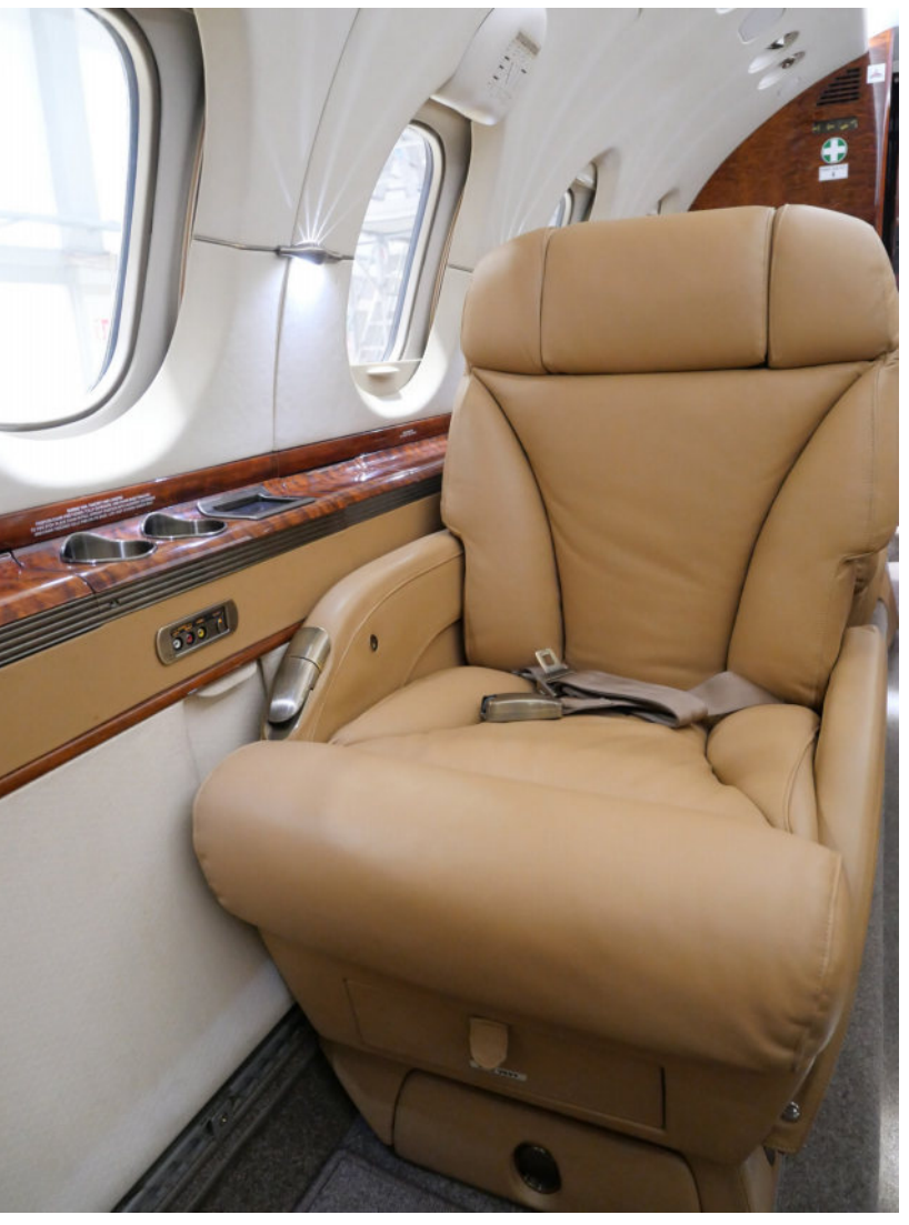
Specifications/Descriptions are provided as information and do not constitute representations or warranties of ACASS Canada Ltd. You should rely on your own inspection of the aircraft. Any proposed transaction is subject to final execution of a contract acceptable in form and substance to ACASS Canada Ltd., its clients, and their counsel.