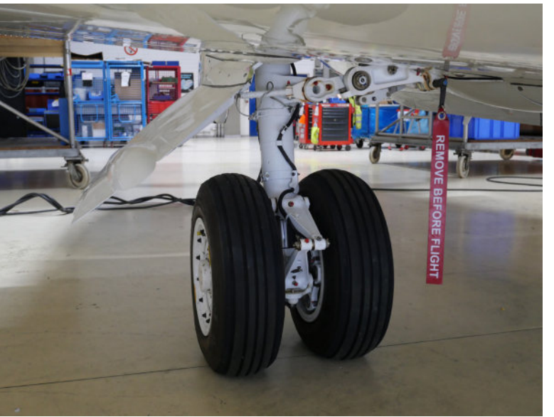
Specifications/Descriptions are provided as information and do not constitute representations or warranties of ACASS Canada Ltd. You should rely on your own inspection of the aircraft. Any proposed transaction is subject to final execution of a contract acceptable in form and substance to ACASS Canada Ltd., its clients, and their counsel.