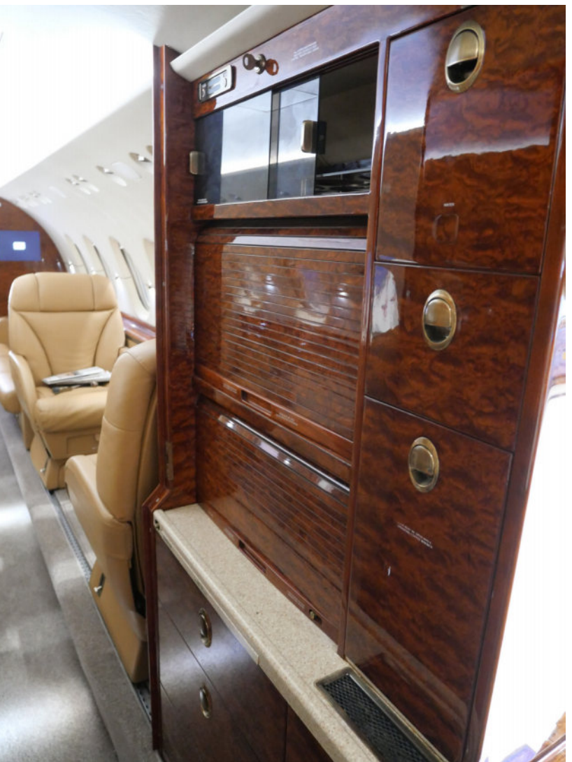
Specifications/Descriptions are provided as information and do not constitute representations or warranties of ACASS Canada Ltd. You should rely on your own inspection of the aircraft. Any proposed transaction is subject to final execution of a contract acceptable in form and substance to ACASS Canada Ltd., its clients, and their counsel.