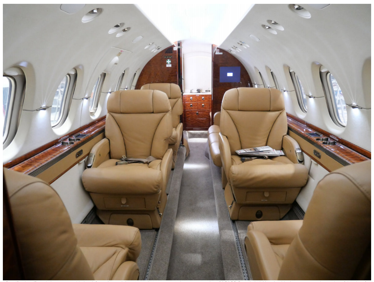
Specifications/Descriptions are provided as information and do not constitute representations or warranties of ACASS Canada Ltd. You should rely on your own inspection of the aircraft. Any proposed transaction is subject to final execution of a contract acceptable in form and substance to ACASS Canada Ltd., its clients, and their counsel.