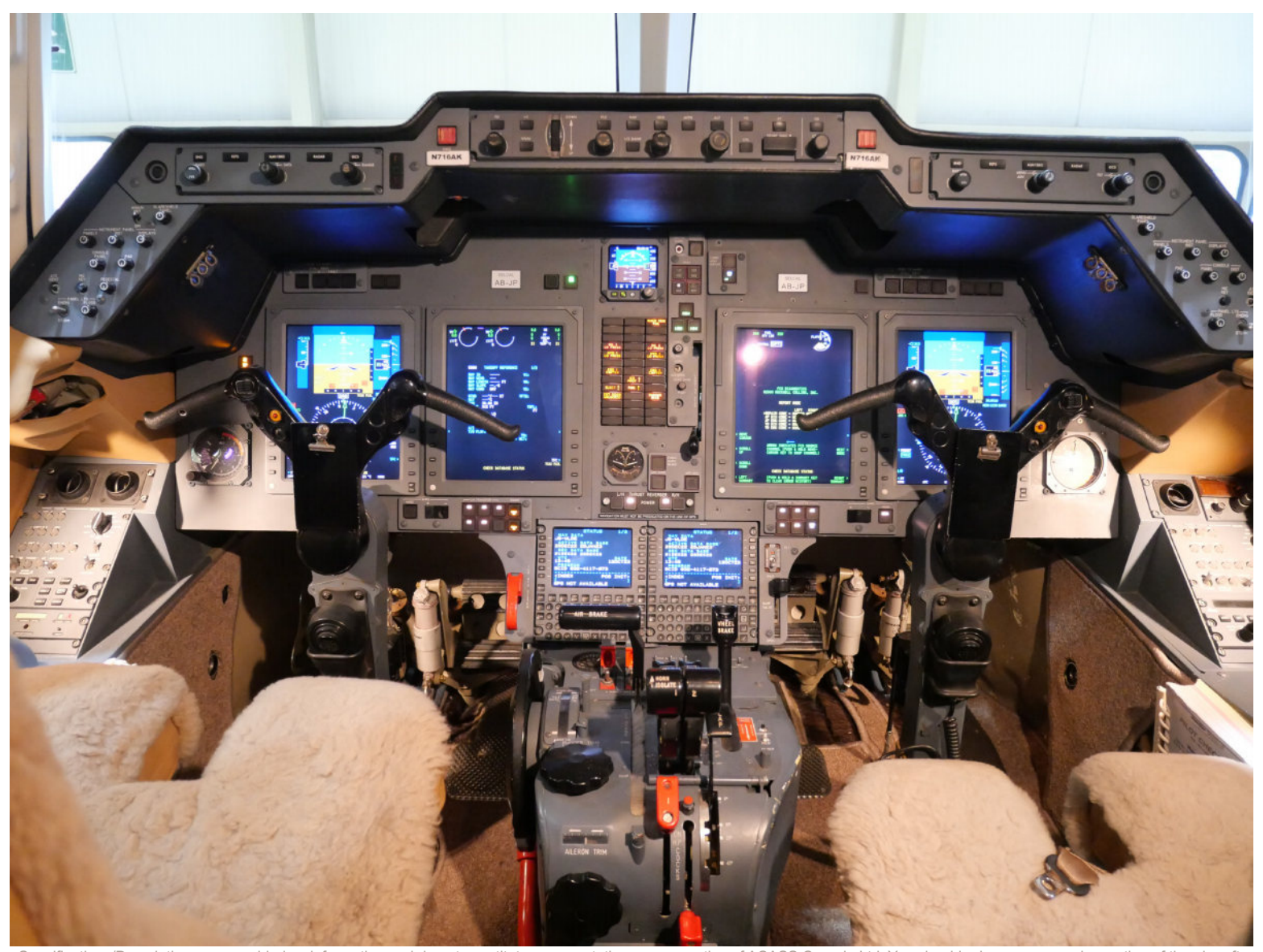
Specifications/Descriptions are provided as information and do not constitute representations or warranties of ACASS Canada Ltd. You should rely on your own inspection of the aircraft. Any proposed transaction is subject to final execution of a contract acceptable in form and substance to ACASS Canada Ltd., its clients, and their counsel.