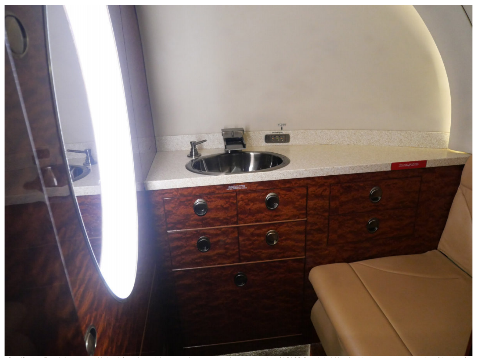
Specifications/Descriptions are provided as information and do not constitute representations or warranties of ACASS Canada Ltd. You should rely on your own inspection of the aircraft. Any proposed transaction is subject to final execution of a contract acceptable in form and substance to ACASS Canada Ltd., its clients, and their counsel.