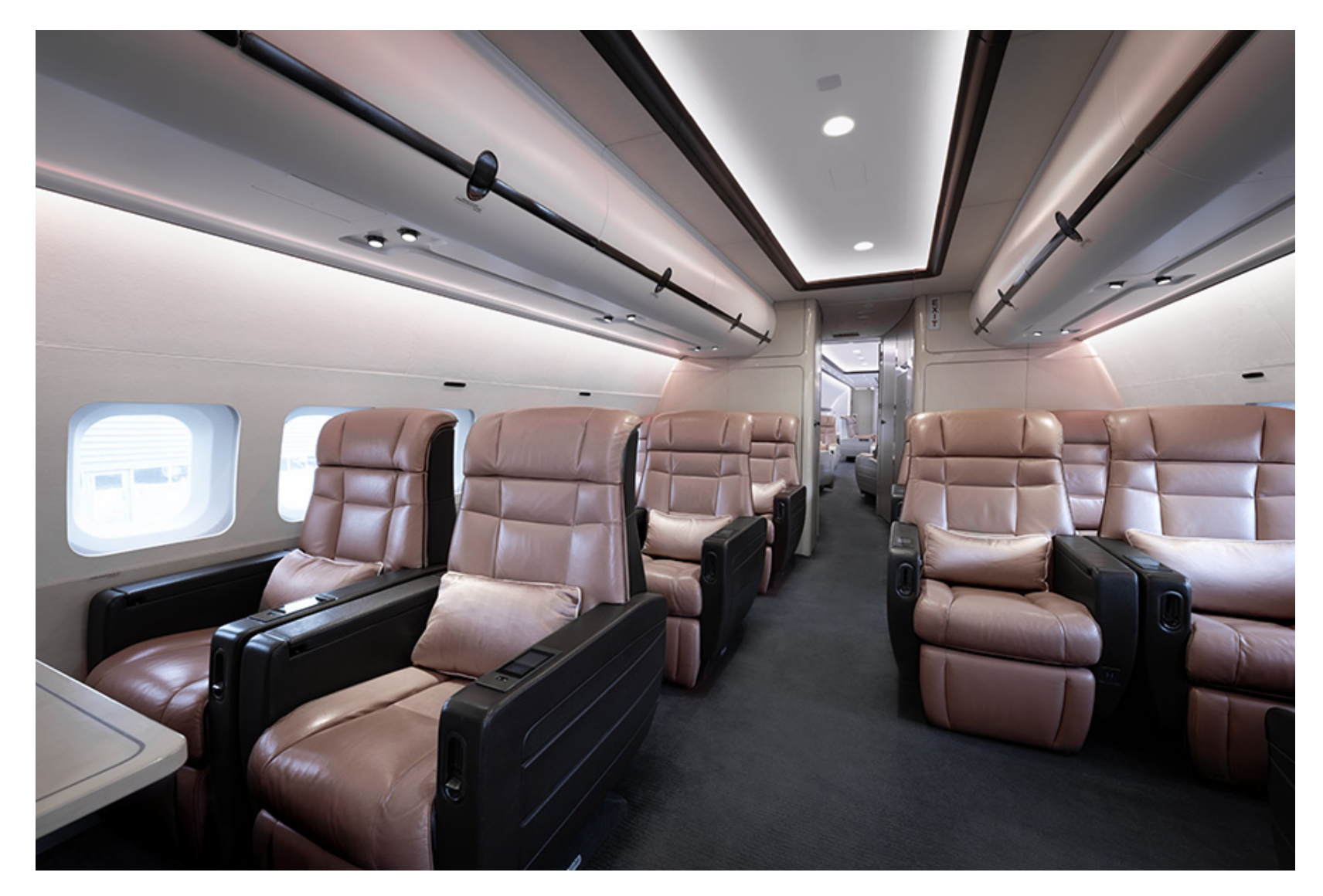
Specifications/Descriptions are provided as information and do not constitute representations or warranties of ACASS Canada Ltd. You should rely on your own inspection of the aircraft. Any proposed transaction is subject to final execution of a contract acceptable in form and substance to ACASS Canada Ltd., its clients, and their counsel.