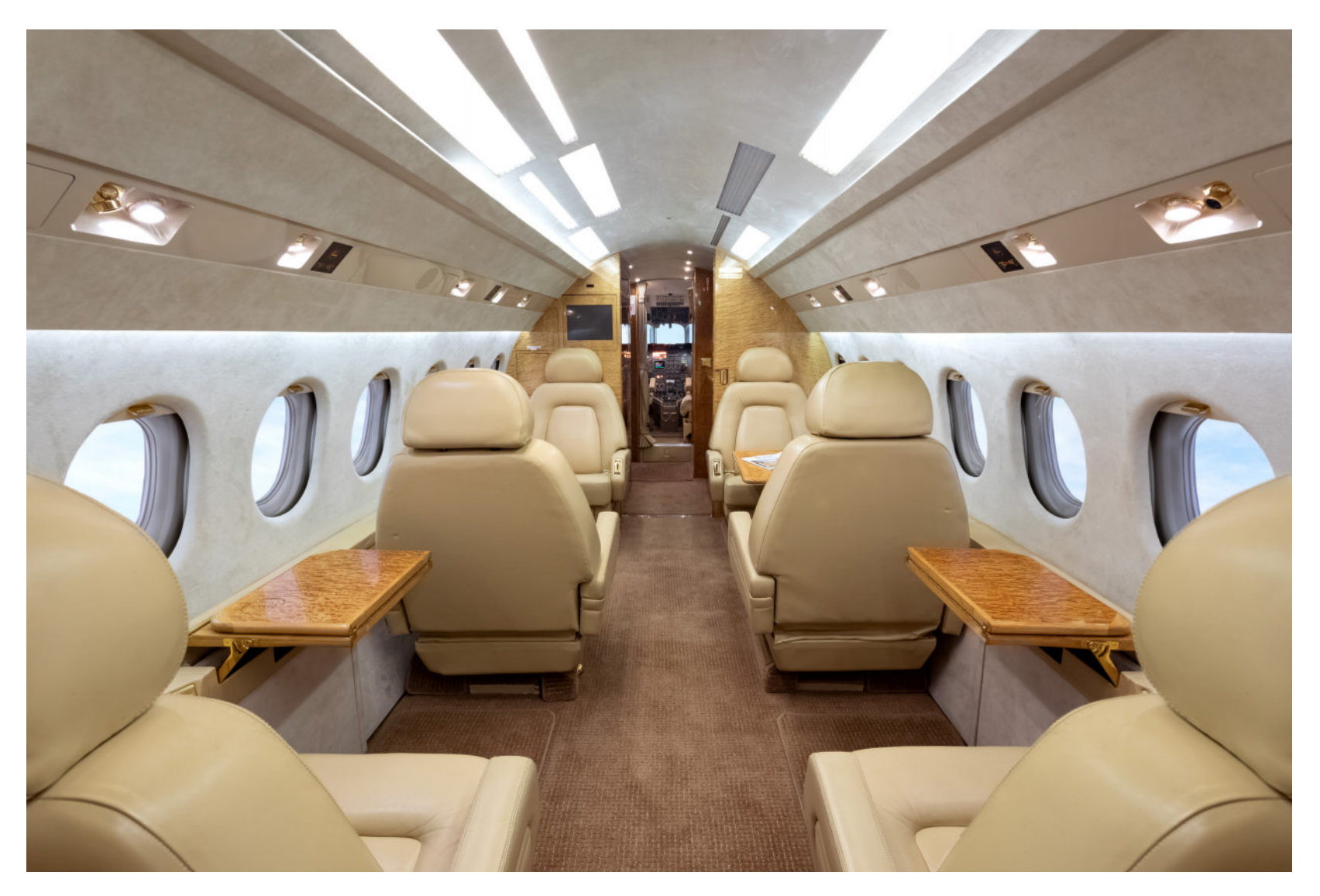
Specifications/Descriptions are provided as information and do not constitute representations or warranties of ACASS Canada Ltd. You should rely on your own inspection of the aircraft. Any proposed transaction is subject to final execution of a contract acceptable in form and substance to ACASS Canada Ltd., its clients, and their counsel.