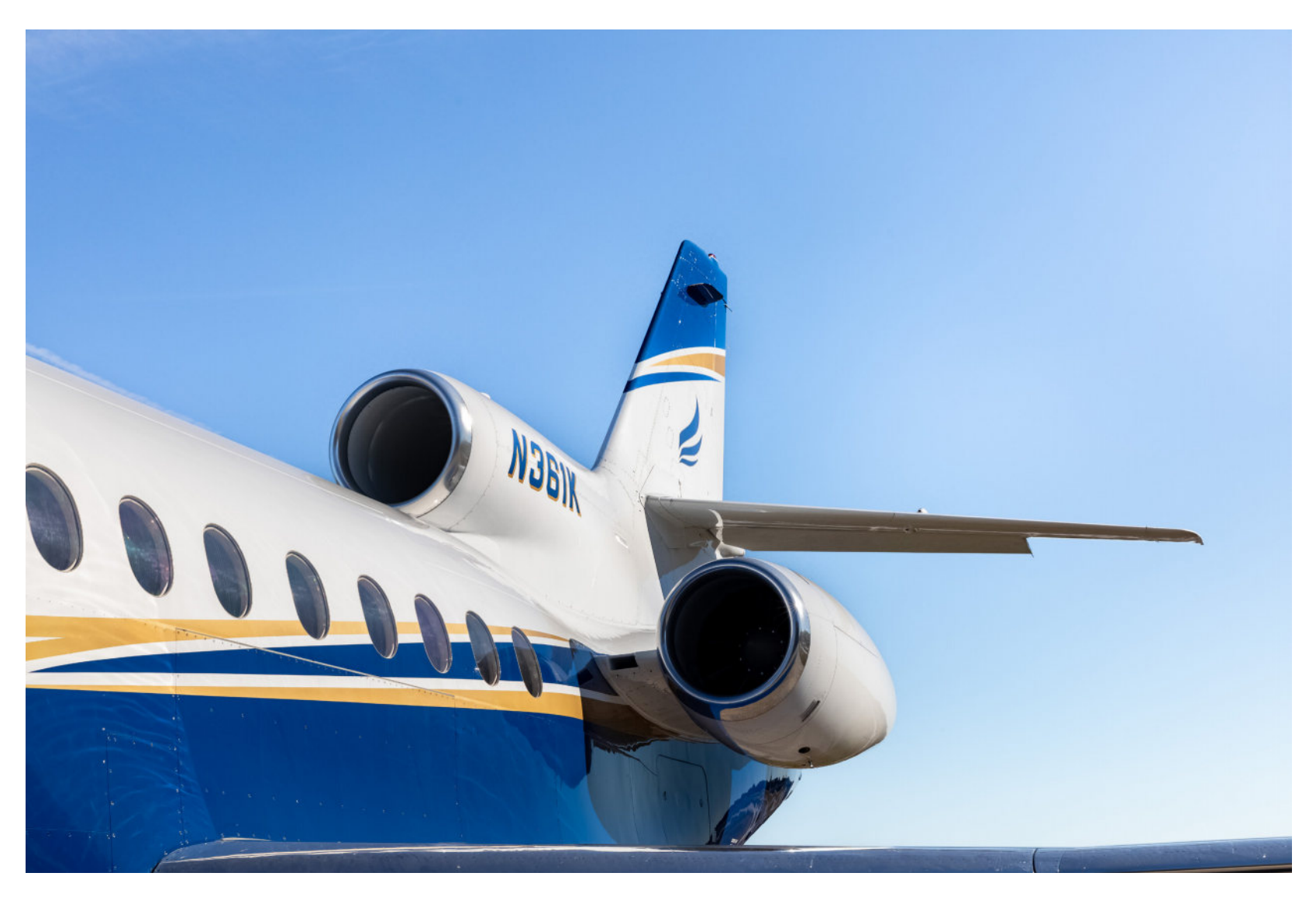
Specifications/Descriptions are provided as information and do not constitute representations or warranties of ACASS Canada Ltd. You should rely on your own inspection of the aircraft. Any proposed transaction is subject to final execution of a contract acceptable in form and substance to ACASS Canada Ltd., its clients, and their counsel.