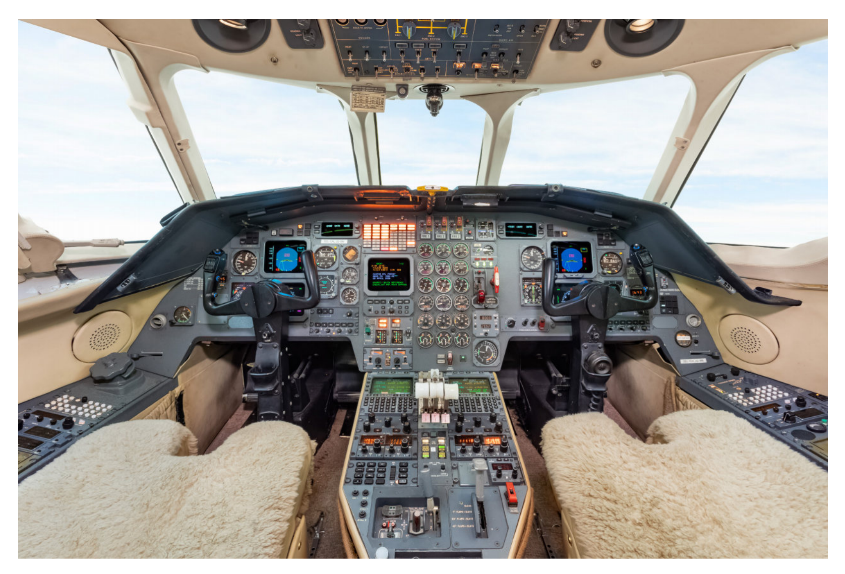
Specifications/Descriptions are provided as information and do not constitute representations or warranties of ACASS Canada Ltd. You should rely on your own inspection of the aircraft. Any proposed transaction is subject to final execution of a contract acceptable in form and substance to ACASS Canada Ltd., its clients, and their counsel.