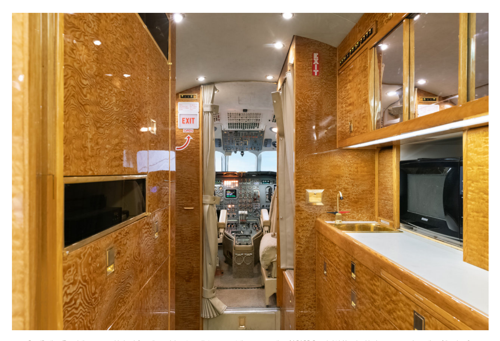
Specifications/Descriptions are provided as information and do not constitute representations or warranties of ACASS Canada Ltd. You should rely on your own inspection of the aircraft. Any proposed transaction is subject to final execution of a contract acceptable in form and substance to ACASS Canada Ltd., its clients, and their counsel.