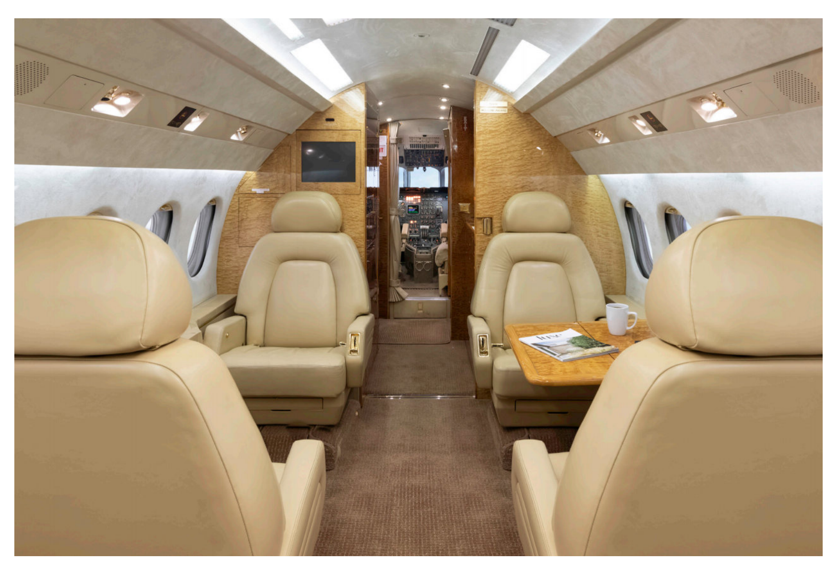
Specifications/Descriptions are provided as information and do not constitute representations or warranties of ACASS Canada Ltd. You should rely on your own inspection of the aircraft. Any proposed transaction is subject to final execution of a contract acceptable in form and substance to ACASS Canada Ltd., its clients, and their counsel.