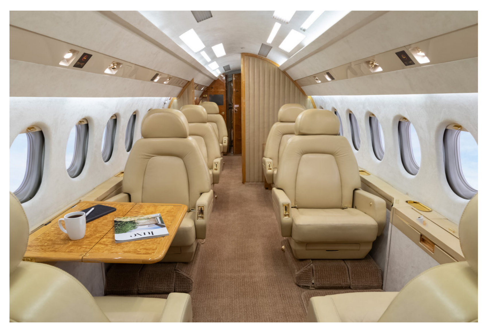
Specifications/Descriptions are provided as information and do not constitute representations or warranties of ACASS Canada Ltd. You should rely on your own inspection of the aircraft. Any proposed transaction is subject to final execution of a contract acceptable in form and substance to ACASS Canada Ltd., its clients, and their counsel.