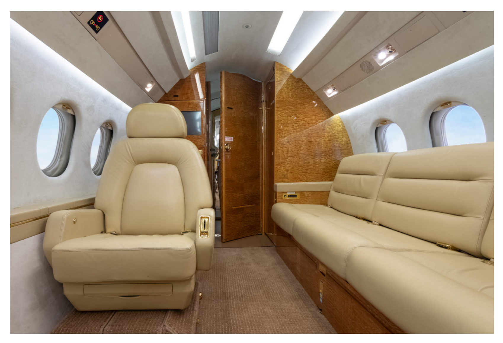
Specifications/Descriptions are provided as information and do not constitute representations or warranties of ACASS Canada Ltd. You should rely on your own inspection of the aircraft. Any proposed transaction is subject to final execution of a contract acceptable in form and substance to ACASS Canada Ltd., its clients, and their counsel.