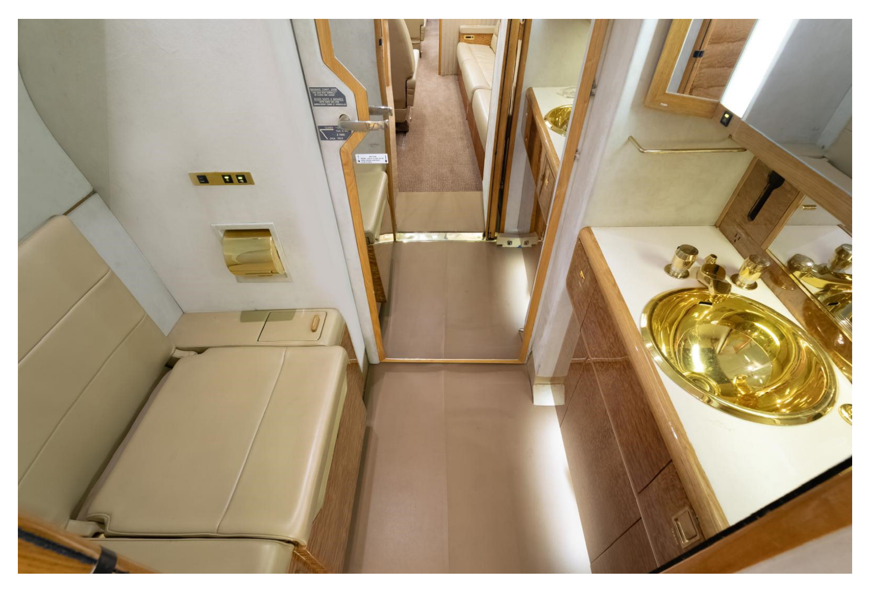
Specifications/Descriptions are provided as information and do not constitute representations or warranties of ACASS Canada Ltd. You should rely on your own inspection of the aircraft. Any proposed transaction is subject to final execution of a contract acceptable in form and substance to ACASS Canada Ltd., its clients, and their counsel.