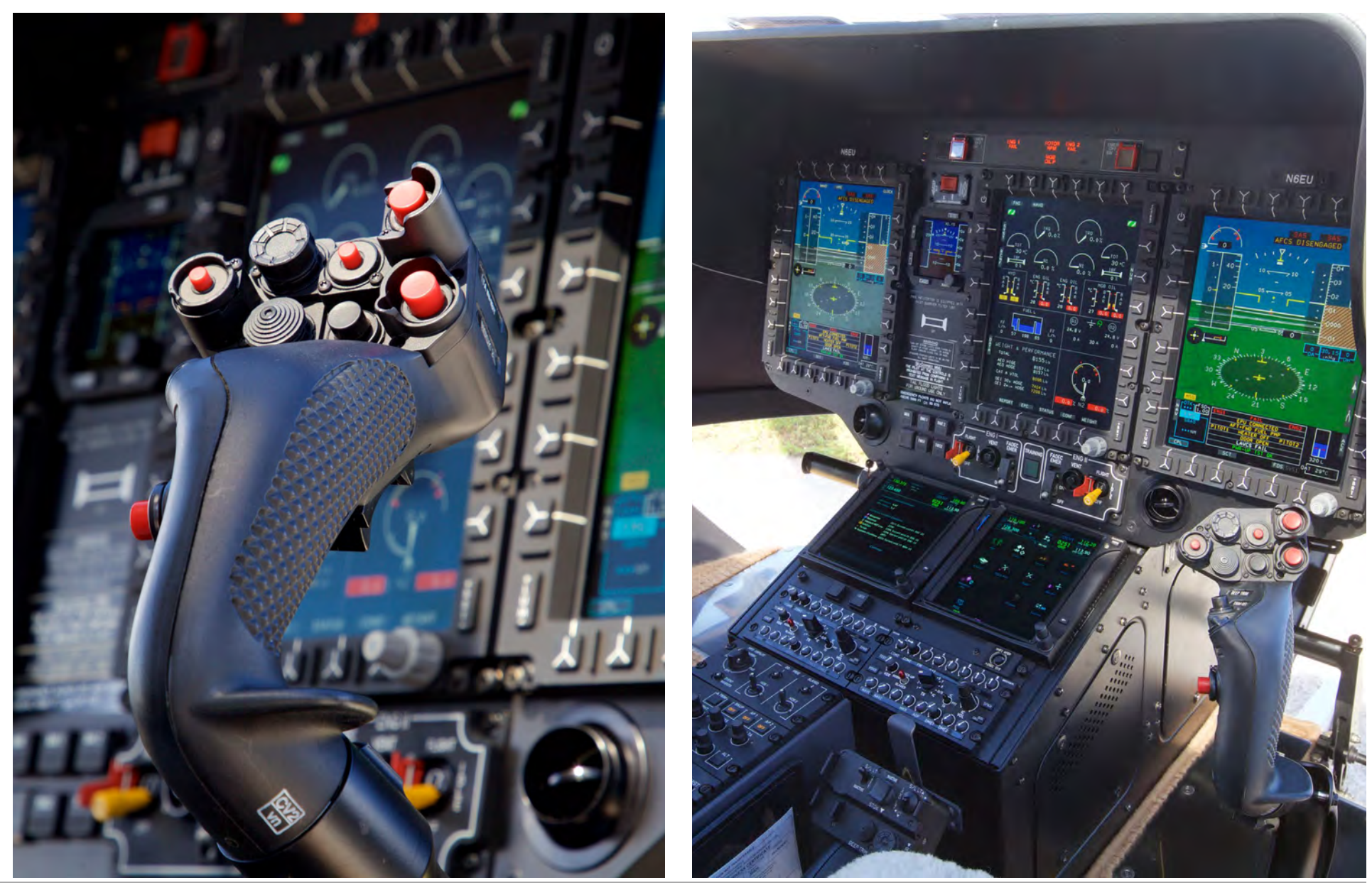
SPECIFICATIONS ARE PROVIDED FOR INFORMATIONAL PURPOSES ONLY AND DO NOT CONSTITUTE REPRESENTATIONS OR WARRANTIES. THESE SPECIFICATIONS ARE SUBJECT TO BUYER'S INDEPENDENT VERIFICATION UPON INSPECTION. THE AIRCRAFT IS SUBJECT TO PRIOR SALE, LEASE AND/OR REMOVAL FROM THE MARKET WITHOUT PRIOR NOTICE. JULY 10, 2023 2:12 PM