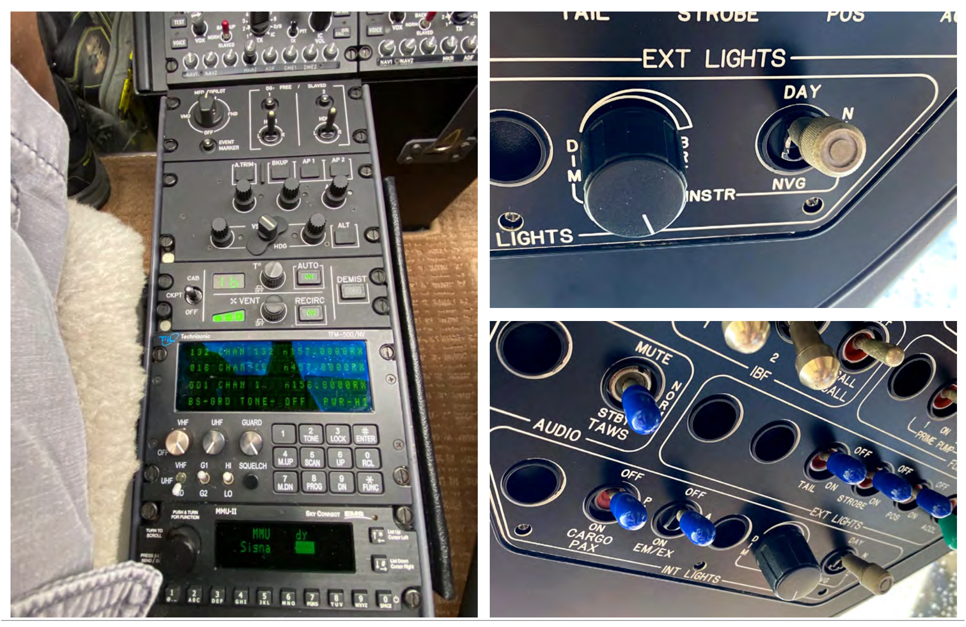
SPECIFICATIONS ARE PROVIDED FOR INFORMATIONAL PURPOSES ONLY AND DO NOT CONSTITUTE REPRESENTATIONS OR WARRANTIES. THESE SPECIFICATIONS ARE SUBJECT TO BUYER'S INDEPENDENT VERIFICATION UPON INSPECTION. THE AIRCRAFT IS SUBJECT TO PRIOR SALE, LEASE AND/OR REMOVAL FROM THE MARKET WITHOUT PRIOR NOTICE. JULY 10, 2023 2:12 PM