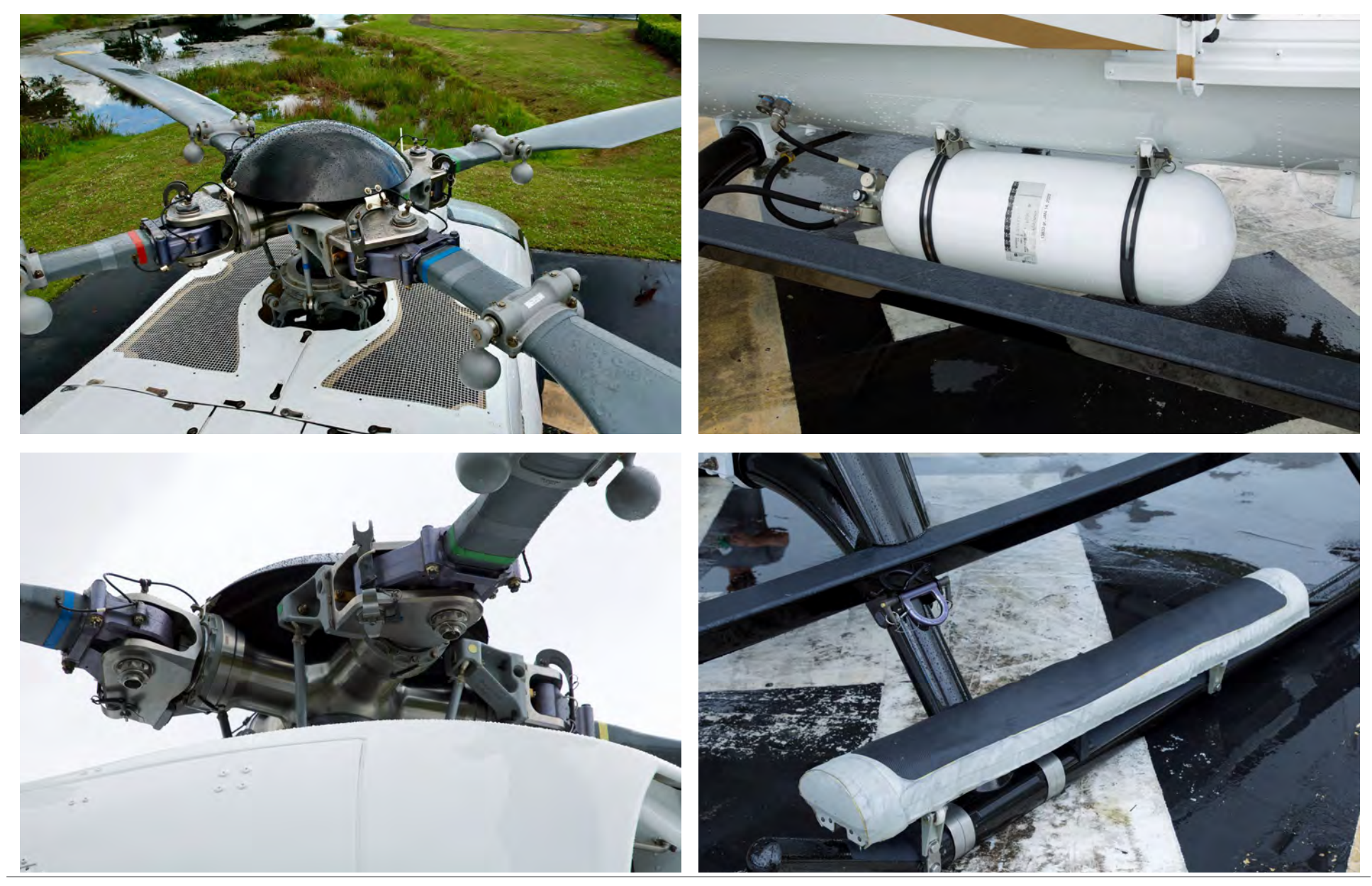
SPECIFICATIONS ARE PROVIDED FOR INFORMATIONAL PURPOSES ONLY AND DO NOT CONSTITUTE REPRESENTATIONS OR WARRANTIES. THESE SPECIFICATIONS ARE SUBJECT TO BUYER'S INDEPENDENT VERIFICATION UPON INSPECTION. THE AIRCRAFT IS SUBJECT TO PRIOR SALE, LEASE AND/OR REMOVAL FROM THE MARKET WITHOUT PRIOR NOTICE. JULY 10, 2023 2:12 PM