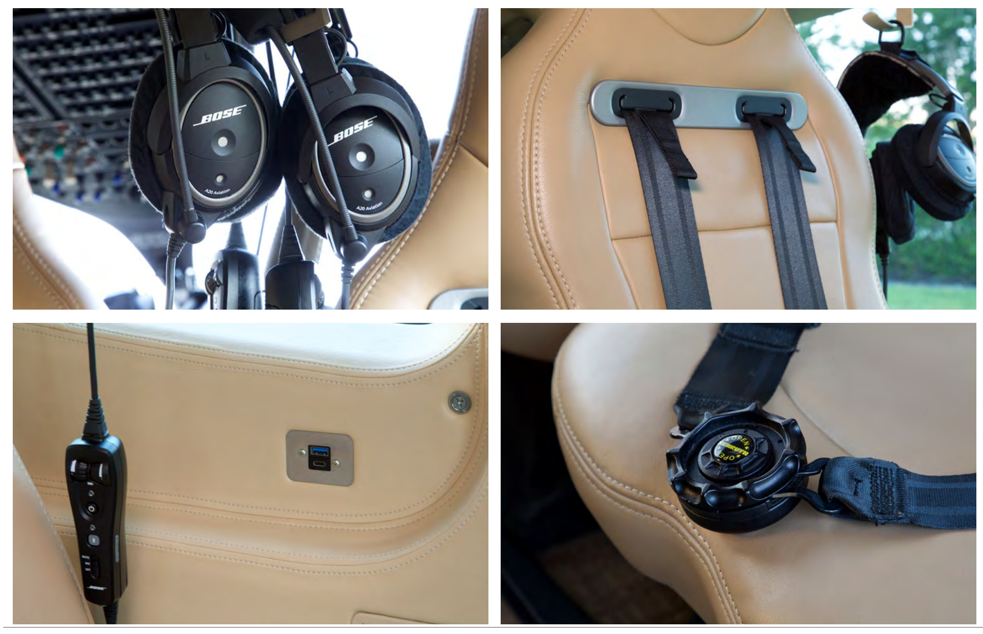
SPECIFICATIONS ARE PROVIDED FOR INFORMATIONAL PURPOSES ONLY AND DO NOT CONSTITUTE REPRESENTATIONS OR WARRANTIES. THESE SPECIFICATIONS ARE SUBJECT TO BUYER'S INDEPENDENT VERIFICATION UPON INSPECTION. THE AIRCRAFT IS SUBJECT TO PRIOR SALE, LEASE AND/OR REMOVAL FROM THE MARKET WITHOUT PRIOR NOTICE. JULY 10, 2023 2:12 PM