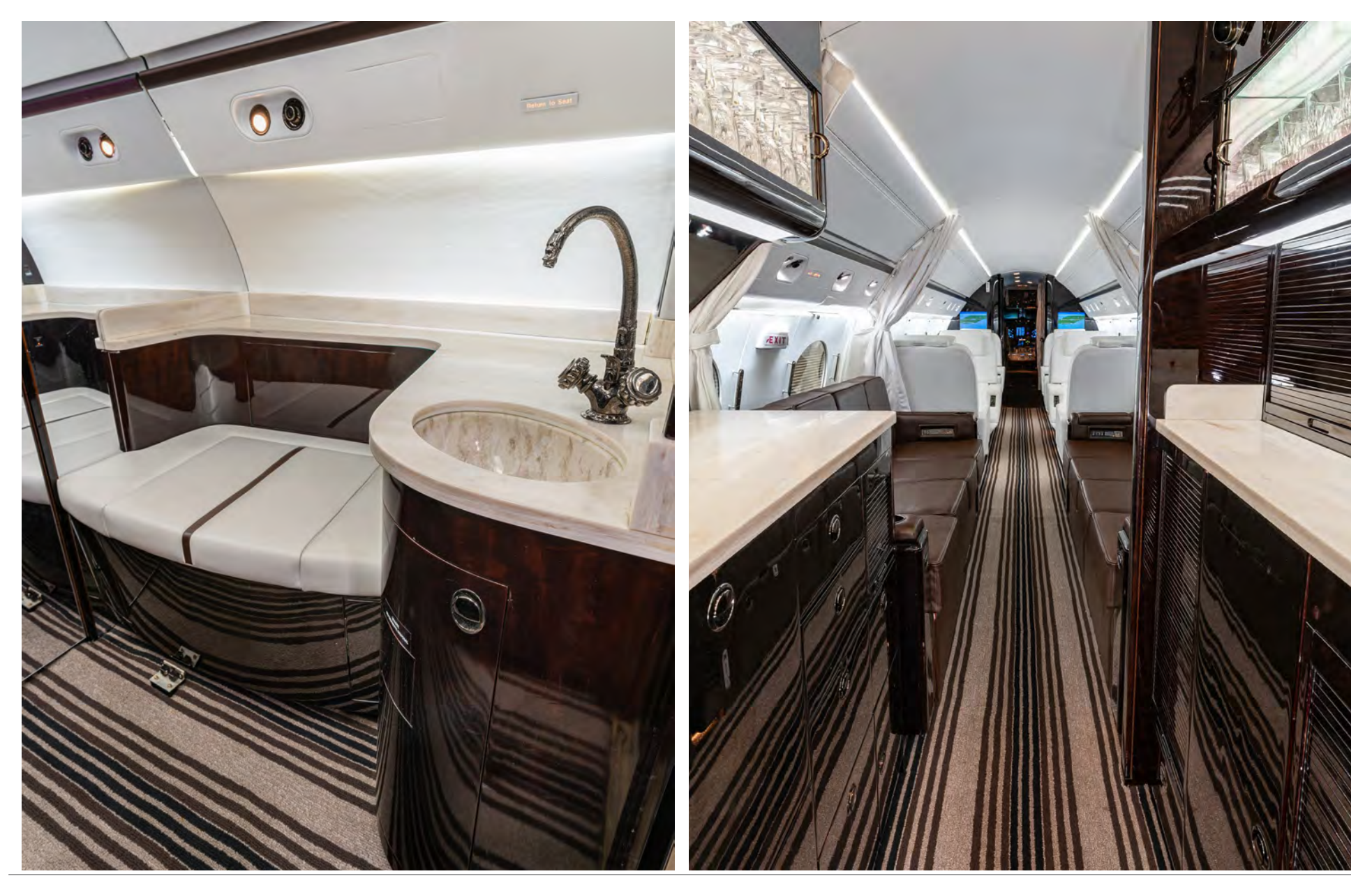
SPECIFICATIONS ARE PROVIDED FOR INFORMATIONAL PURPOSES ONLY AND DO NOT CONSTITUTE REPRESENTATIONS OR WARRANTIES. THESE SPECIFICATIONS ARE SUBJECT TO BUYER'S INDEPENDENT VERIFICATION UPON INSPECTION. THE AIRCRAFT IS SUBJECT TO PRIOR SALE, LEASE AND/OR REMOVAL FROM THE MARKET WITHOUT PRIOR NOTICE.