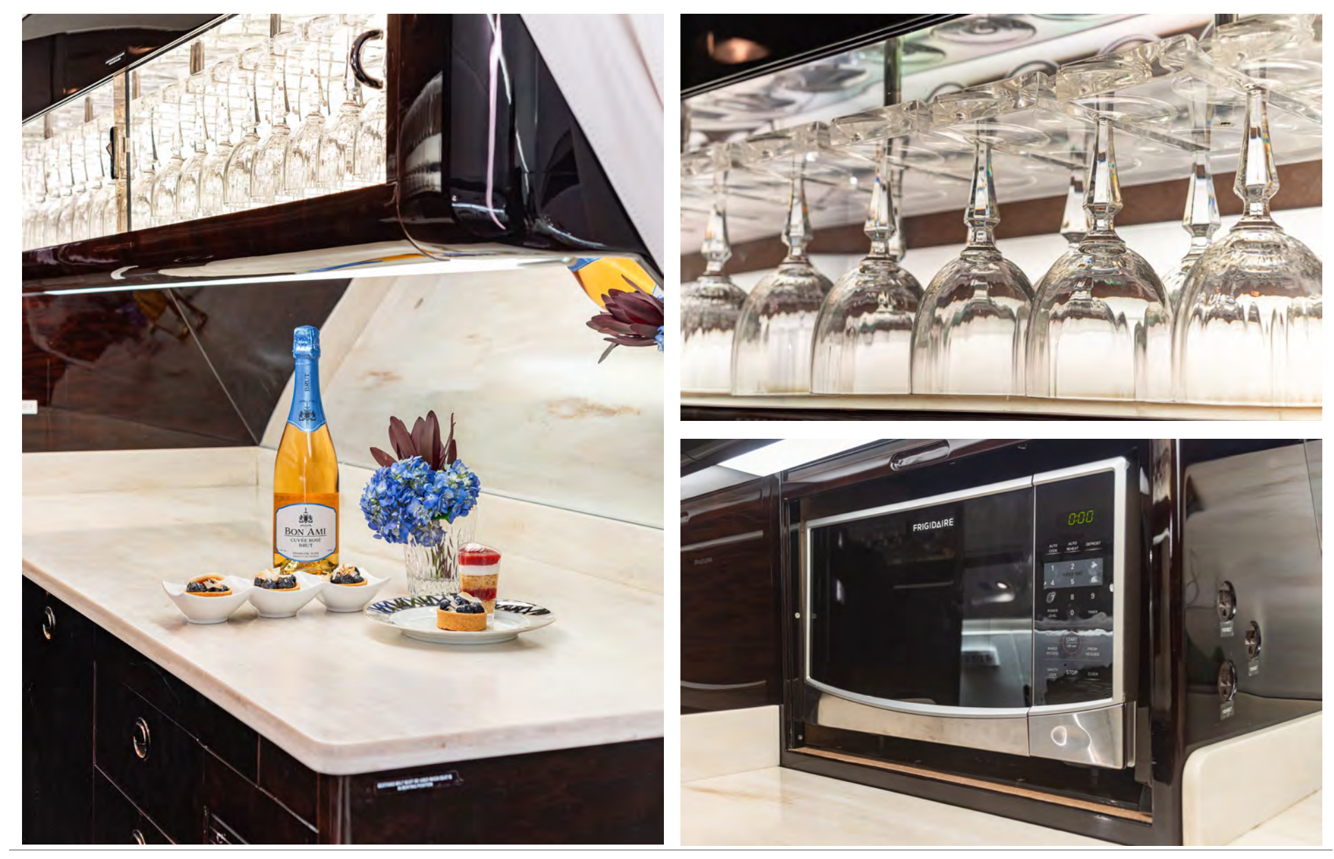
SPECIFICATIONS ARE PROVIDED FOR INFORMATIONAL PURPOSES ONLY AND DO NOT CONSTITUTE REPRESENTATIONS OR WARRANTIES. THESE SPECIFICATIONS ARE SUBJECT TO BUYER'S INDEPENDENT VERIFICATION UPON INSPECTION. THE AIRCRAFT IS SUBJECT TO PRIOR SALE, LEASE AND/OR REMOVAL FROM THE MARKET WITHOUT PRIOR NOTICE.