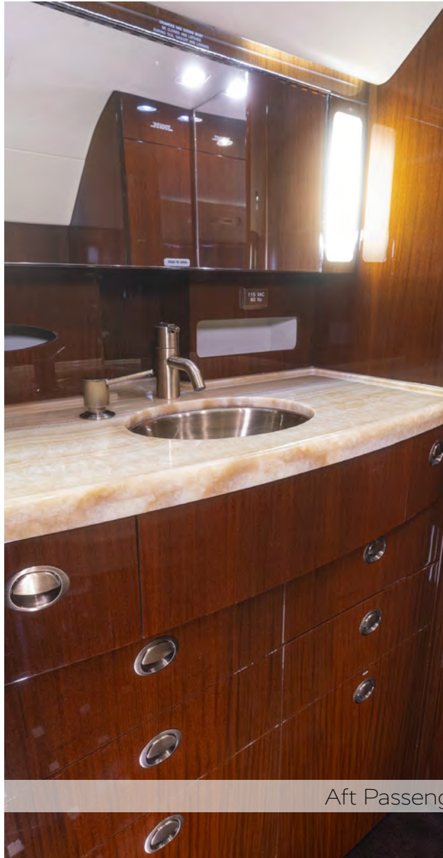
Aft Passenger Lavatory