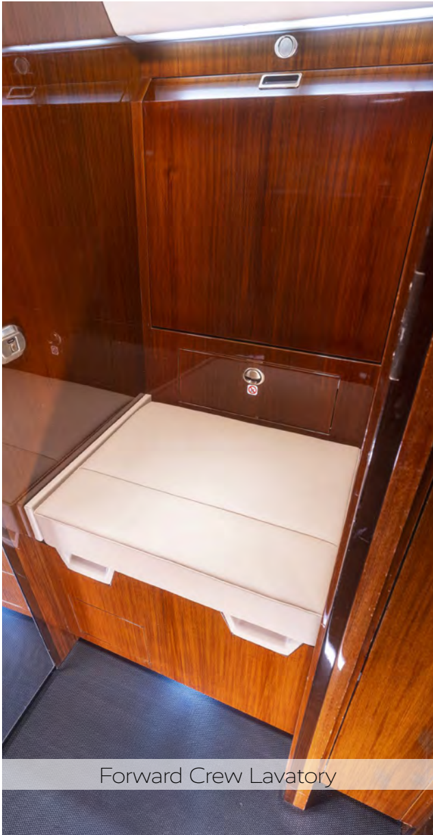
Forward Crew Lavatory