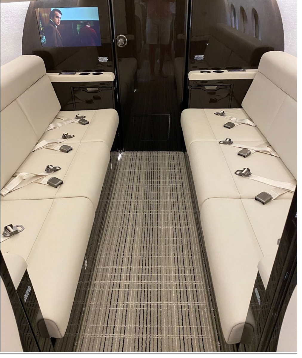
SPECIFICATIONS ARE PROVIDED FOR INFORMATIONAL PURPOSES ONLY AND DO NOT CONSTITUTE REPRESENTATIONS OR WARRANTIES. THESE SPECIFICATIONS ARE SUBJECT TO BUYER'S INDEPENDENT VERIFICATION UPON INSPECTION. THE AIRCRAFT IS SUBJECT TO PRIOR SALE, LEASE AND/OR REMOVAL FROM THE MARKET WITHOUT PRIOR NOTICE. MAY 1, 2024 10:52 AM