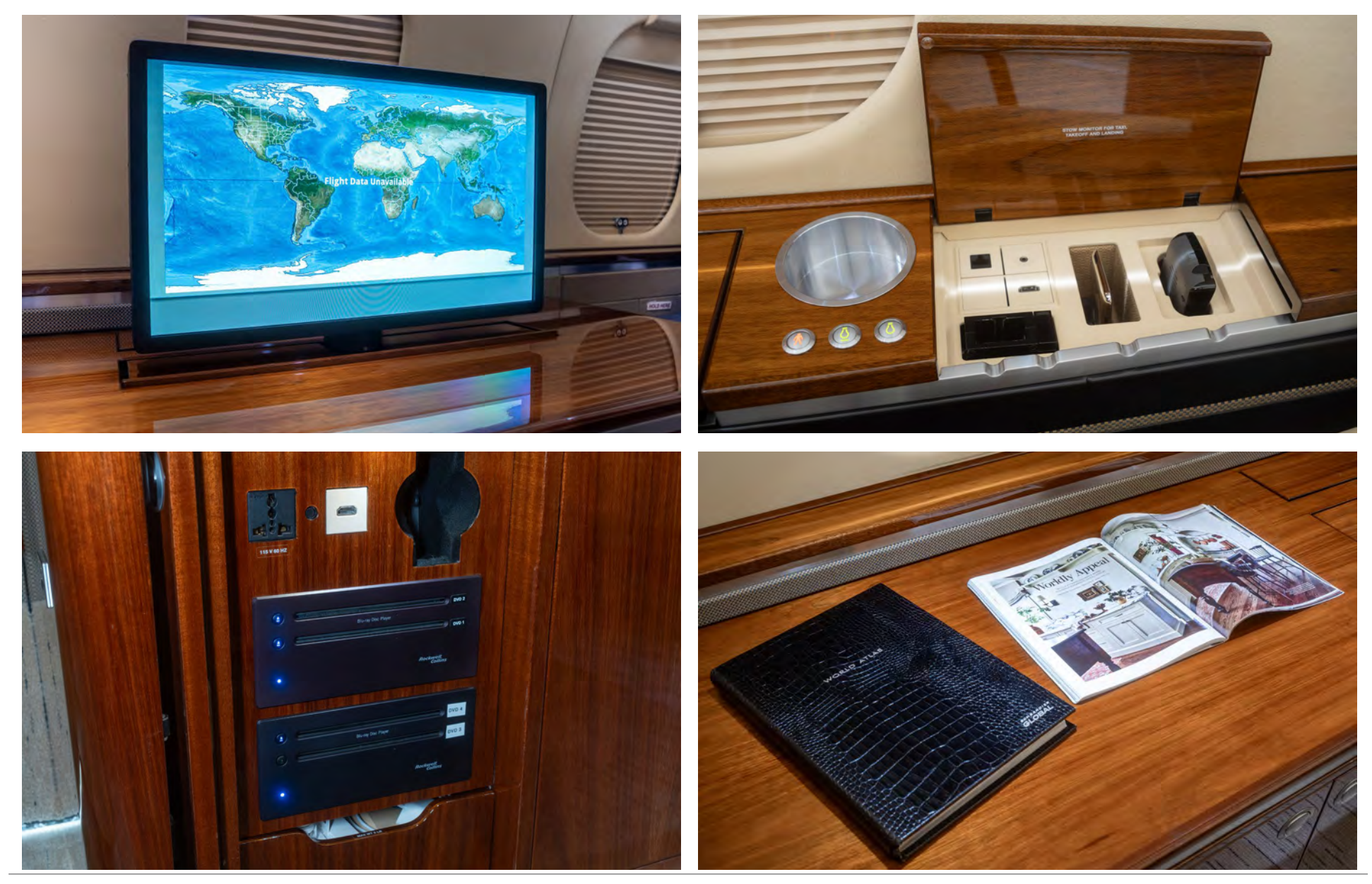
SPECIFICATIONS ARE PROVIDED FOR INFORMATIONAL PURPOSES ONLY AND DO NOT CONSTITUTE REPRESENTATIONS OR WARRANTIES. THESE SPECIFICATIONS ARE SUBJECT TO BUYER'S INDEPENDENT VERIFICATION UPON INSPECTION. THE AIRCRAFT IS SUBJECT TO PRIOR SALE, LEASE AND/OR REMOVAL FROM THE MARKET WITHOUT PRIOR NOTICE. OCTOBER 7, 2024 10:33 AM