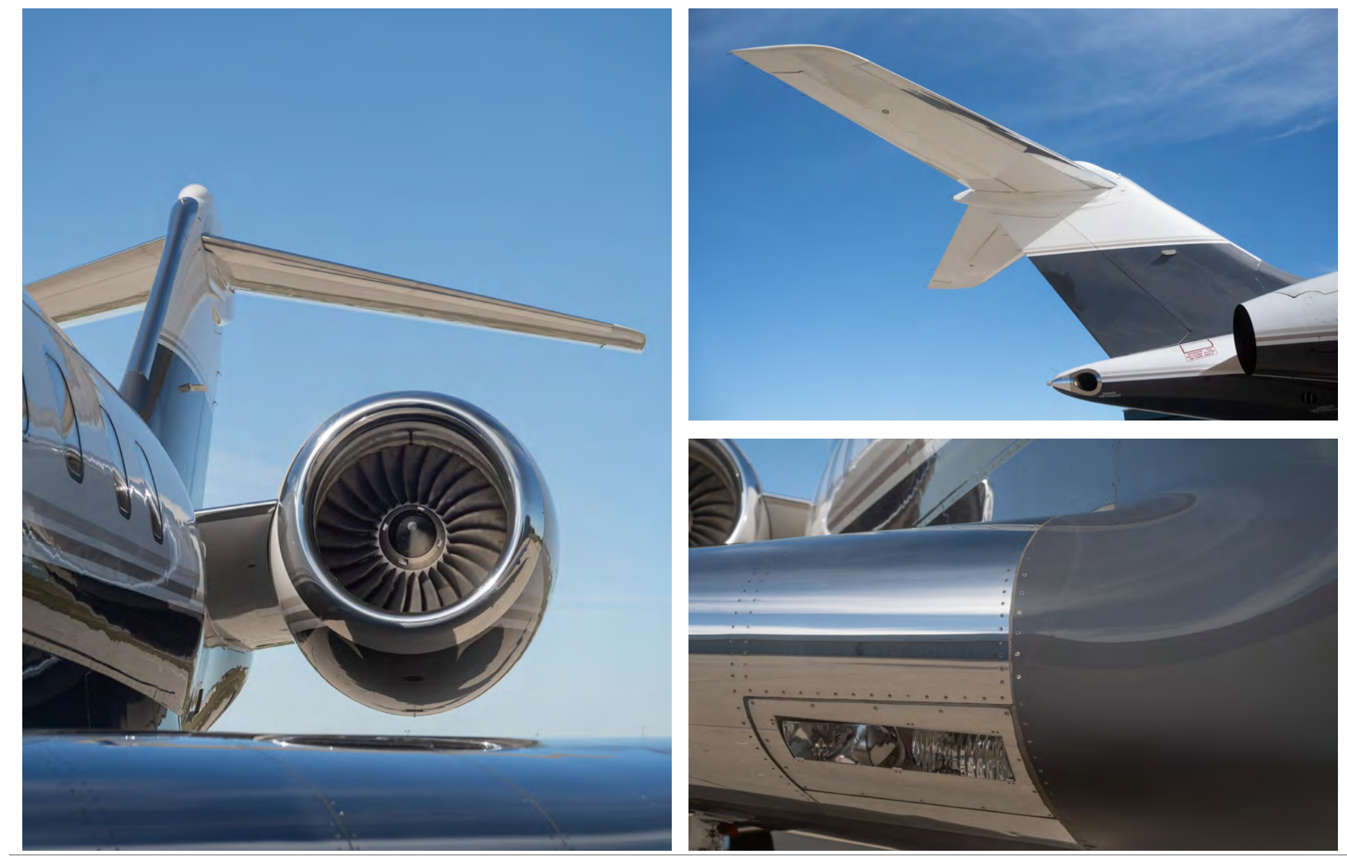
SPECIFICATIONS ARE PROVIDED FOR INFORMATIONAL PURPOSES ONLY AND DO NOT CONSTITUTE REPRESENTATIONS OR WARRANTIES. THESE SPECIFICATIONS ARE SUBJECT TO BUYER'S INDEPENDENT VERIFICATION UPON INSPECTION. THE AIRCRAFT IS SUBJECT TO PRIOR SALE, LEASE AND/OR REMOVAL FROM THE MARKET WITHOUT PRIOR NOTICE. OCTOBER 7, 2024 10:33 AM