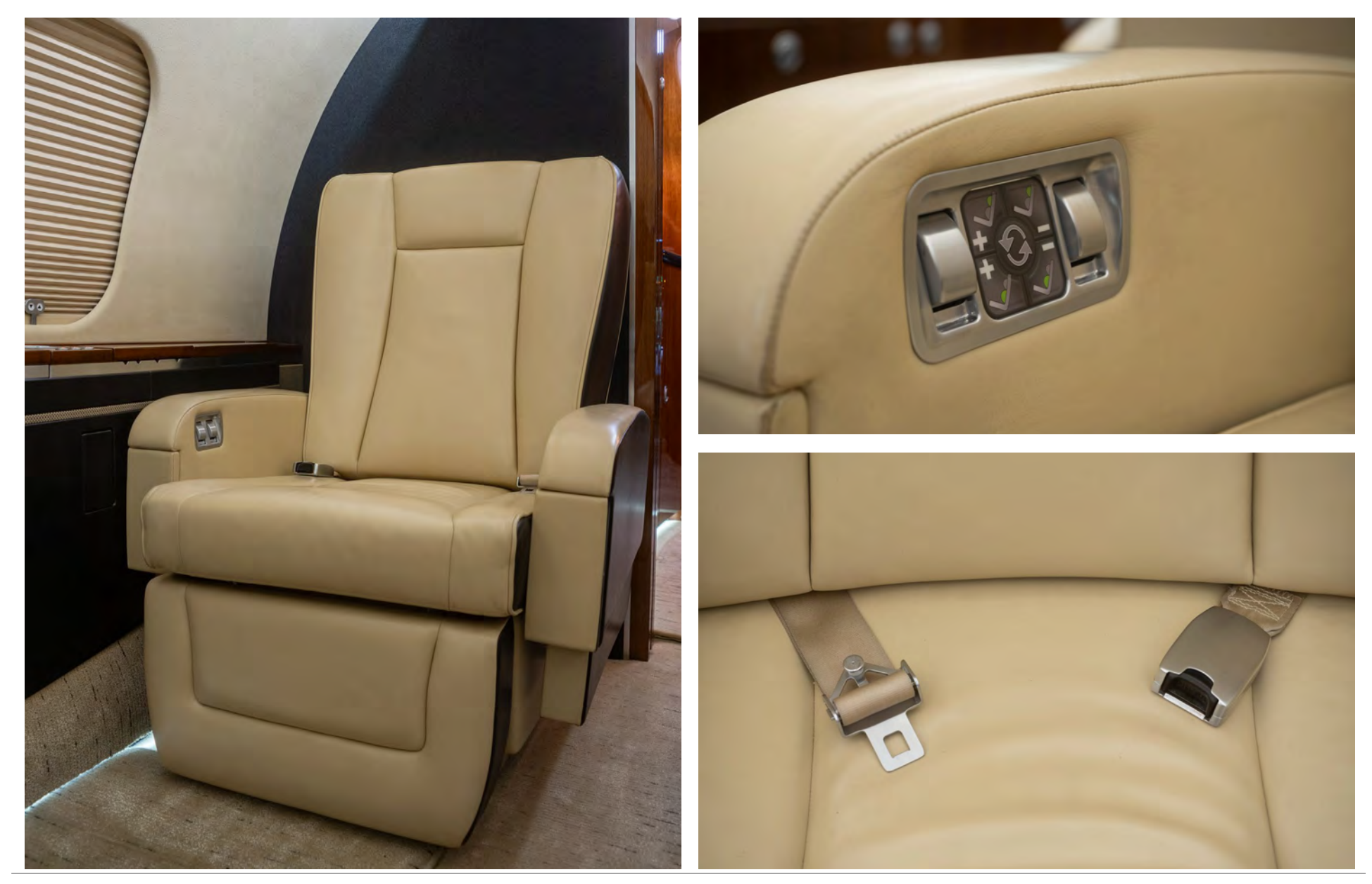
SPECIFICATIONS ARE PROVIDED FOR INFORMATIONAL PURPOSES ONLY AND DO NOT CONSTITUTE REPRESENTATIONS OR WARRANTIES. THESE SPECIFICATIONS ARE SUBJECT TO BUYER'S INDEPENDENT VERIFICATION UPON INSPECTION. THE AIRCRAFT IS SUBJECT TO PRIOR SALE, LEASE AND/OR REMOVAL FROM THE MARKET WITHOUT PRIOR NOTICE. OCTOBER 7, 2024 10:33 AM