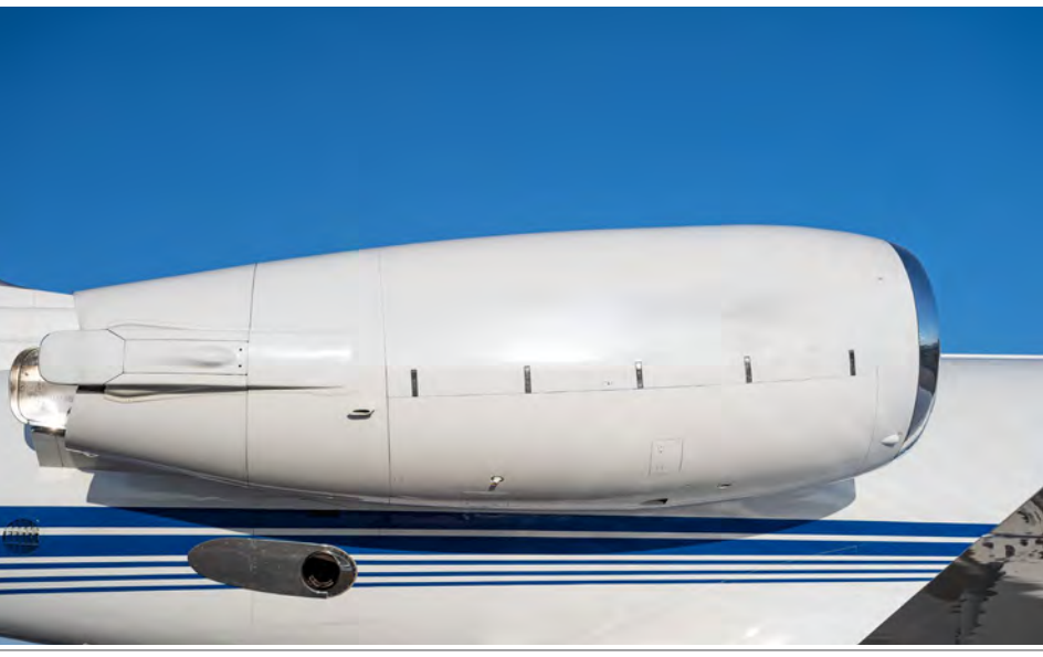
SPECIFICATIONS ARE PROVIDED FOR INFORMATIONAL PURPOSES ONLY AND DO NOT CONSTITUTE REPRESENTATIONS OR WARRANTIES. THESE SPECIFICATIONS ARE SUBJECT TO BUYER'S INDEPENDENT VERIFICATION UPON INSPECTION. THE AIRCRAFT IS SUBJECT TO PRIOR SALE, LEASE AND/OR REMOVAL FROM THE MARKET WITHOUT PRIOR NOTICE. APRIL 7, 2025 10:23 AM