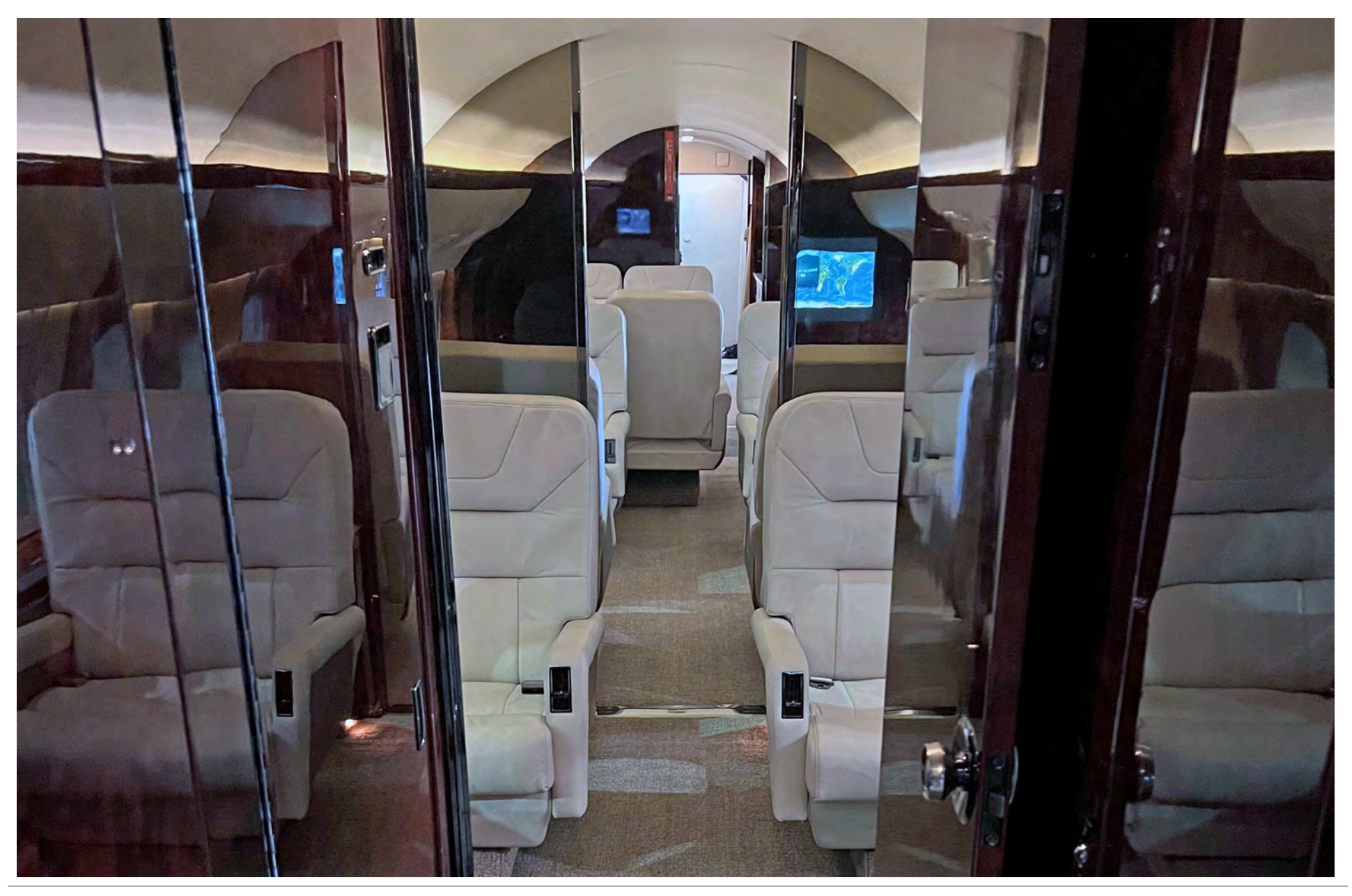
SPECIFICATIONS ARE PROVIDED FOR INFORMATIONAL PURPOSES ONLY AND DO NOT CONSTITUTE REPRESENTATIONS OR WARRANTIES. THESE SPECIFICATIONS ARE SUBJECT TO BUYER'S INDEPENDENT VERIFICATION UPON INSPECTION. THE AIRCRAFT IS SUBJECT TO PRIOR SALE, LEASE AND/OR REMOVAL FROM THE MARKET WITHOUT PRIOR NOTICE. APRIL 7, 2025 10:23 AM