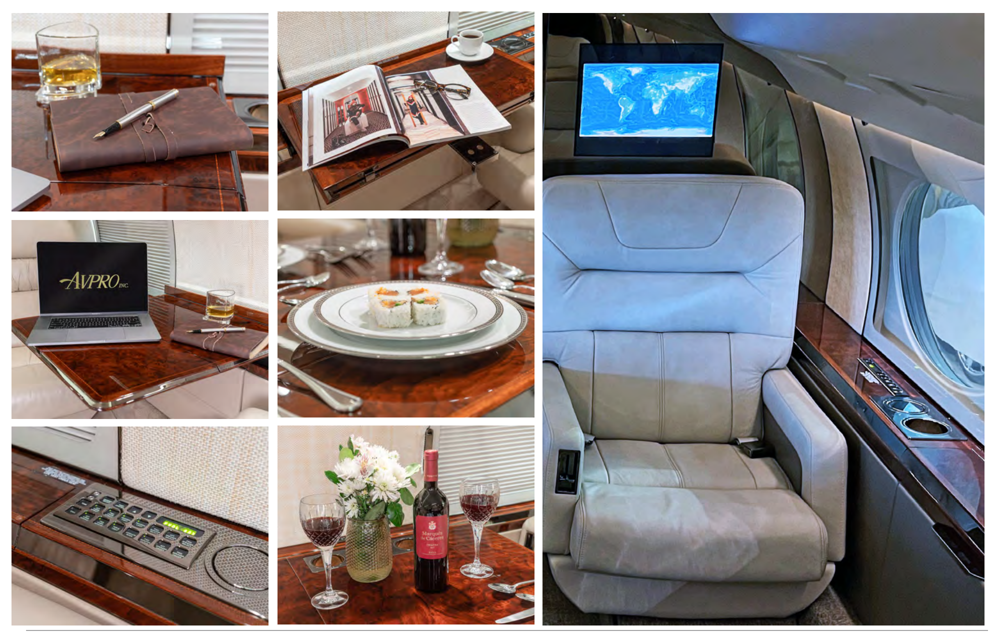
SPECIFICATIONS ARE PROVIDED FOR INFORMATIONAL PURPOSES ONLY AND DO NOT CONSTITUTE REPRESENTATIONS OR WARRANTIES. THESE SPECIFICATIONS ARE SUBJECT TO BUYER'S INDEPENDENT VERIFICATION UPON INSPECTION. THE AIRCRAFT IS SUBJECT TO PRIOR SALE, LEASE AND/OR REMOVAL FROM THE MARKET WITHOUT PRIOR NOTICE. APRIL 7, 2025 10:23 AM