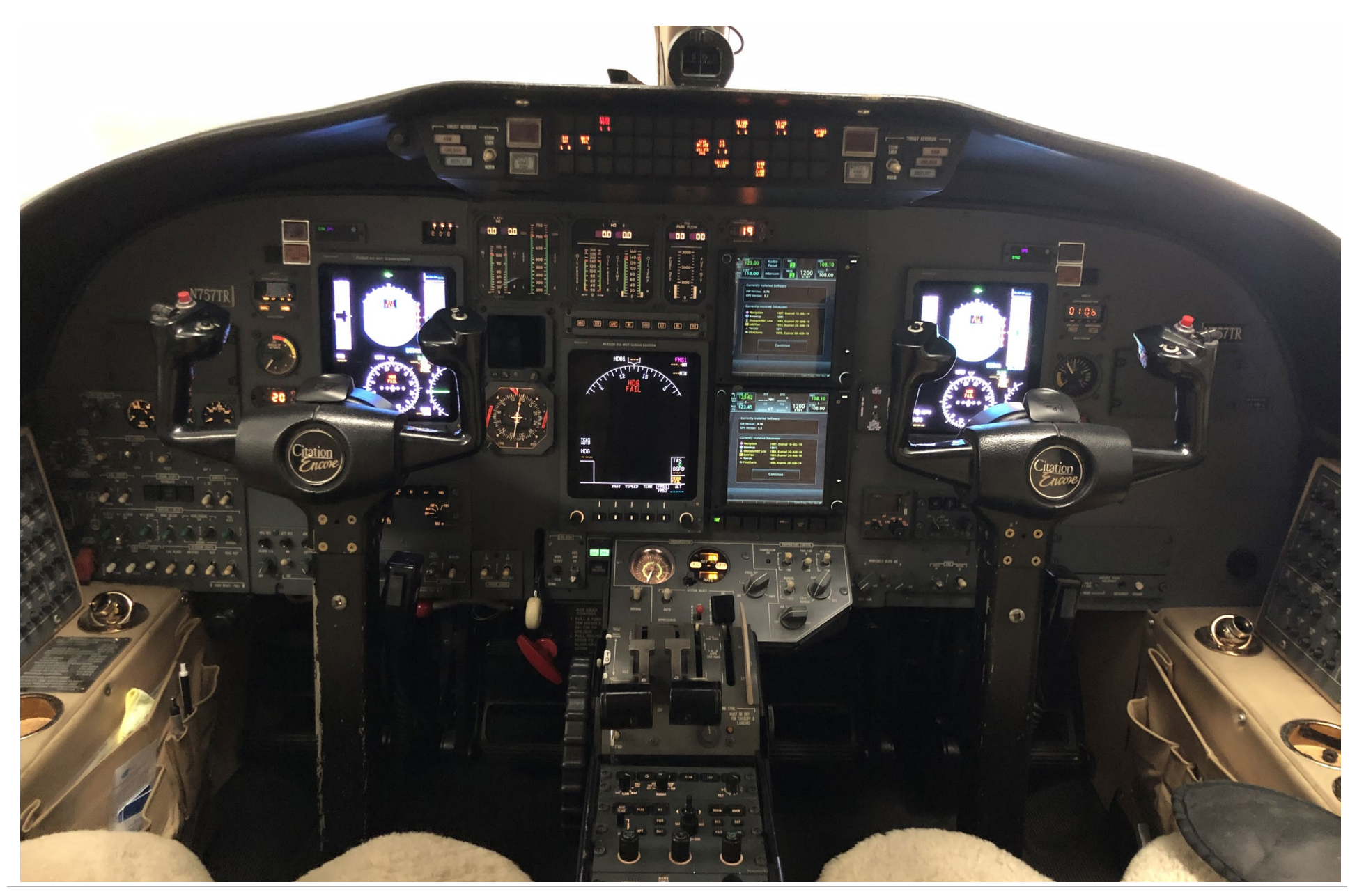
SPECIFICATIONS ARE PROVIDED FOR INFORMATIONAL PURPOSES ONLY AND DO NOT CONSTITUTE REPRESENTATIONS OR WARRANTIES. THESE SPECIFICATIONS ARE SUBJECT TO BUYER'S INDEPENDENT VERIFICATION UPON INSPECTION. THE AIRCRAFT IS SUBJECT TO PRIOR SALE, LEASE AND/OR REMOVAL FROM THE MARKET WITHOUT PRIOR NOTICE. MAY 16, 2025 1:44 PM