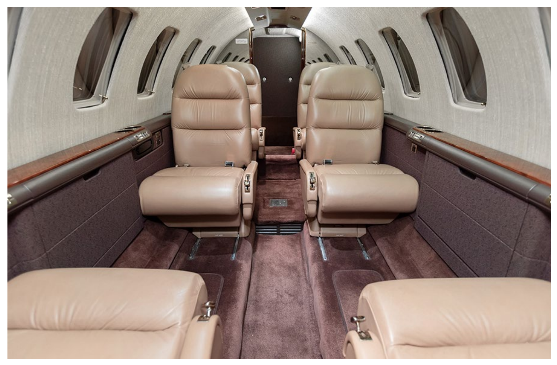
SPECIFICATIONS ARE PROVIDED FOR INFORMATIONAL PURPOSES ONLY AND DO NOT CONSTITUTE REPRESENTATIONS OR WARRANTIES. THESE SPECIFICATIONS ARE SUBJECT TO BUYER'S INDEPENDENT VERIFICATION UPON INSPECTION. THE AIRCRAFT IS SUBJECT TO PRIOR SALE, LEASE AND/OR REMOVAL FROM THE MARKET WITHOUT PRIOR NOTICE. MAY 16, 2025 1:44 PM