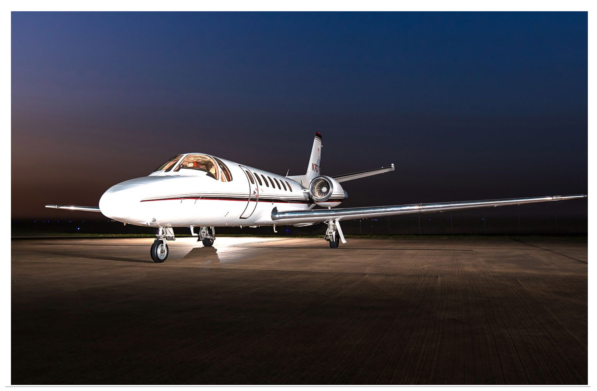
SPECIFICATIONS ARE PROVIDED FOR INFORMATIONAL PURPOSES ONLY AND DO NOT CONSTITUTE REPRESENTATIONS OR WARRANTIES. THESE SPECIFICATIONS ARE SUBJECT TO BUYER'S INDEPENDENT VERIFICATION UPON INSPECTION. THE AIRCRAFT IS SUBJECT TO PRIOR SALE, LEASE AND/OR REMOVAL FROM THE MARKET WITHOUT PRIOR NOTICE. MAY 16, 2025 1:44 PM