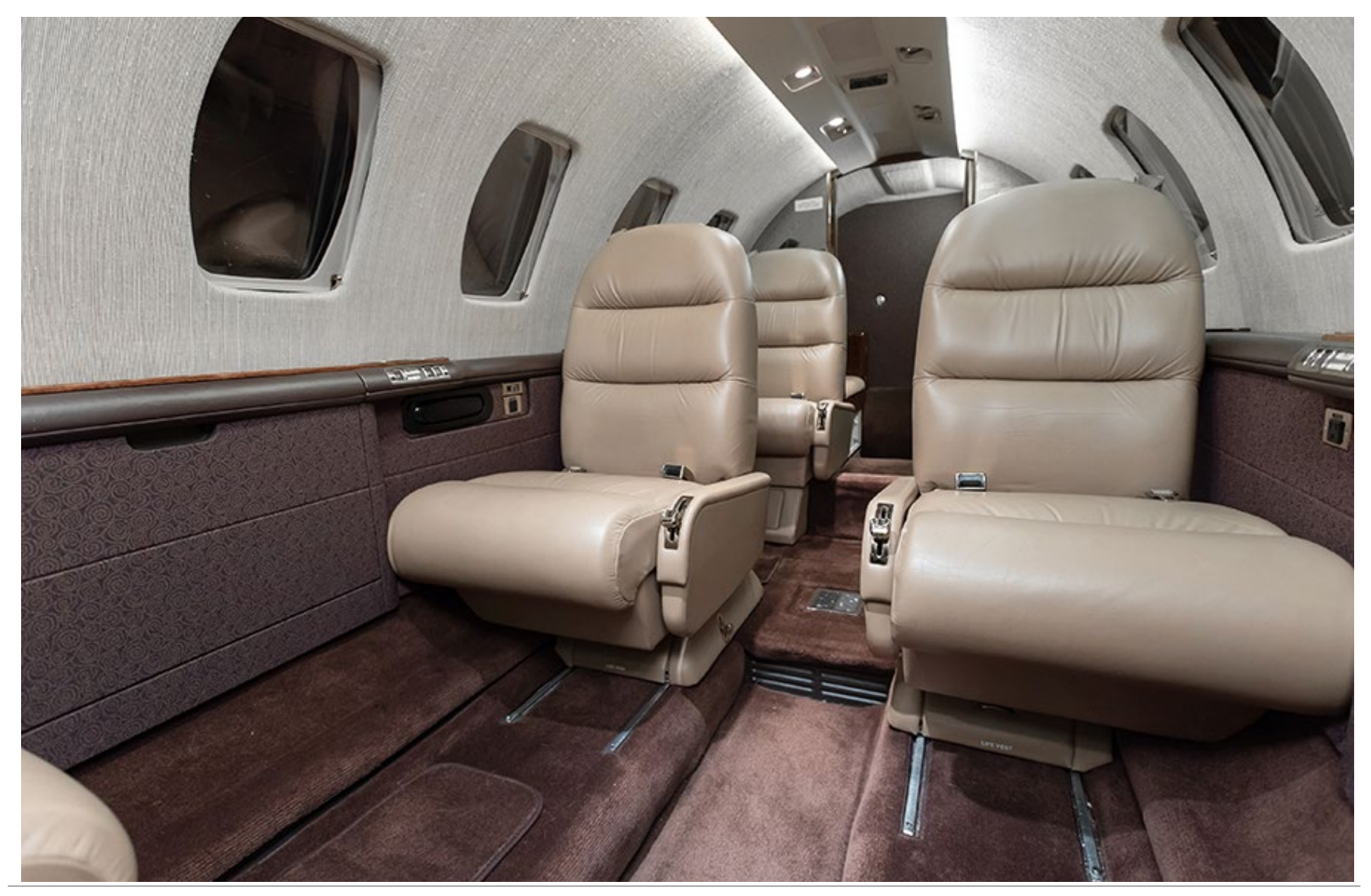
SPECIFICATIONS ARE PROVIDED FOR INFORMATIONAL PURPOSES ONLY AND DO NOT CONSTITUTE REPRESENTATIONS OR WARRANTIES. THESE SPECIFICATIONS ARE SUBJECT TO BUYER'S INDEPENDENT VERIFICATION UPON INSPECTION. THE AIRCRAFT IS SUBJECT TO PRIOR SALE, LEASE AND/OR REMOVAL FROM THE MARKET WITHOUT PRIOR NOTICE. MAY 16, 2025 1:44 PM