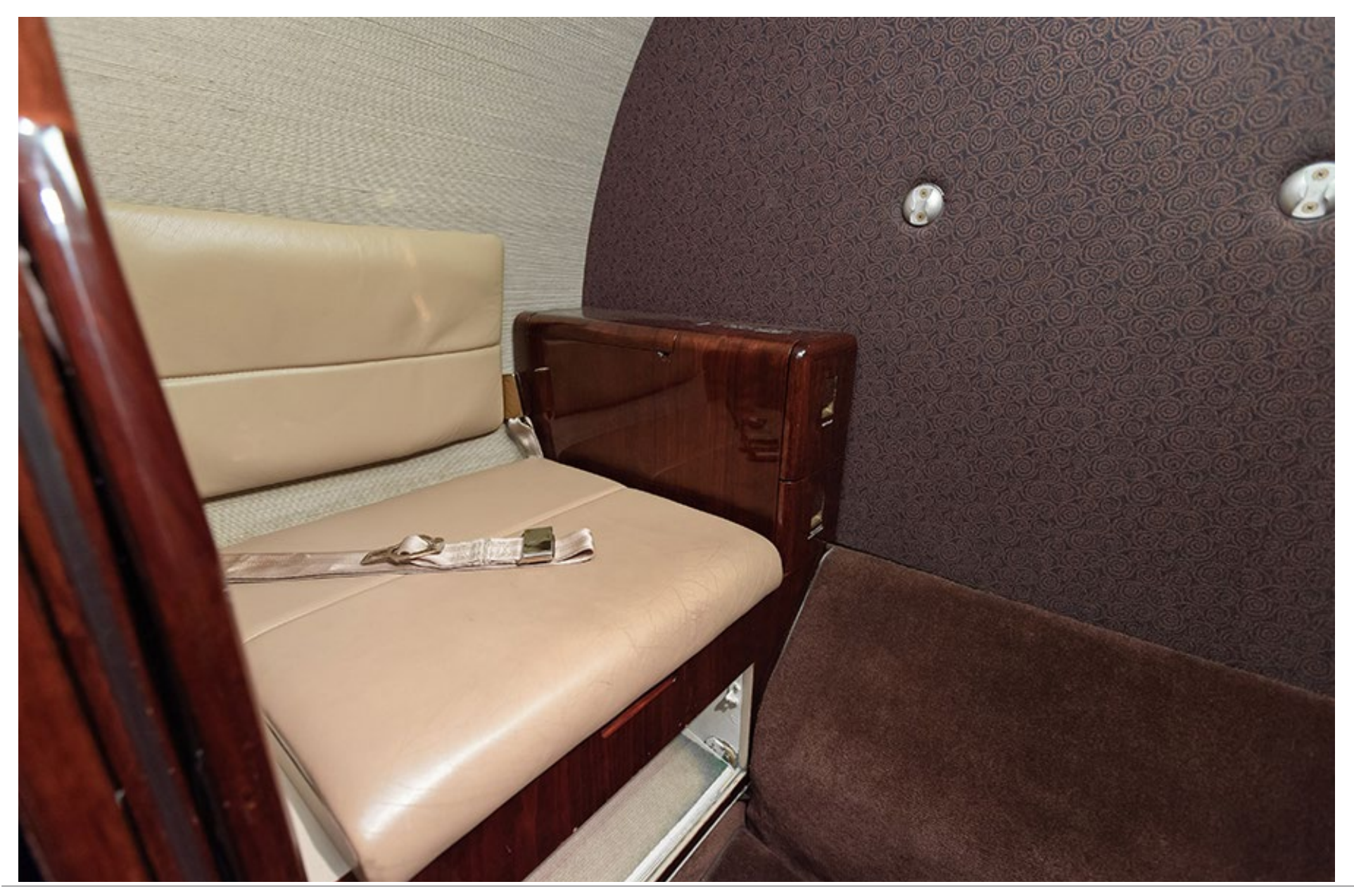
SPECIFICATIONS ARE PROVIDED FOR INFORMATIONAL PURPOSES ONLY AND DO NOT CONSTITUTE REPRESENTATIONS OR WARRANTIES. THESE SPECIFICATIONS ARE SUBJECT TO BUYER'S INDEPENDENT VERIFICATION UPON INSPECTION. THE AIRCRAFT IS SUBJECT TO PRIOR SALE, LEASE AND/OR REMOVAL FROM THE MARKET WITHOUT PRIOR NOTICE. MAY 16, 2025 1:44 PM