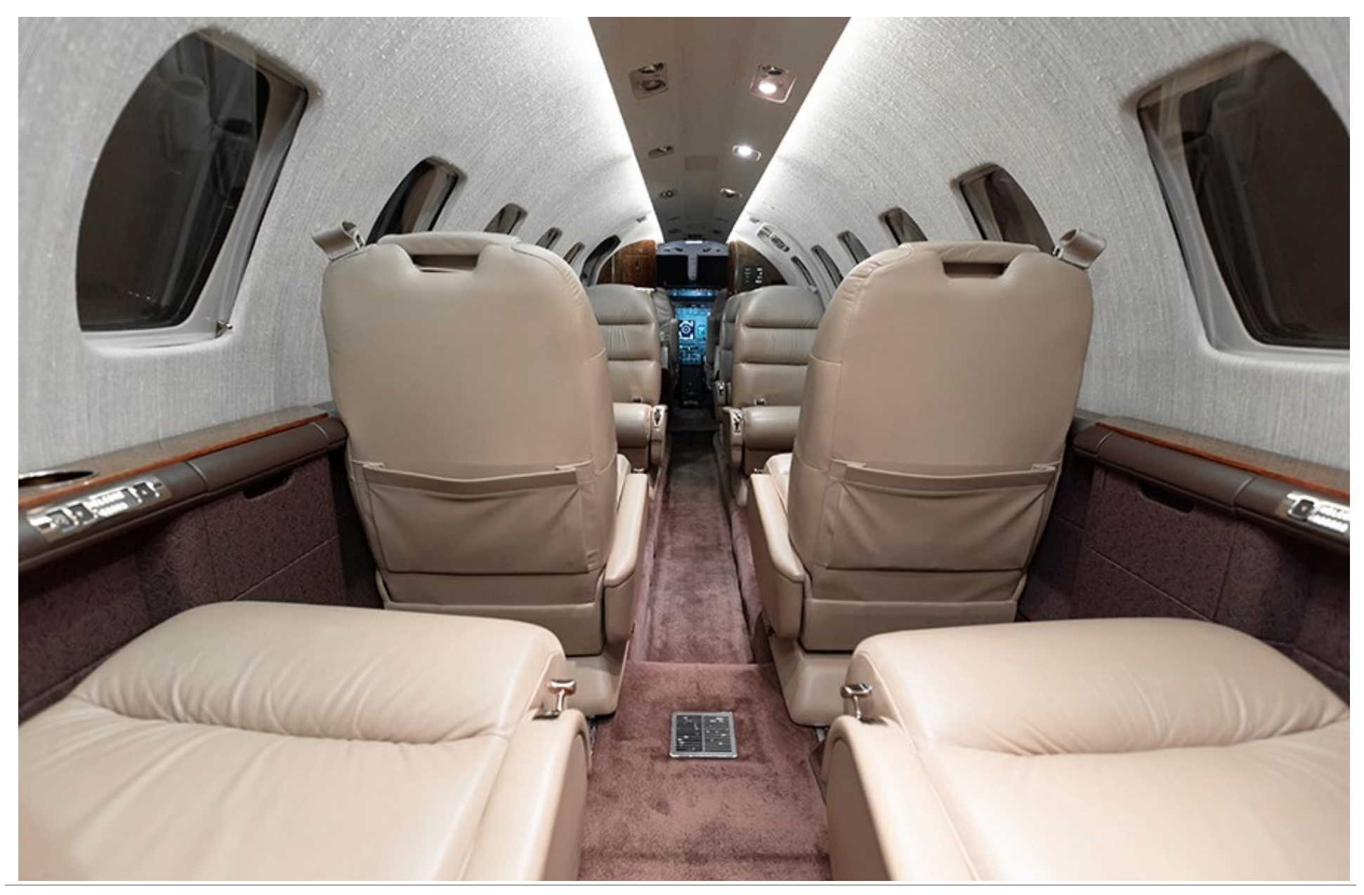
SPECIFICATIONS ARE PROVIDED FOR INFORMATIONAL PURPOSES ONLY AND DO NOT CONSTITUTE REPRESENTATIONS OR WARRANTIES. THESE SPECIFICATIONS ARE SUBJECT TO BUYER'S INDEPENDENT VERIFICATION UPON INSPECTION THE AIRCRAFT IS SUBJECT TO PRIOR SALE, LEASE AND/OR REMOVAL FROM THE MARKET WITHOUT PRIOR NOTICE. MAY 16, 2025 1:44 PM