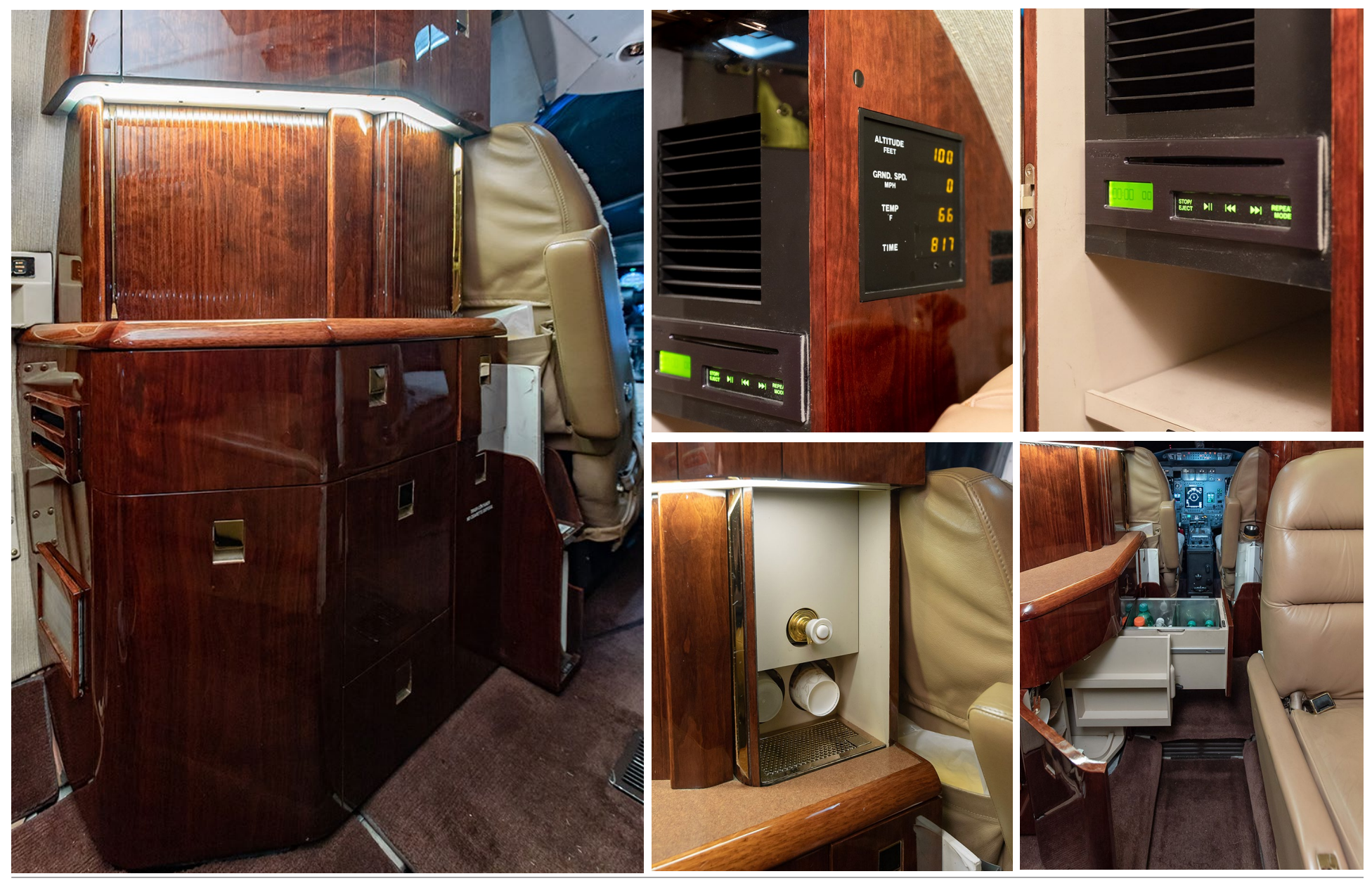
SPECIFICATIONS ARE PROVIDED FOR INFORMATIONAL PURPOSES ONLY AND DO NOT CONSTITUTE REPRESENTATIONS OR WARRANTIES. THESE SPECIFICATIONS ARE SUBJECT TO BUYER'S INDEPENDENT VERIFICATION UPON INSPECTION. THE AIRCRAFT IS SUBJECT TO PRIOR SALE, LEASE AND/OR REMOVAL FROM THE MARKET WITHOUT PRIOR NOTICE. MAY 16, 2025 1:44 PM