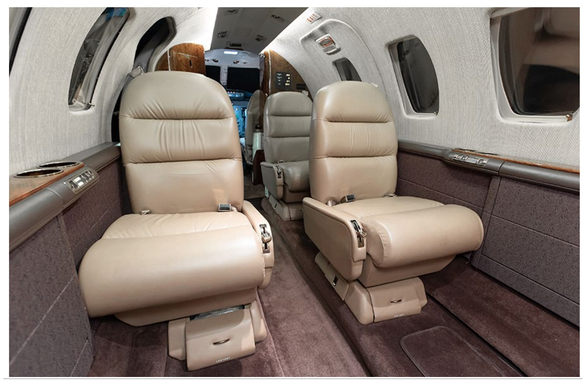
SPECIFICATIONS ARE PROVIDED FOR INFORMATIONAL PURPOSES ONLY AND DO NOT CONSTITUTE REPRESENTATIONS OR WARRANTIES. THESE SPECIFICATIONS ARE SUBJECT TO BUYER'S INDEPENDENT VERIFICATION UPON INSPECTION. THE AIRCRAFT IS SUBJECT TO PRIOR SALE, LEASE AND/OR REMOVAL FROM THE MARKET WITHOUT PRIOR NOTICE. MAY 16, 2025 1:44 PM