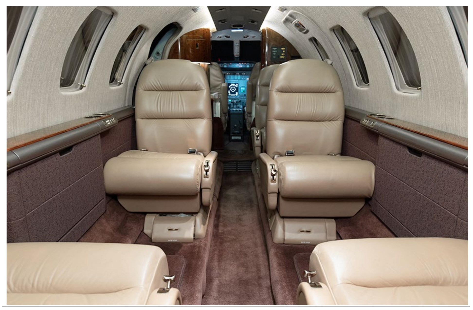
SPECIFICATIONS ARE PROVIDED FOR INFORMATIONAL PURPOSES ONLY AND DO NOT CONSTITUTE REPRESENTATIONS OR WARRANTIES. THESE SPECIFICATIONS ARE SUBJECT TO BUYER'S INDEPENDENT VERIFICATION UPON INSPECTION. THE AIRCRAFT IS SUBJECT TO PRIOR SALE, LEASE AND/OR REMOVAL FROM THE MARKET WITHOUT PRIOR NOTICE. MAY 16, 2025 1:44 PM