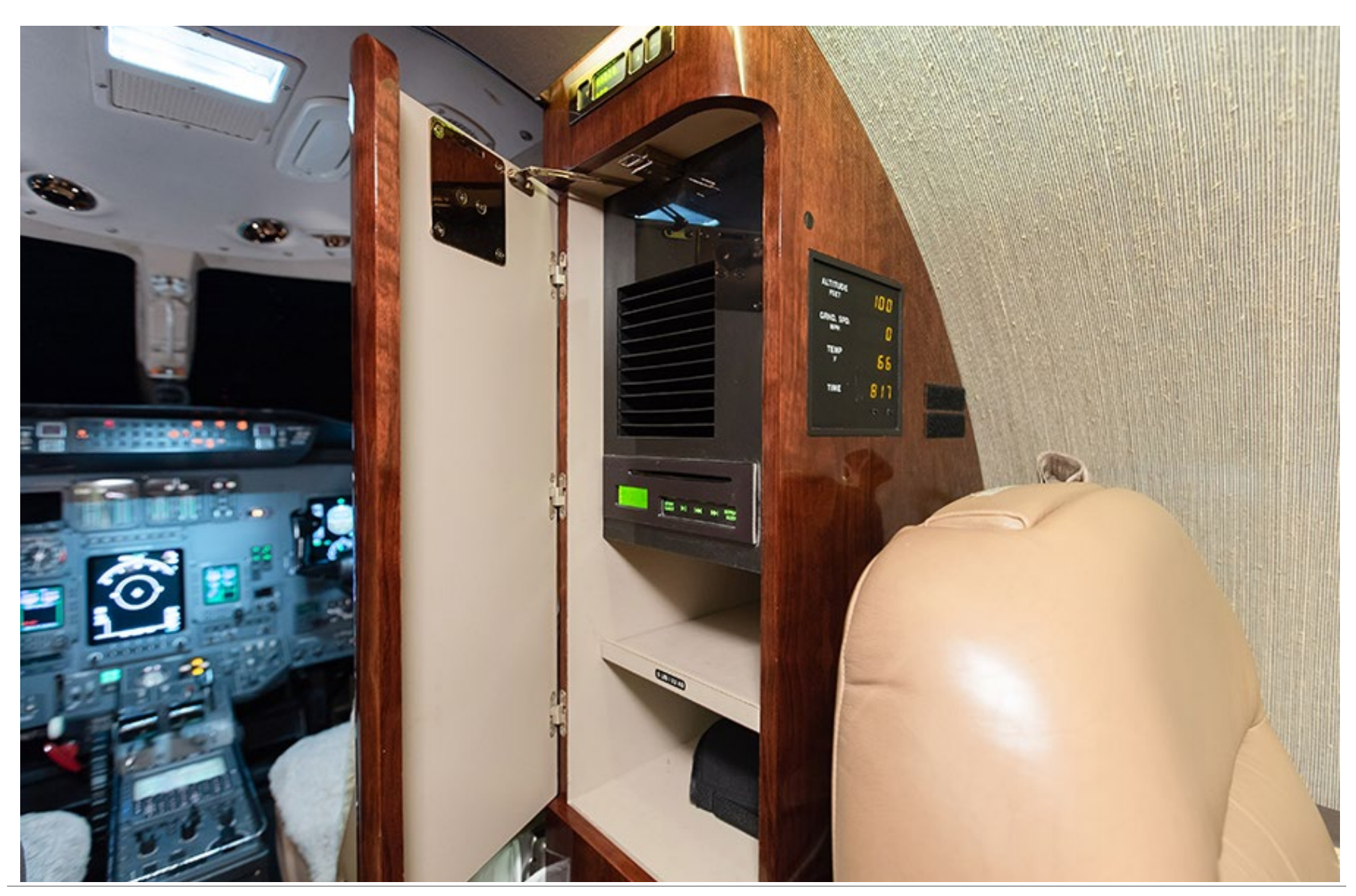
SPECIFICATIONS ARE PROVIDED FOR INFORMATIONAL PURPOSES ONLY AND DO NOT CONSTITUTE REPRESENTATIONS OR WARRANTIES. THESE SPECIFICATIONS ARE SUBJECT TO BUYER'S INDEPENDENT VERIFICATION UPON INSPECTION. THE AIRCRAFT IS SUBJECT TO PRIOR SALE, LEASE AND/OR REMOVAL FROM THE MARKET WITHOUT PRIOR NOTICE. MAY 16, 2025 1:44 PM