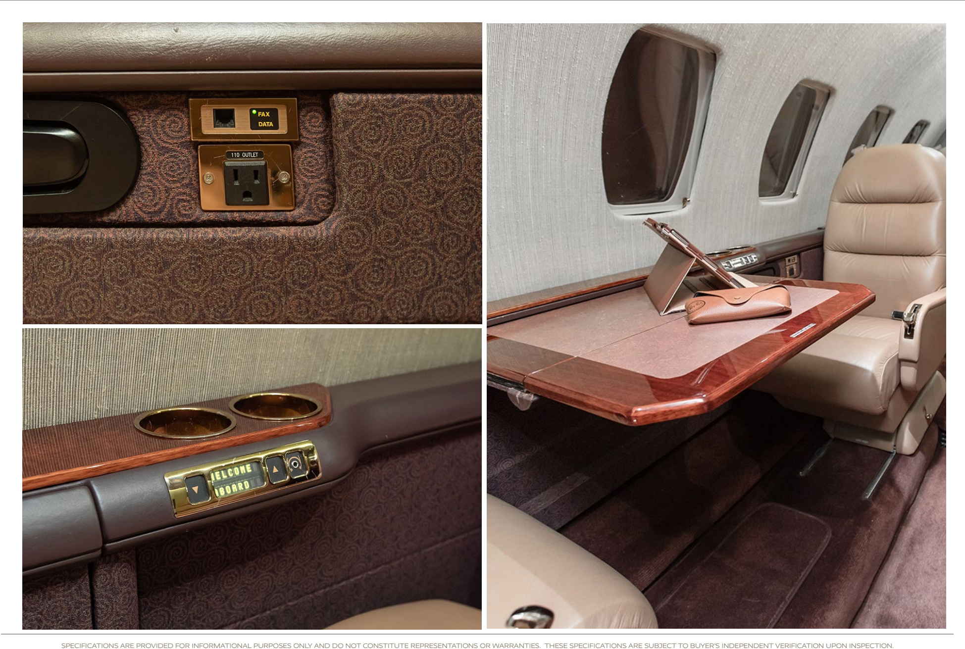
THE AIRCRAFT IS SUBJECT TO PRIOR SALE, LEASE AND/OR REMOVAL FROM THE MARKET WITHOUT PRIOR NOTICE. MAY 16, 2025 1:44 PM