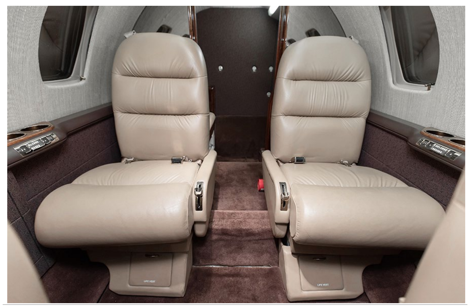
SPECIFICATIONS ARE PROVIDED FOR INFORMATIONAL PURPOSES ONLY AND DO NOT CONSTITUTE REPRESENTATIONS OR WARRANTIES. THESE SPECIFICATIONS ARE SUBJECT TO BUYER'S INDEPENDENT VERIFICATION UPON INSPECTION. THE AIRCRAFT IS SUBJECT TO PRIOR SALE, LEASE AND/OR REMOVAL FROM THE MARKET WITHOUT PRIOR NOTICE. MAY 16, 2025 1:44 PM