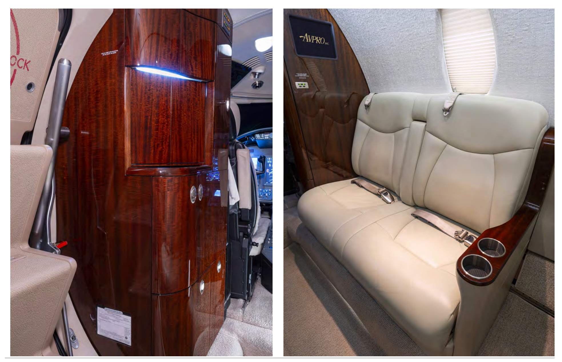
SPECIFICATIONS ARE PROVIDED FOR INFORMATIONAL PURPOSES ONLY AND DO NOT CONSTITUTE REPRESENTATIONS OR WARRANTIES. THESE SPECIFICATIONS ARE SUBJECT TO BUYER'S INDEPENDENT VERIFICATION UPON INSPECTION. THE AIRCRAFT IS SUBJECT TO PRIOR SALE, LEASE AND/OR REMOVAL FROM THE MARKET WITHOUT PRIOR NOTICE. JUNE 9, 2025 2:18 PM