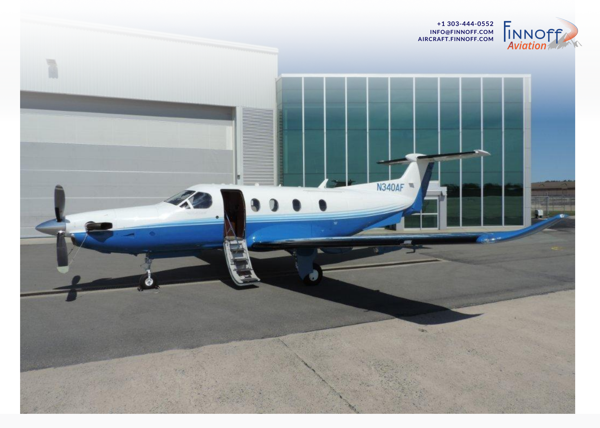
2012 PILATUS PC-12 NG S/N 1340