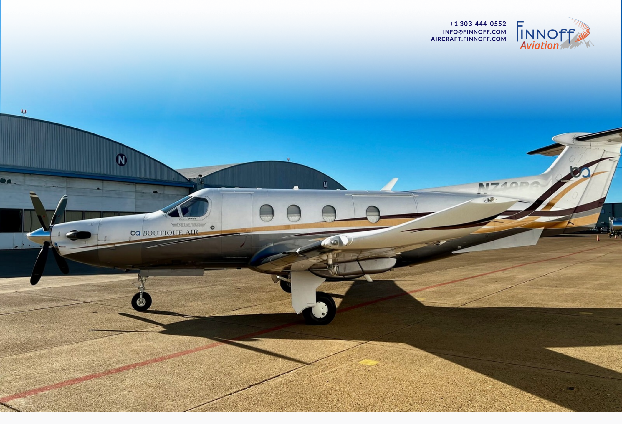
2006 PILATUS PC-12/47 S/N 719