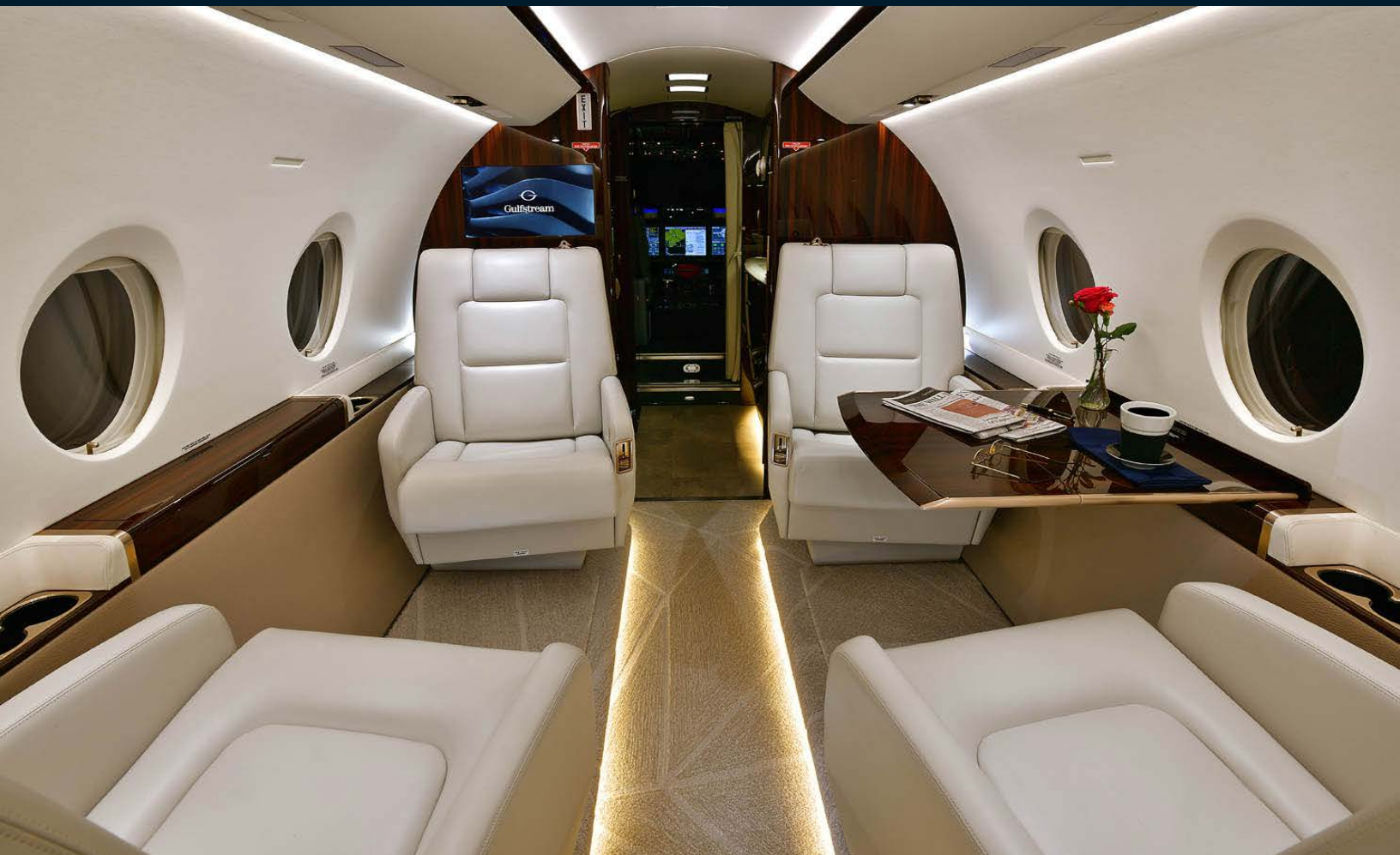
Forward cabin looking forward