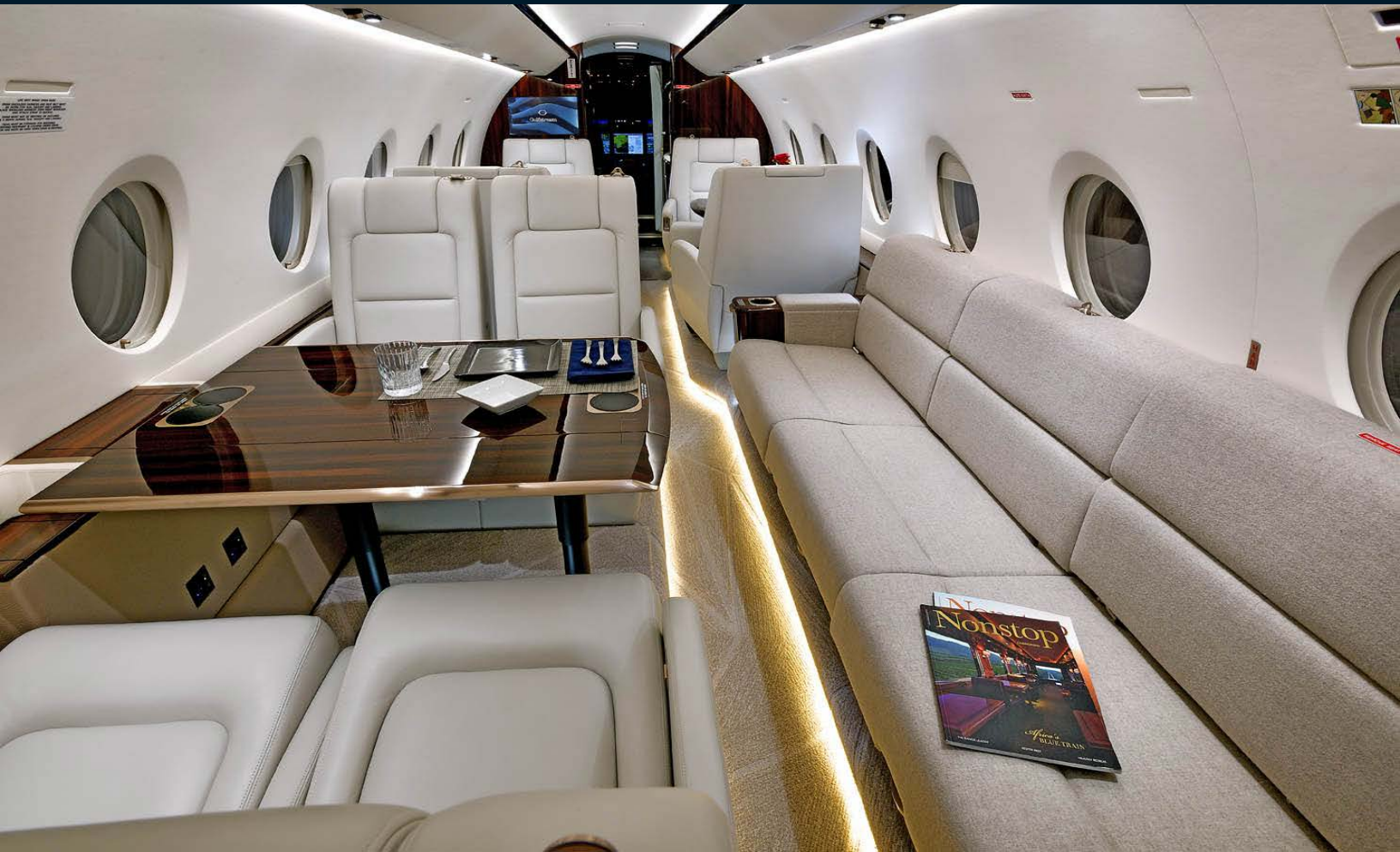
Aft cabin looking forward