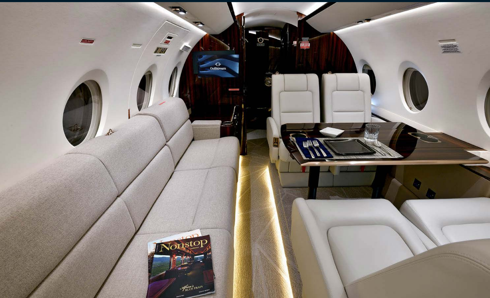
Aft cabin looking aft