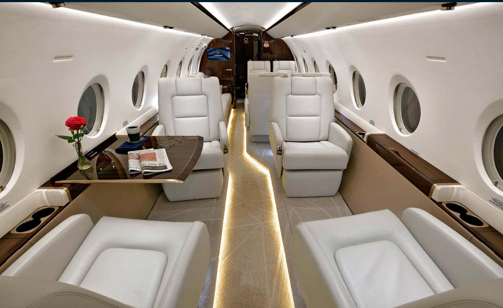
Forward cabin looking aft