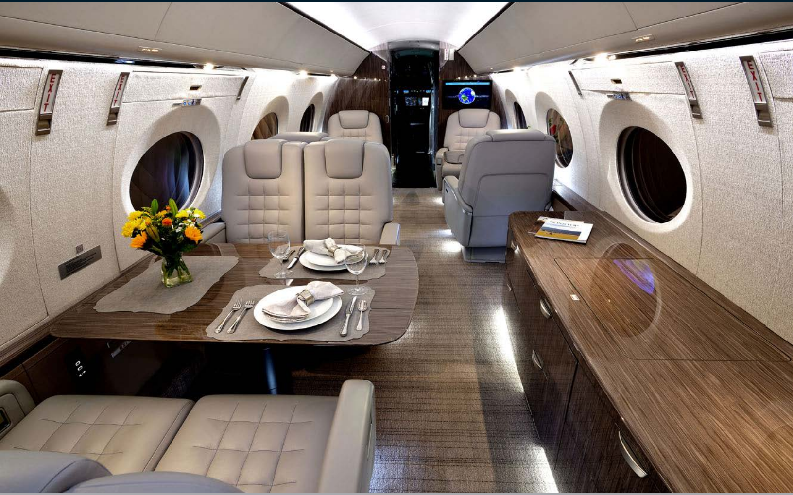
Mid cabin looking forward