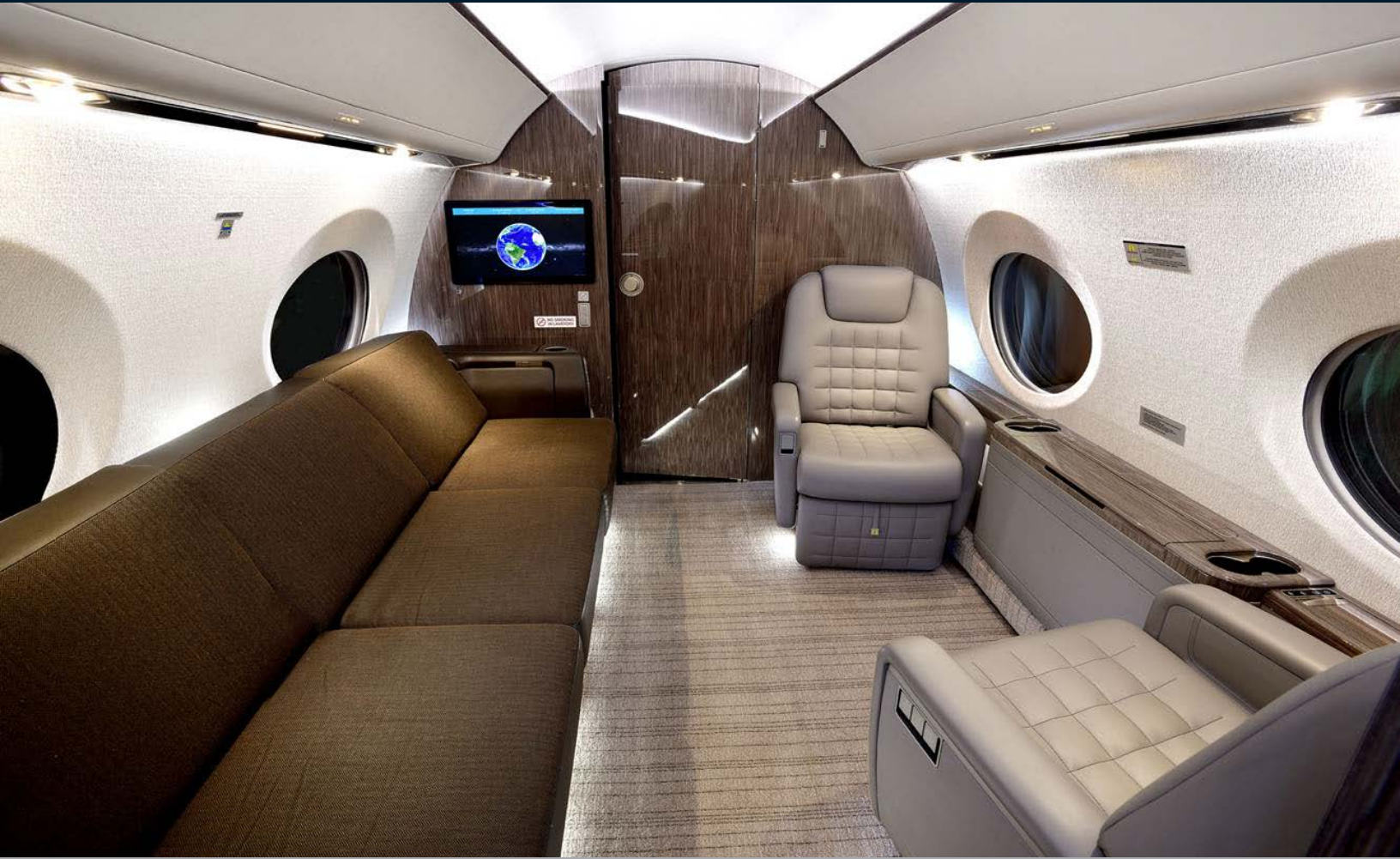
Aft cabin looking aft