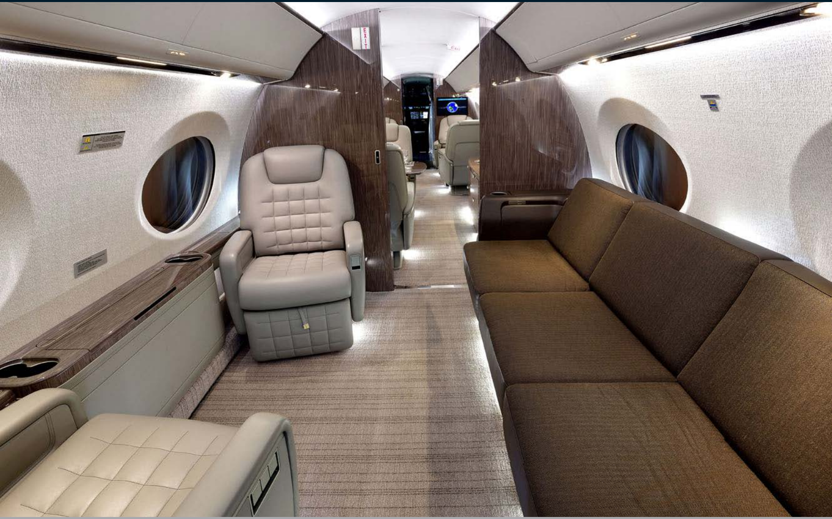
Aft cabin looking forward