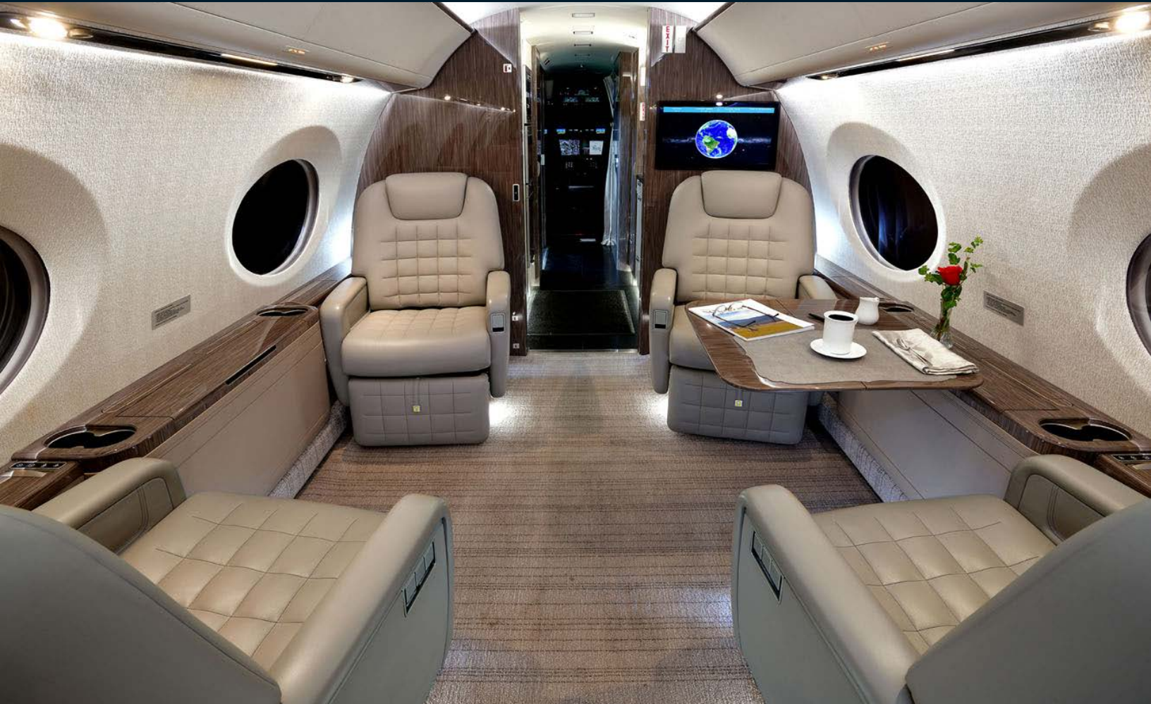
Forward cabin looking fwd