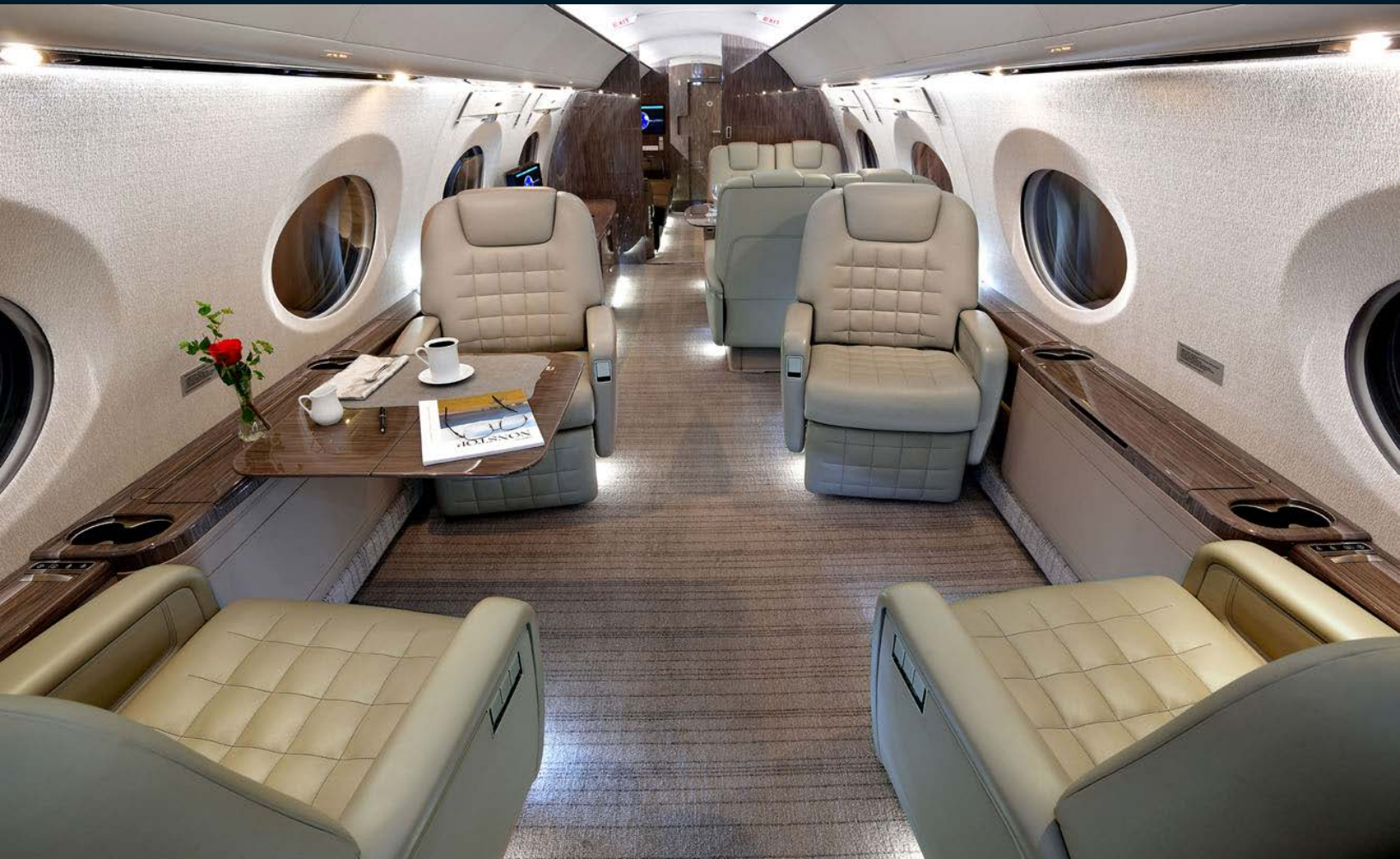
Forward cabin looking aft