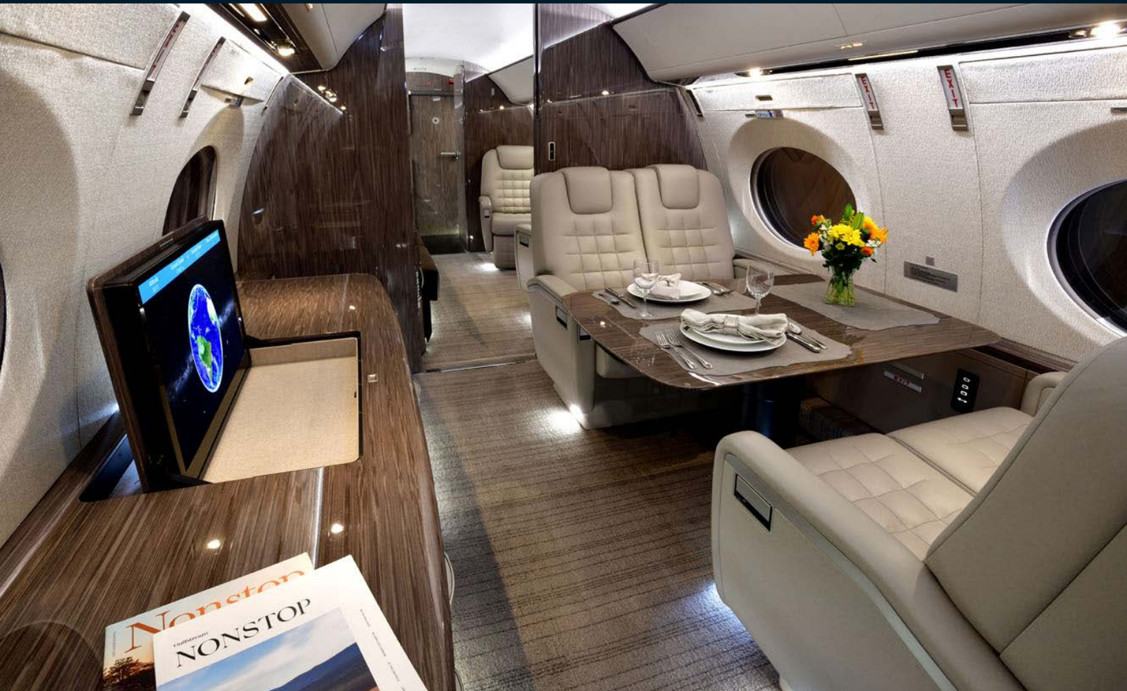
Mid cabin looking aft