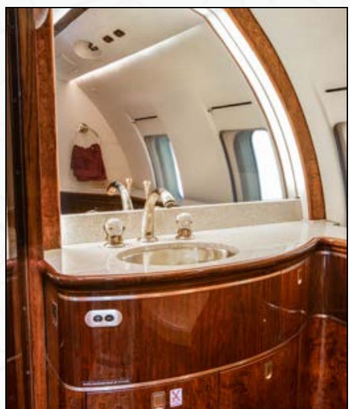
FORWARD CREW REST