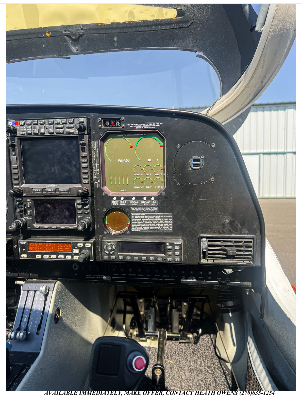
Specifications and descriptions are provided as introductory information. They do not constitute representations or warranties of International Aircraft Marketing & Sales, LLC. Accordingly, you should rely on your own inspection of the aircraft prior to making any purchase or offer to purchase.