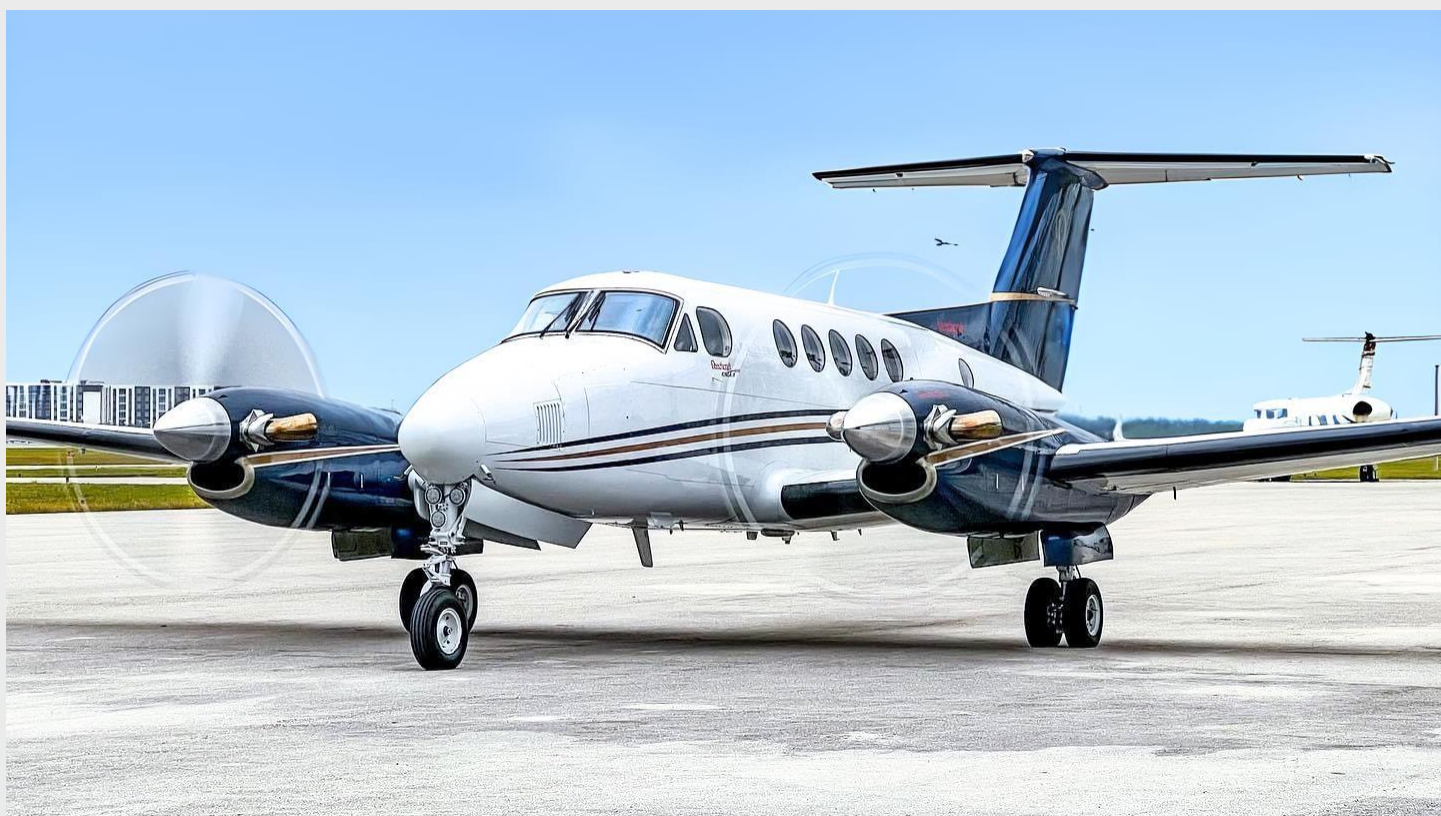
KING AIR 200 – BB-454 – N970KR

INTERNATIONAL AIRCRAFT MARKETING & SALES