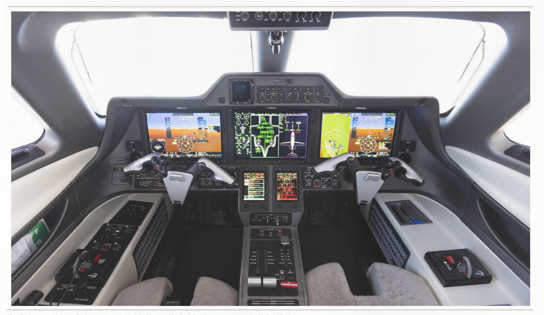
*Specifications are subject to verification upon inspection and should not provide a basis for reliance or create any other binding obligation.