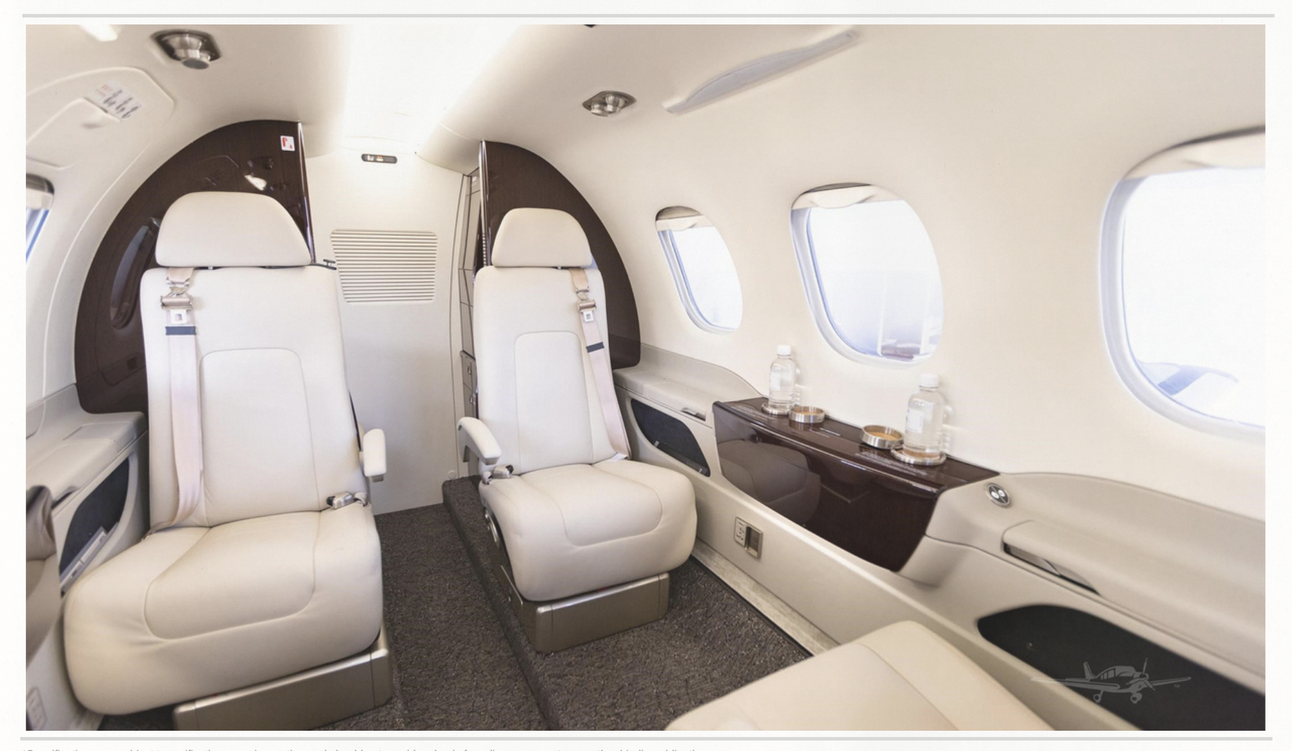
*Specifications are subject to verification upon inspection and should not provide a basis for reliance or create any other binding obligation.