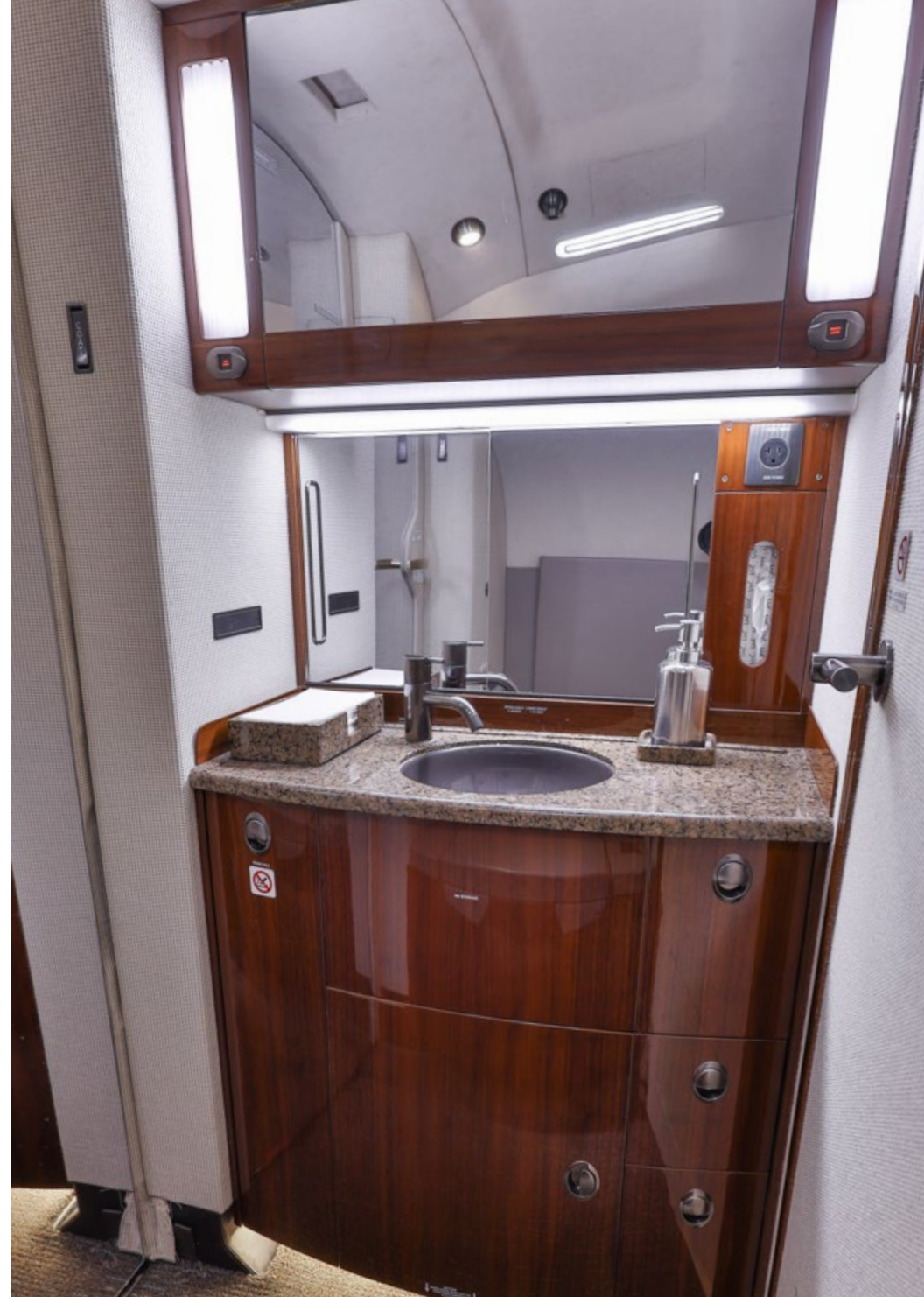
2009 FALCON 900EX EASY SERIAL NUMBER 215