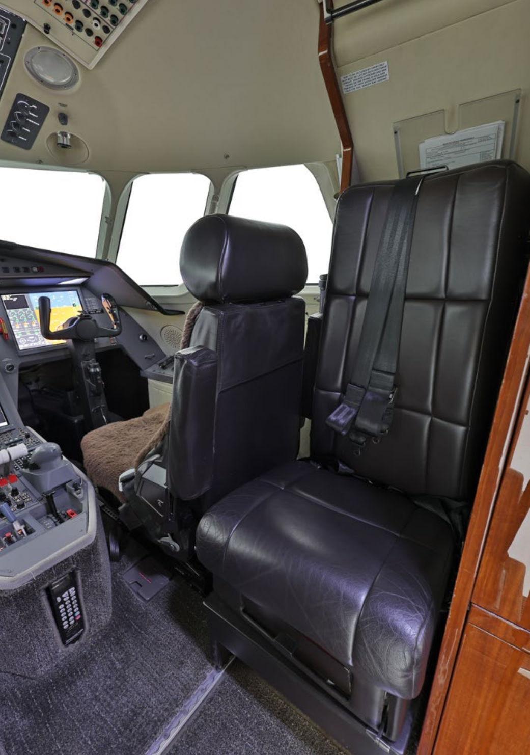
2009 FALCON 900EX EASY SERIAL NUMBER 215