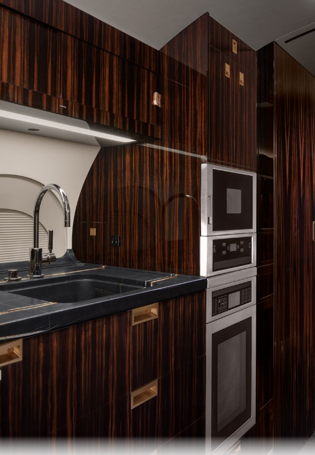
2022 GULFSTREAM G650ER SERIAL NUMBER 6503