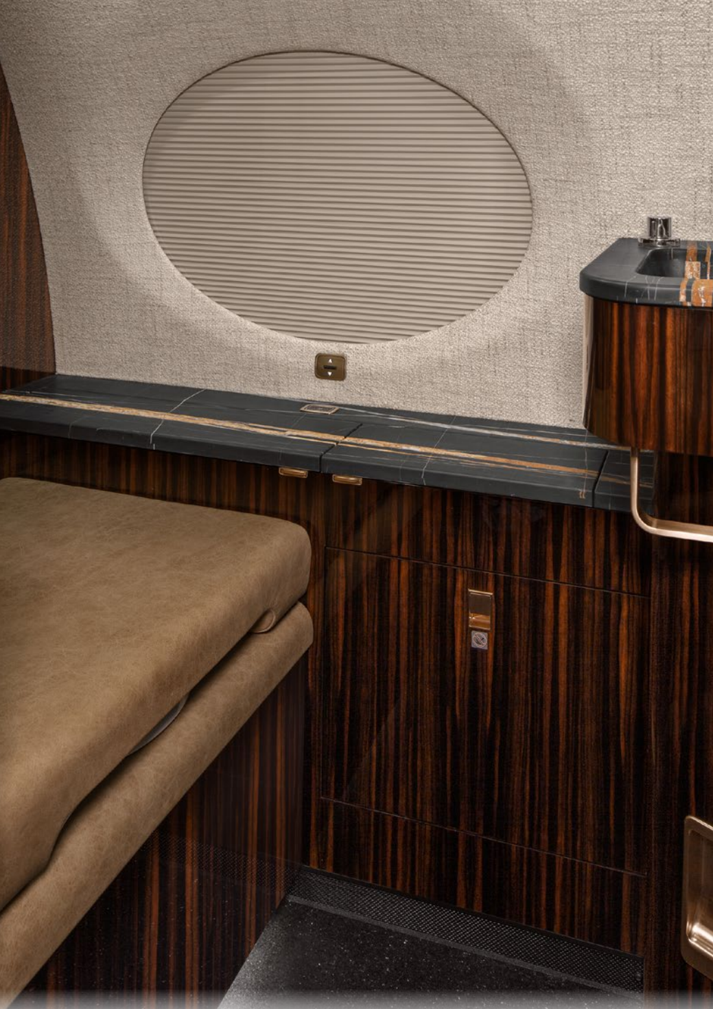
2022 GULFSTREAM G650ER SERIAL NUMBER 6503