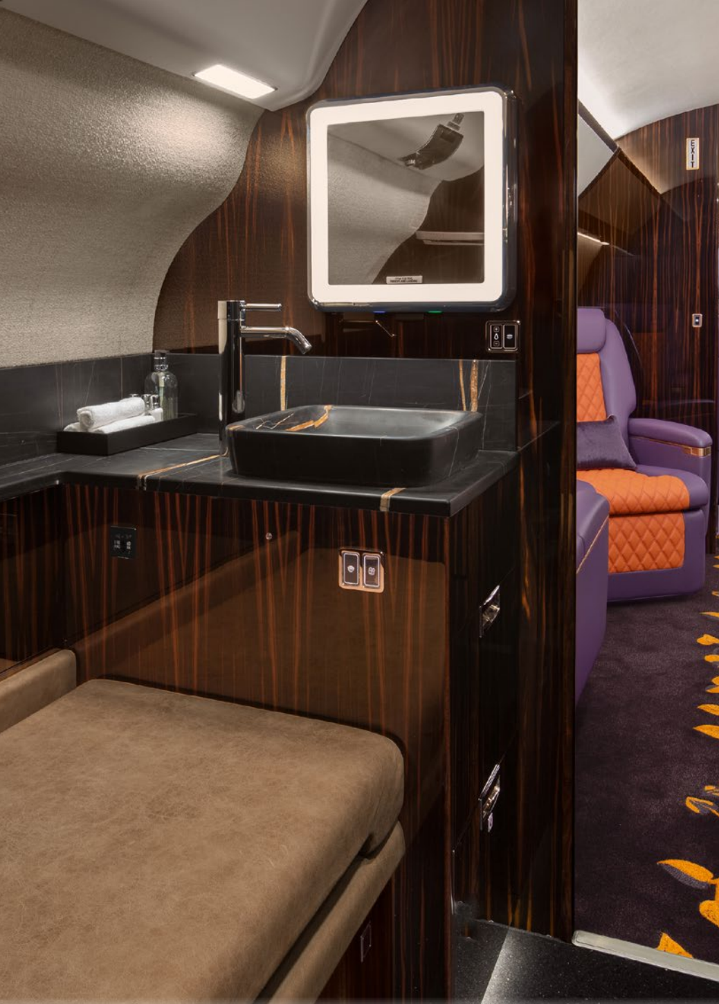
2022 GULFSTREAM G650ER SERIAL NUMBER 6503