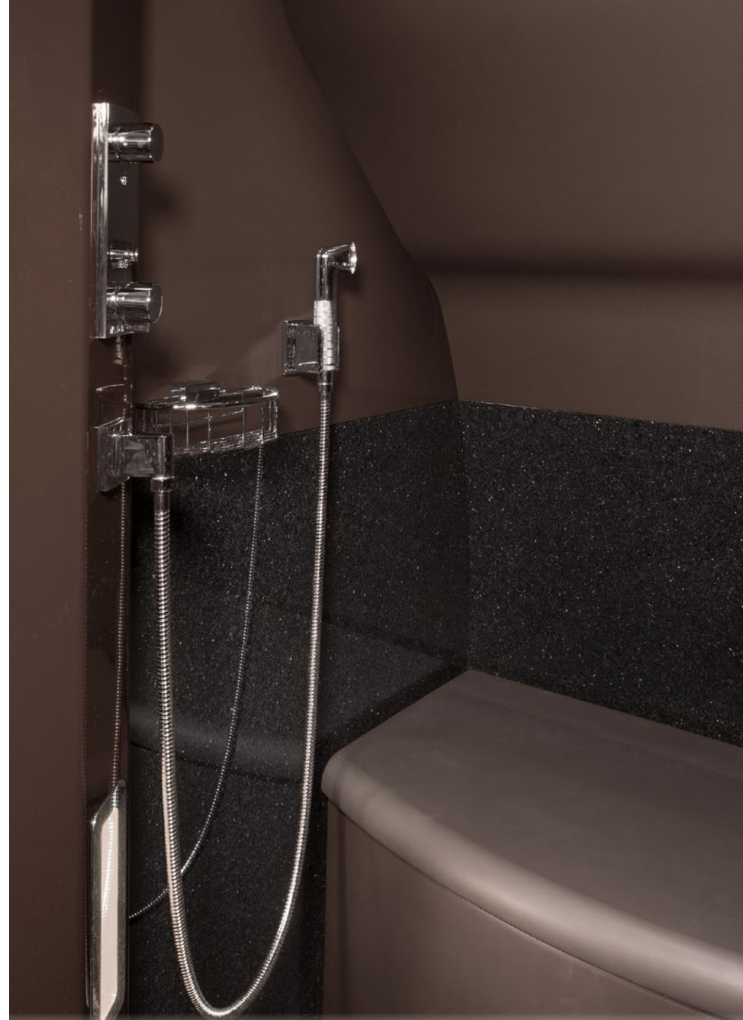
WWW.OGARAJETS.COM +1 770 955 3554 | inquiry@ogarajets.com