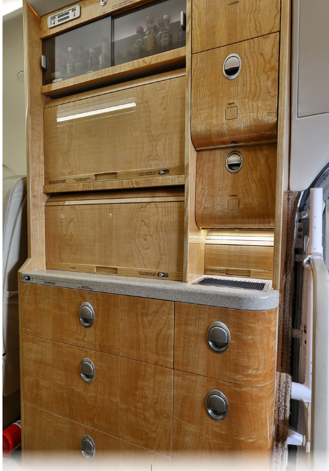
WWW.OGARAJETS.COM +1 770 955 3554 | inquiry@ogarajets.com