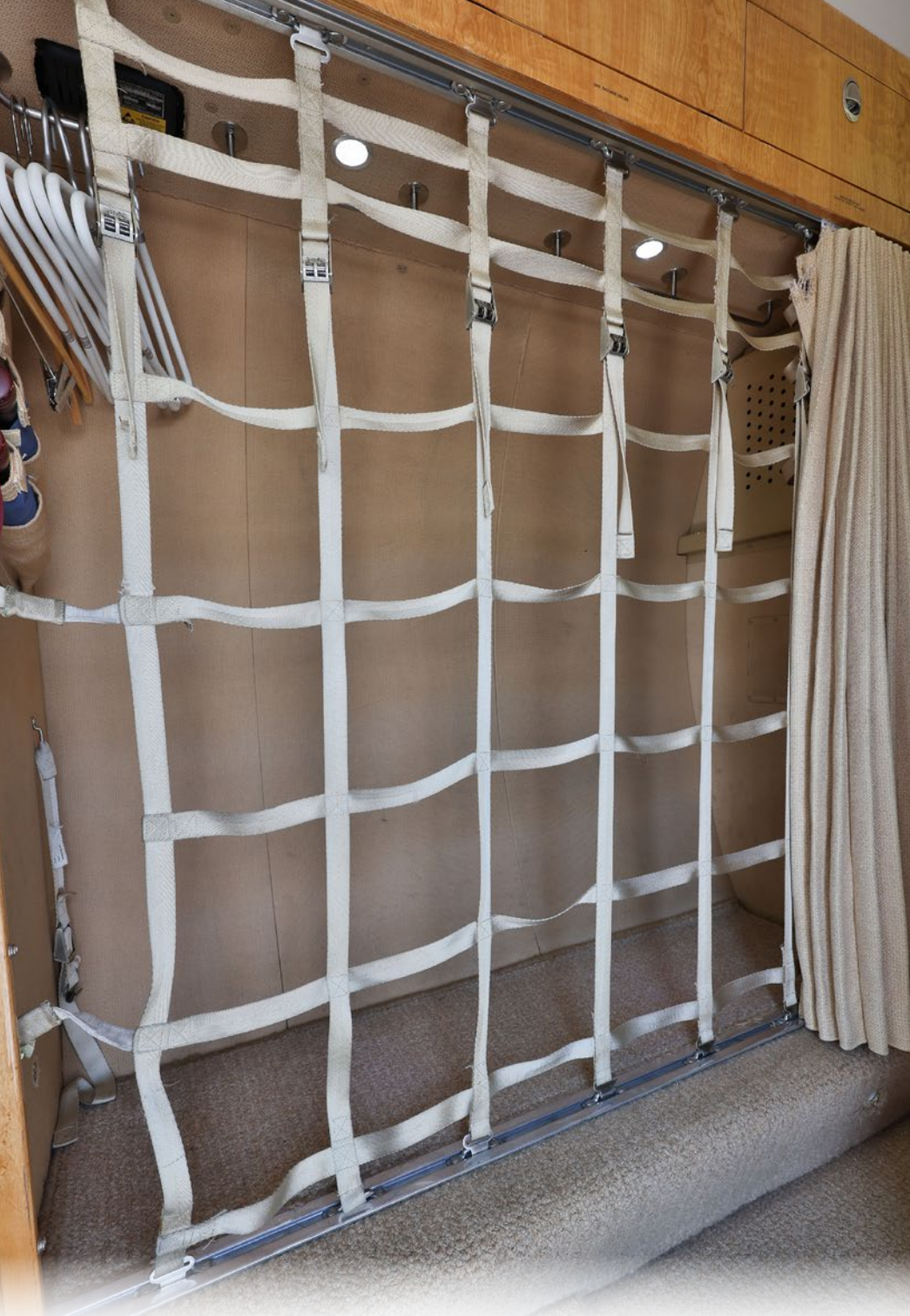
2009 HAWKER 900XP SERIAL NUMBER HA-0108