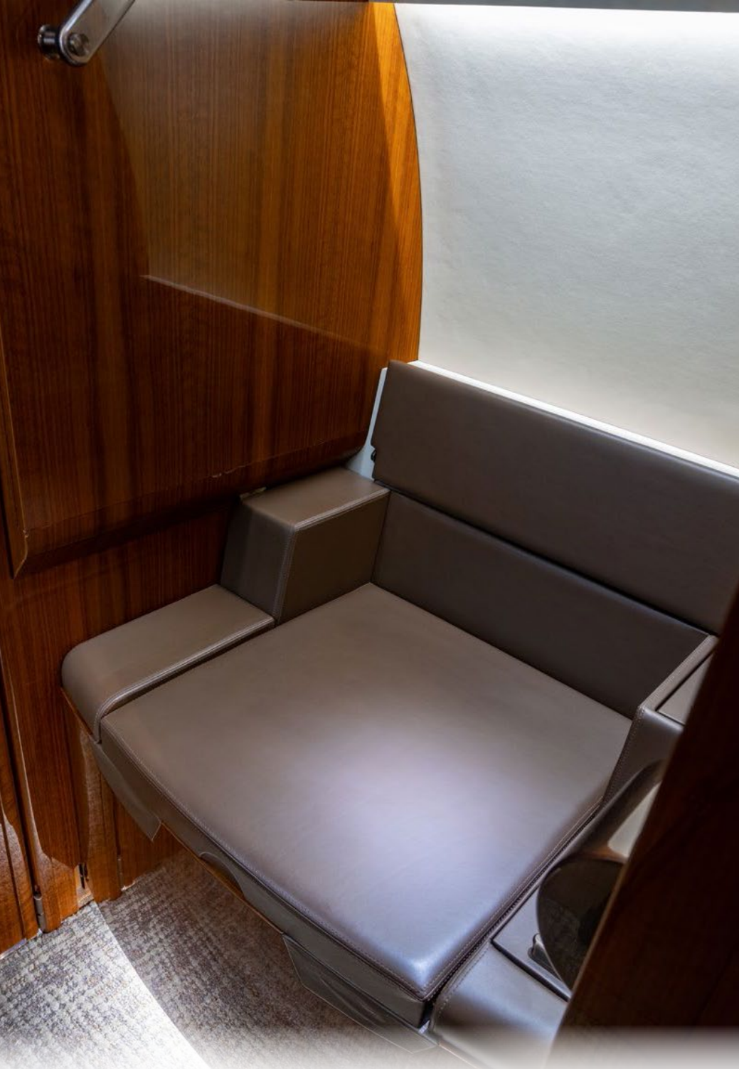
2010 FALCON 2000LX SERIAL NUMBER 206