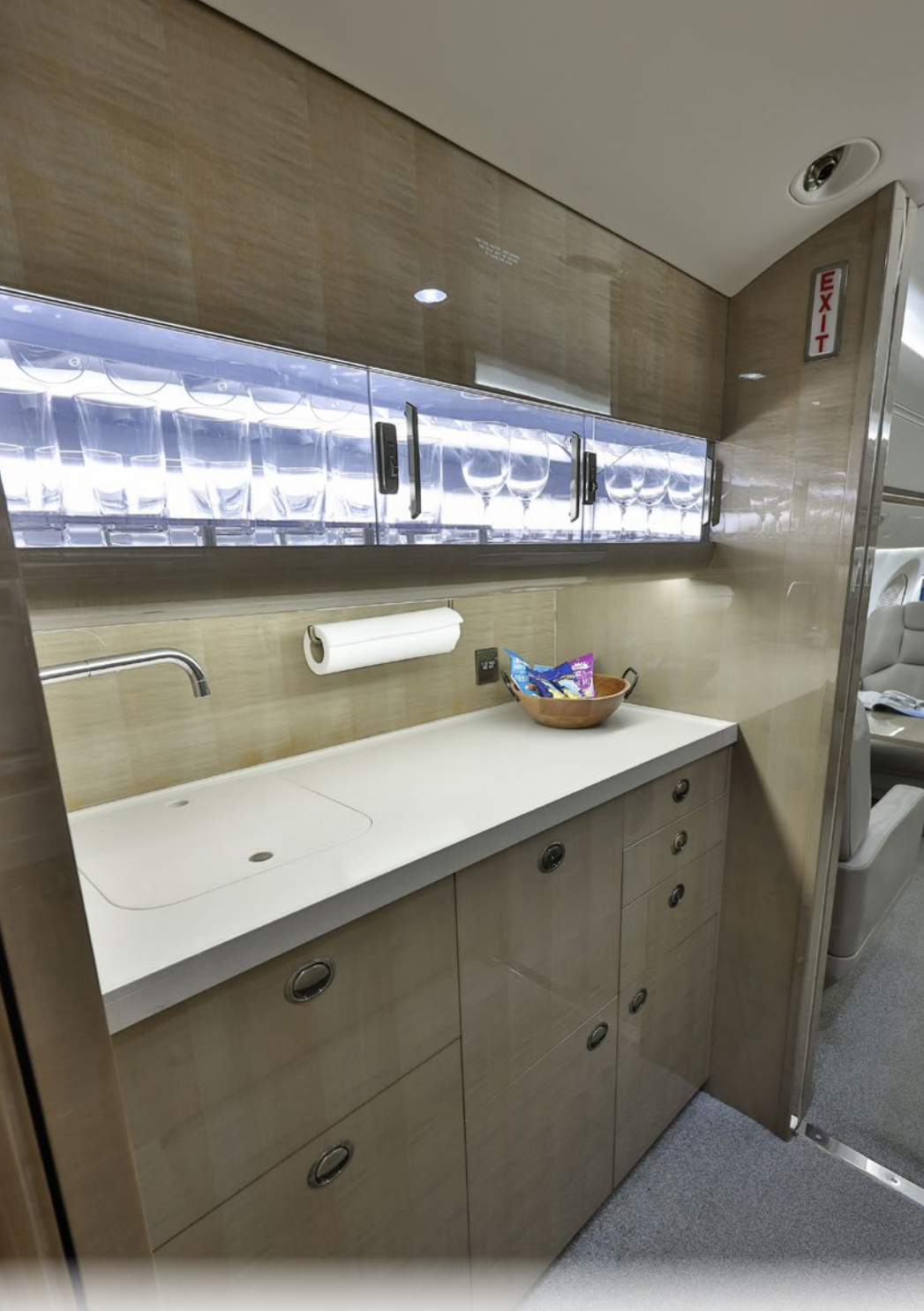
2011 GULFSTREAM G450 SERIAL NUMBER 4217