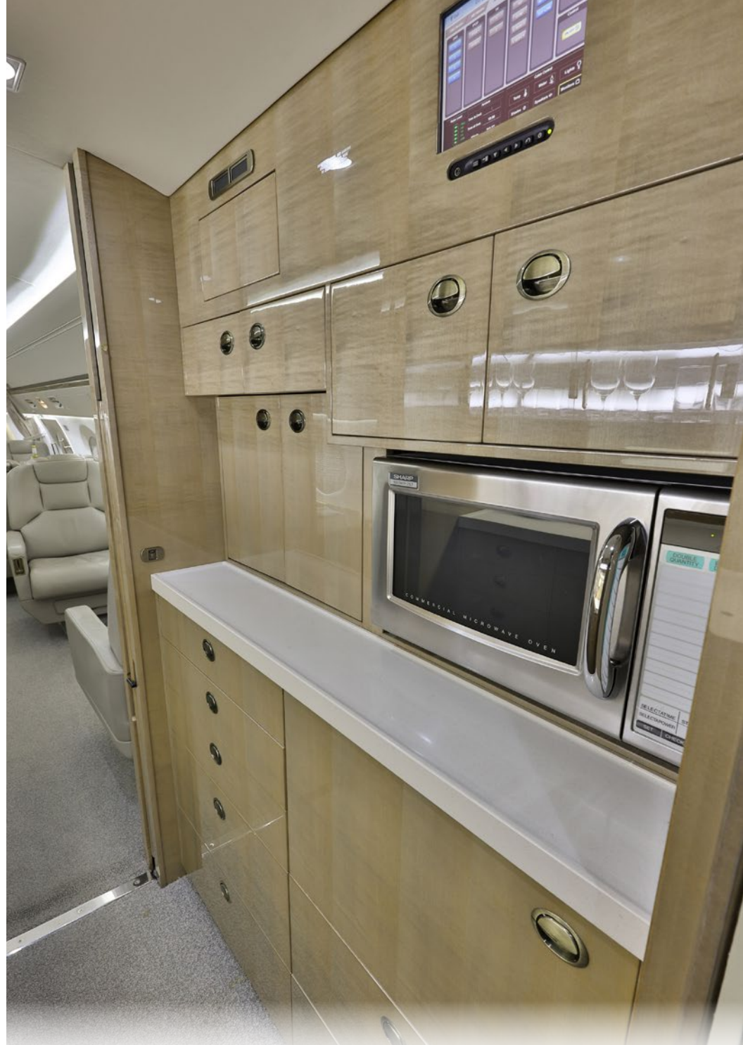
WWW.OGARAJETS.COM +1 770 955 3554 | inquiry@ogarajets.com