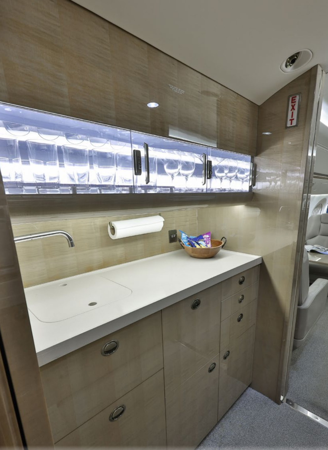
2011 GULFSTREAM G450 SERIAL NUMBER 4217