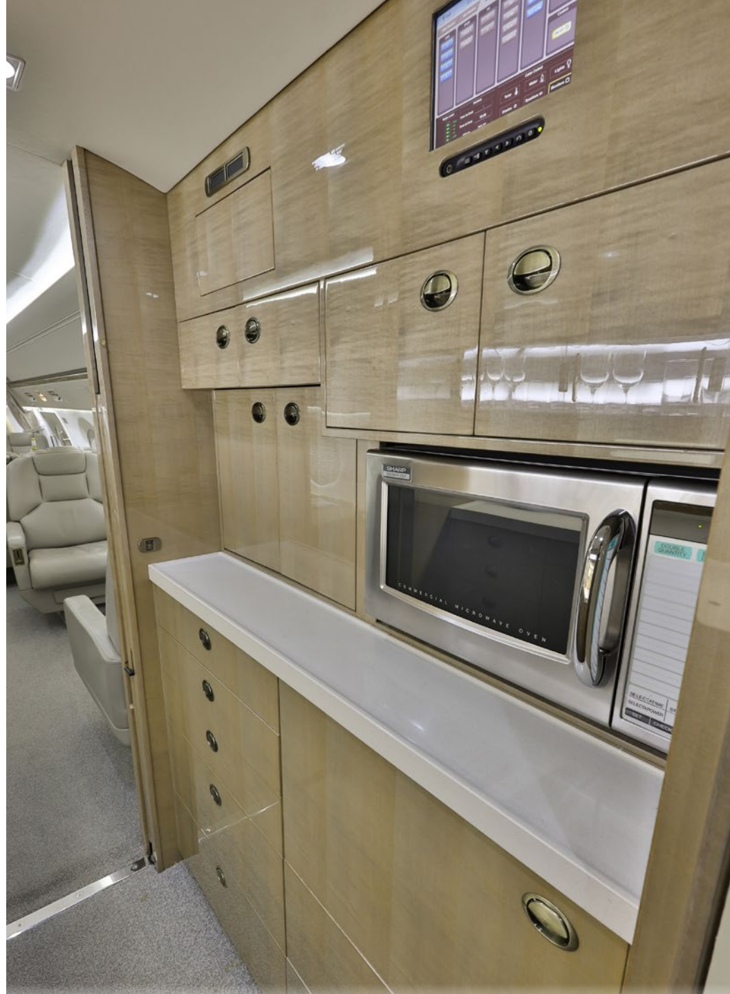
WWW.OGARAJETS.COM +1 770 955 3554 | inquiry@ogarajets.com