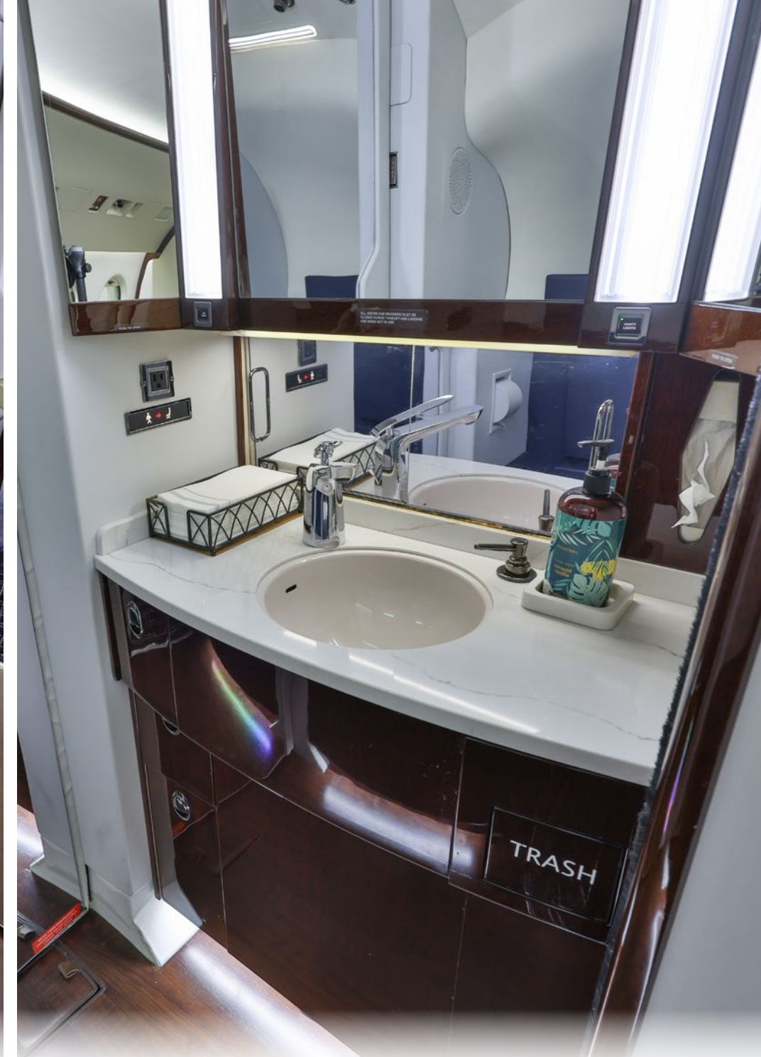
WWW.OGARAJETS.COM +1 770 955 3554 | inquiry@ogarajets.com