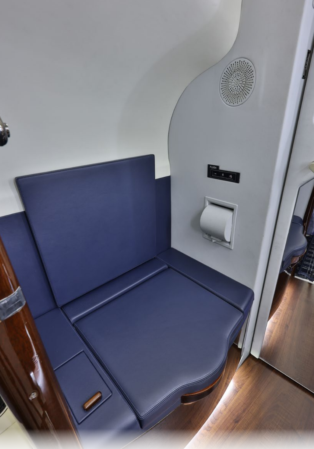
1998 FALCON 900EX SERIAL NUMBER 32