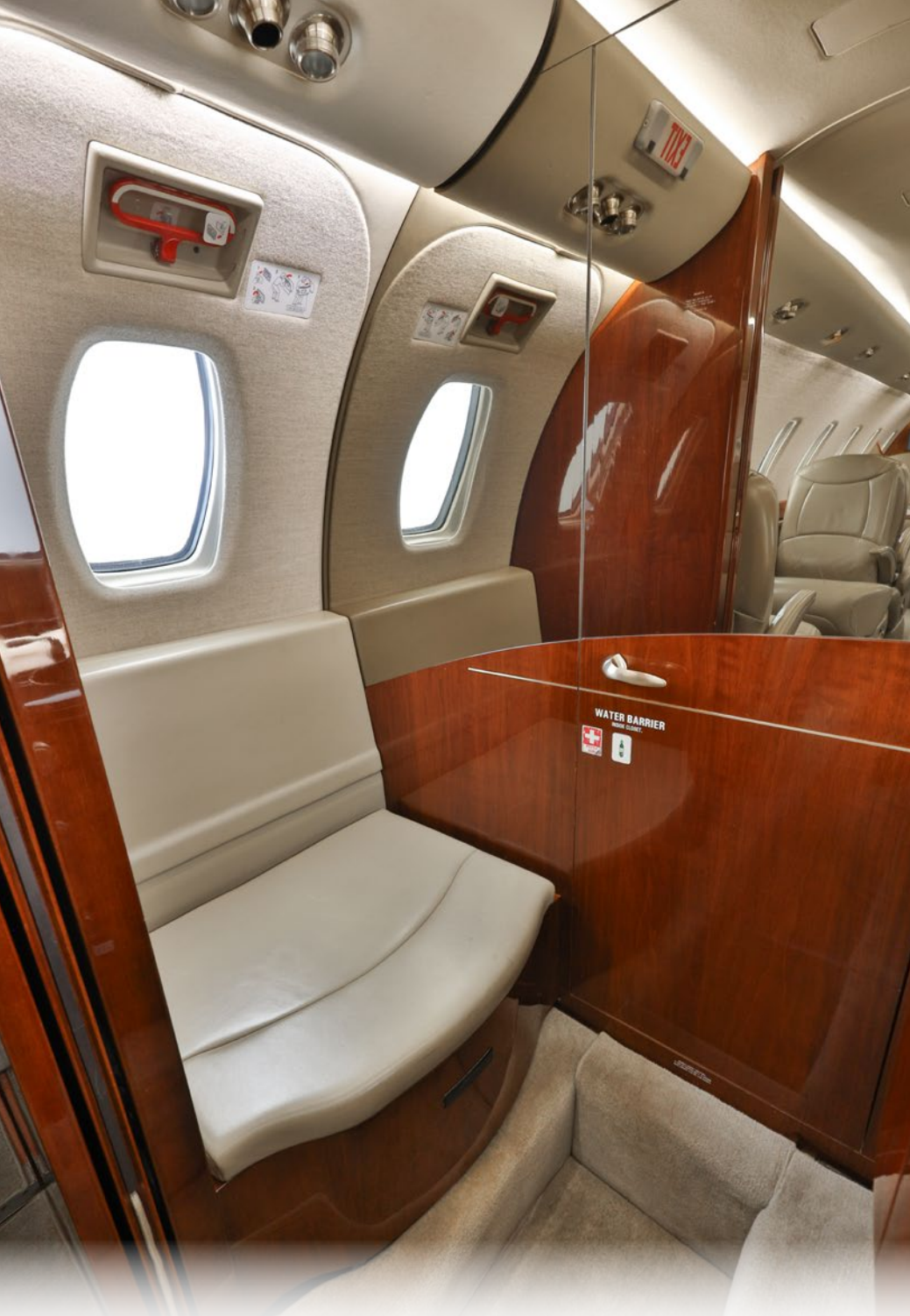
2012 CESSNA CITATION SOVEREIGN SERIAL NUMBER 680-0325