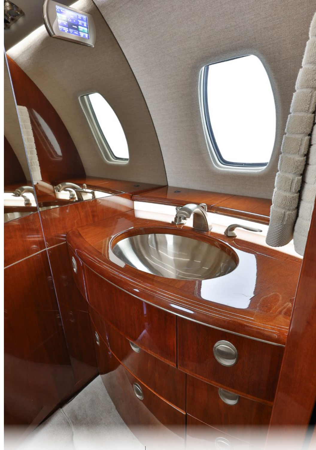
WWW.OGARAJETS.COM +1 770 955 3554 | inquiry@ogarajets.com