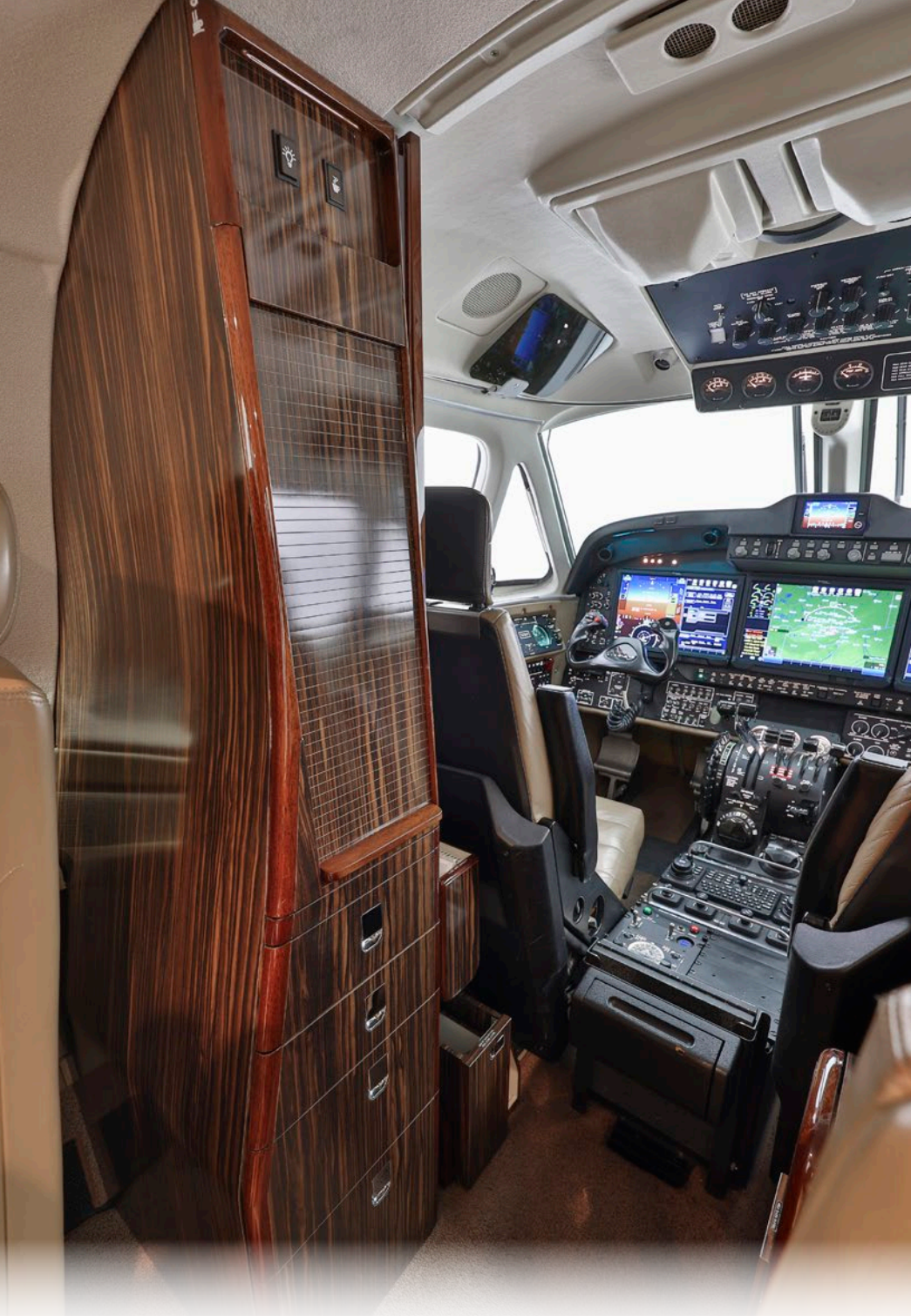
2017 BEECHCRAFT KING AIR 250 SERIAL NUMBER BY-284