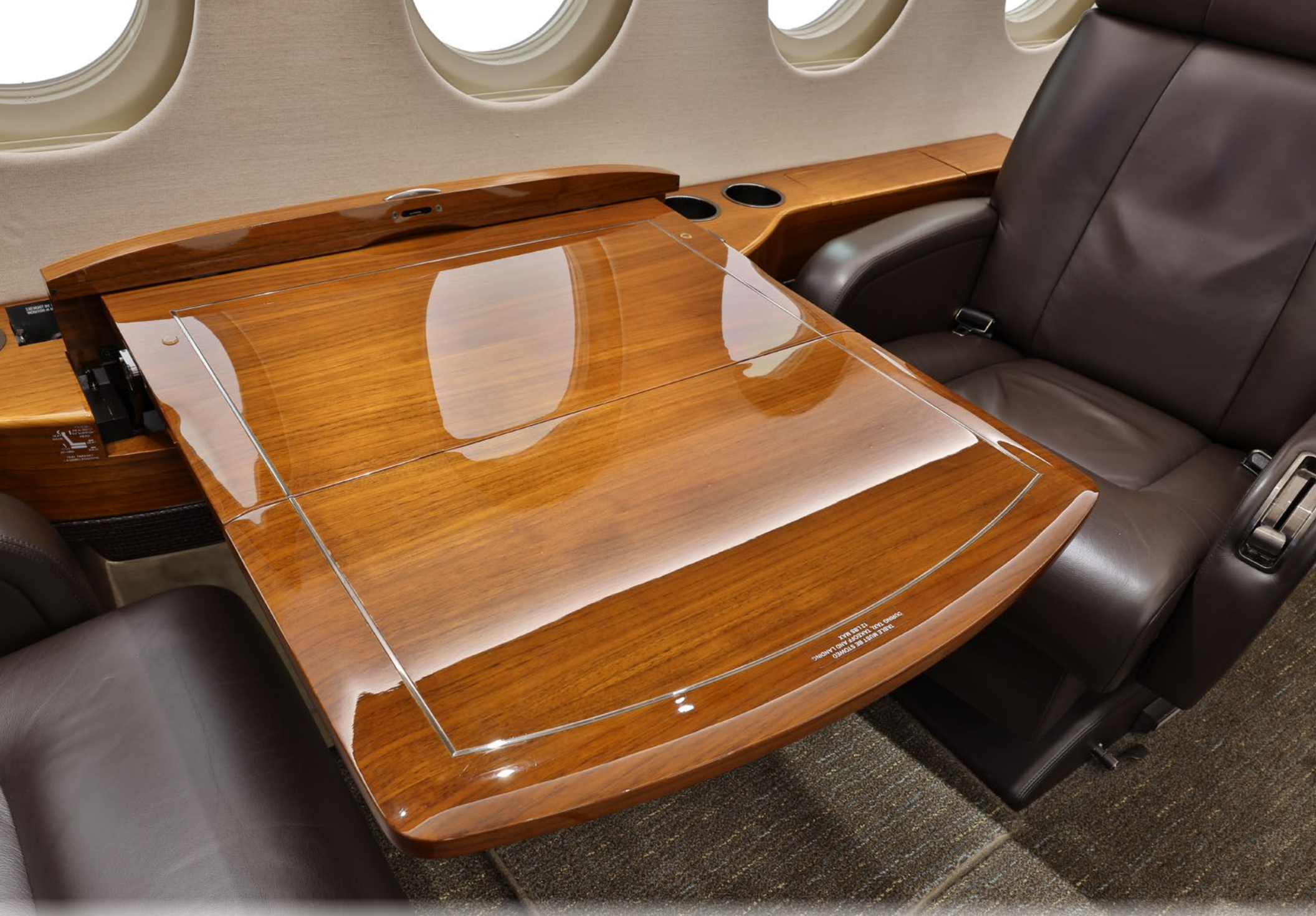
TABLE MUST BE STOWED DURING TAKE OFF, LANDING AND CRUISE

2009 FALCON 900EX EASY SERIAL NUMBER 215