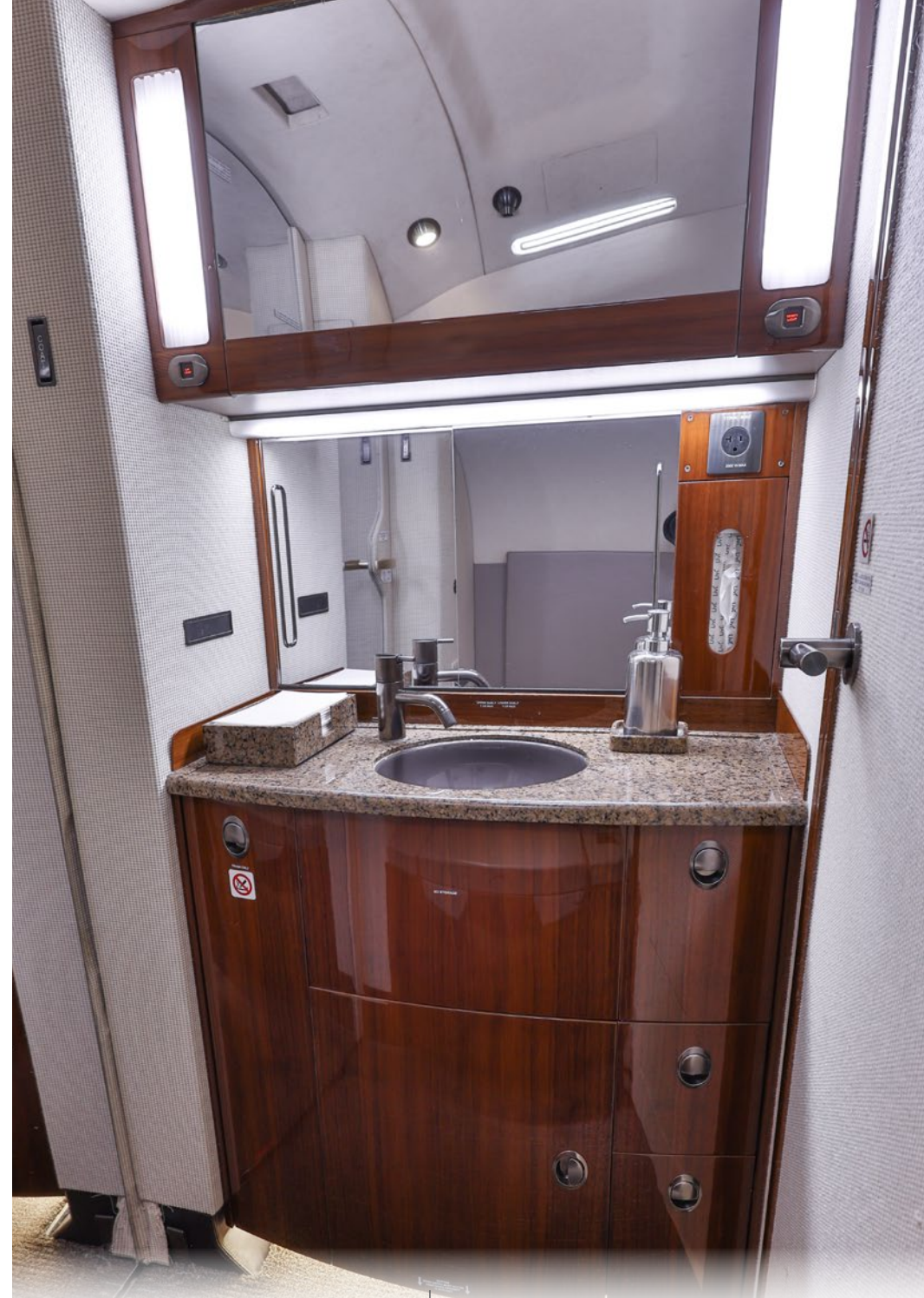
WWW.OGARAJETS.COM +1 770 955 3554 | inquiry@ogarajets.com