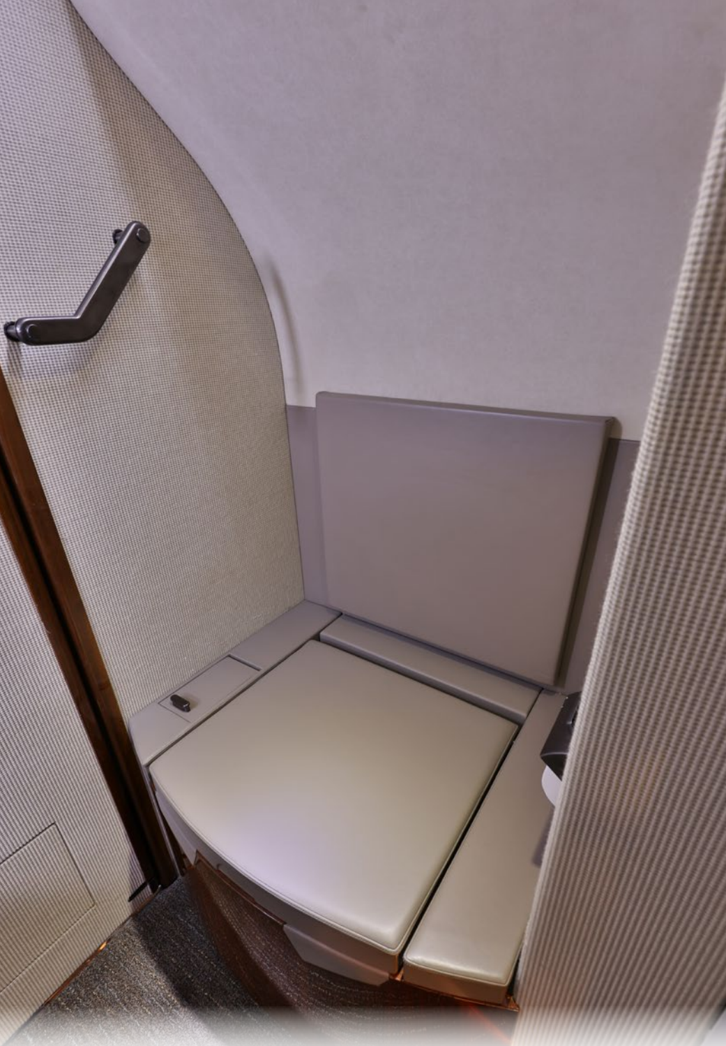
2009 FALCON 900EX EASY SERIAL NUMBER 215