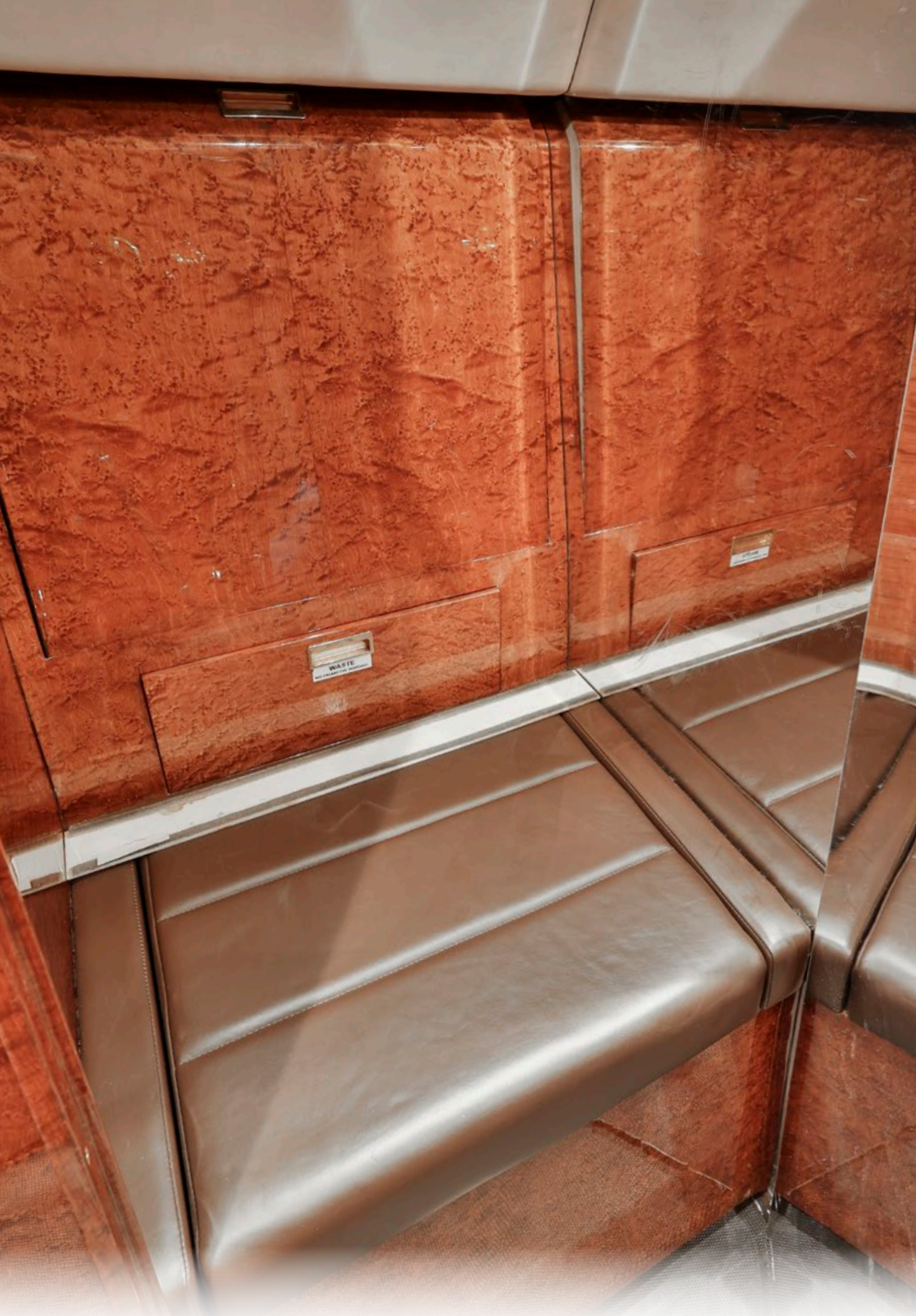
1997 GULFSTREAM GIVSP SERIAL NUMBER 1308