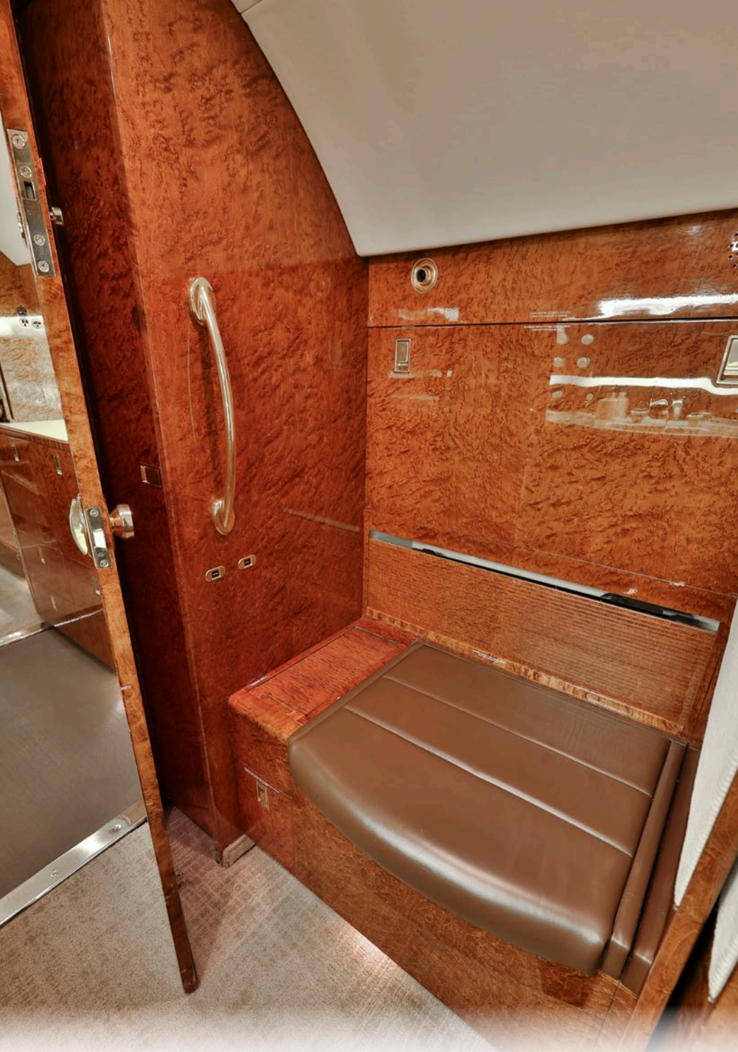
1997 GULFSTREAM GIVSP SERIAL NUMBER 1308