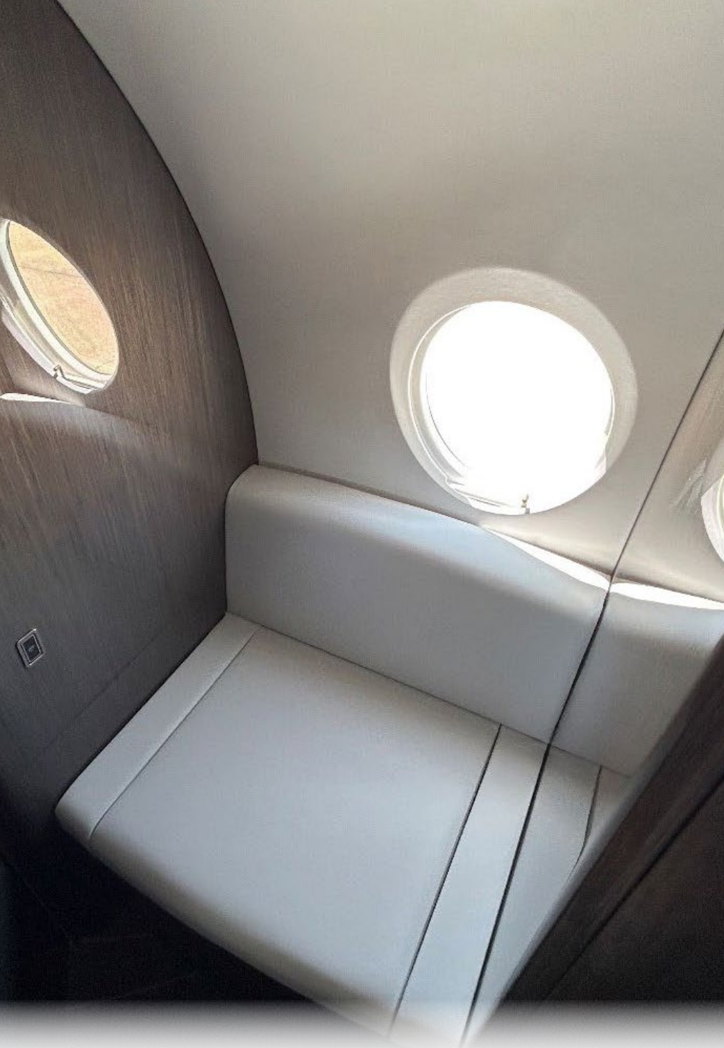
2025 GULFSTREAM G280 SERIAL NUMBER 2296