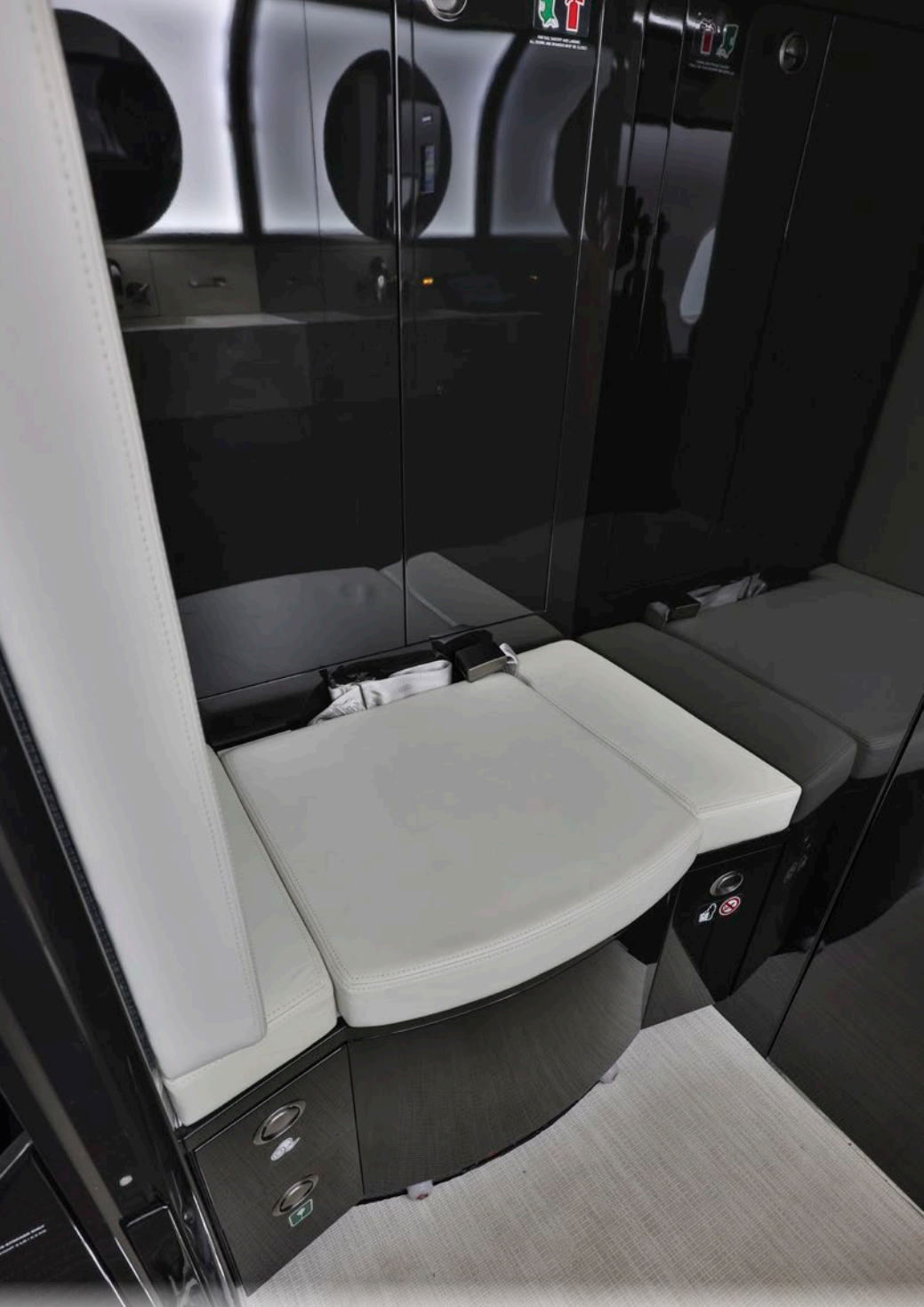
2010 CHALLENGER 300 SERIAL NUMBER 20297