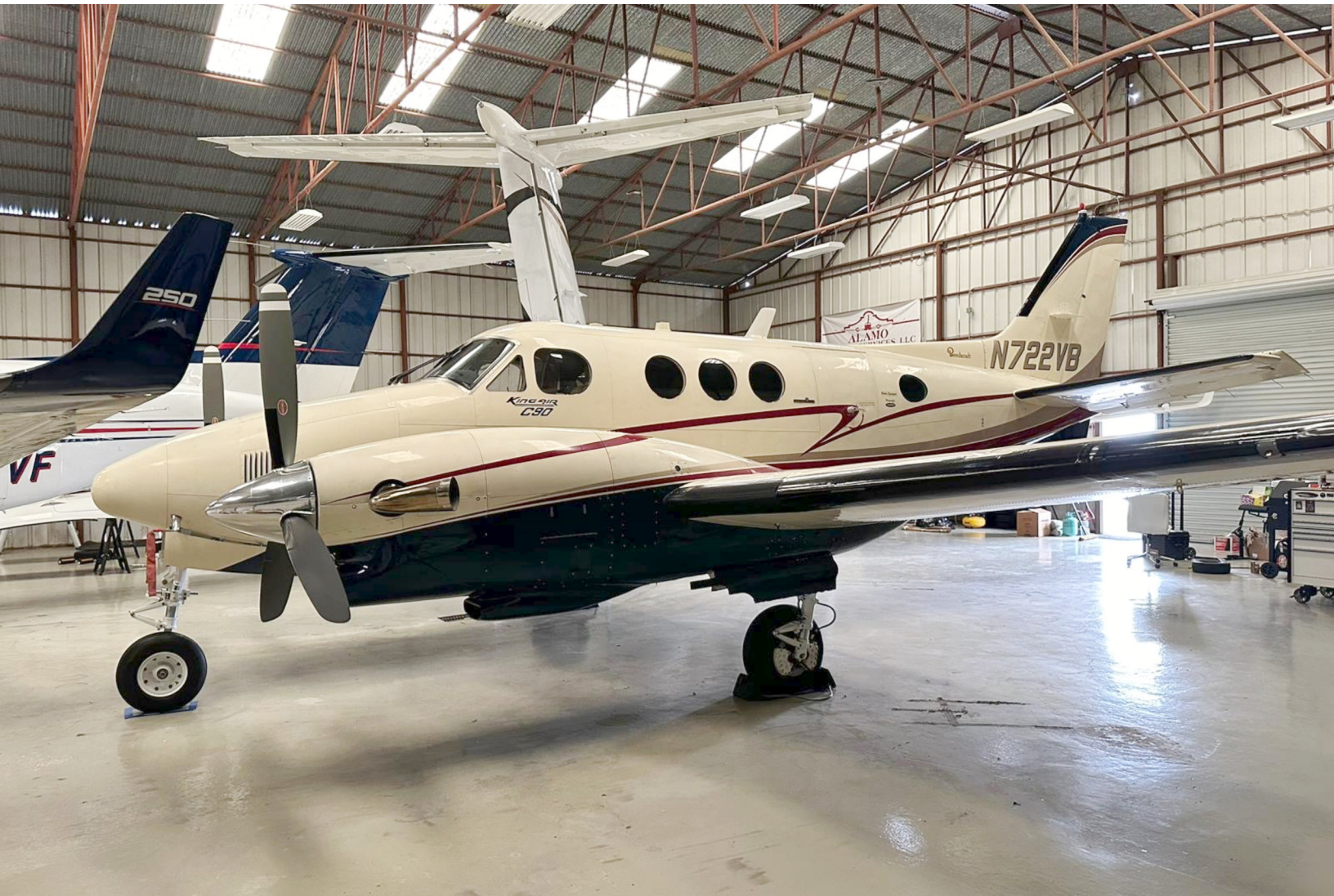
1981 KING AIR C90