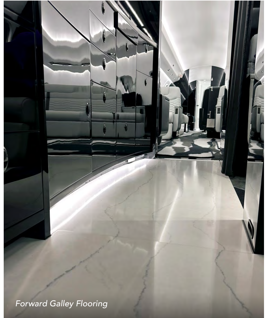
Forward Galley Flooring

Specifications and/or descriptions are provided as introductory information only and do not constitute representations or warranties. Verification of specifications remain the sole responsibility of purchaser. Aircraft is subject to prior sale, lease, and/or removal from the market without prior notice. SPECIFICATIONS AS OF APRIL 24, 2023.