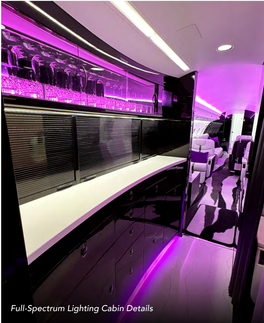
Full-Spectrum Lighting Cabin Details