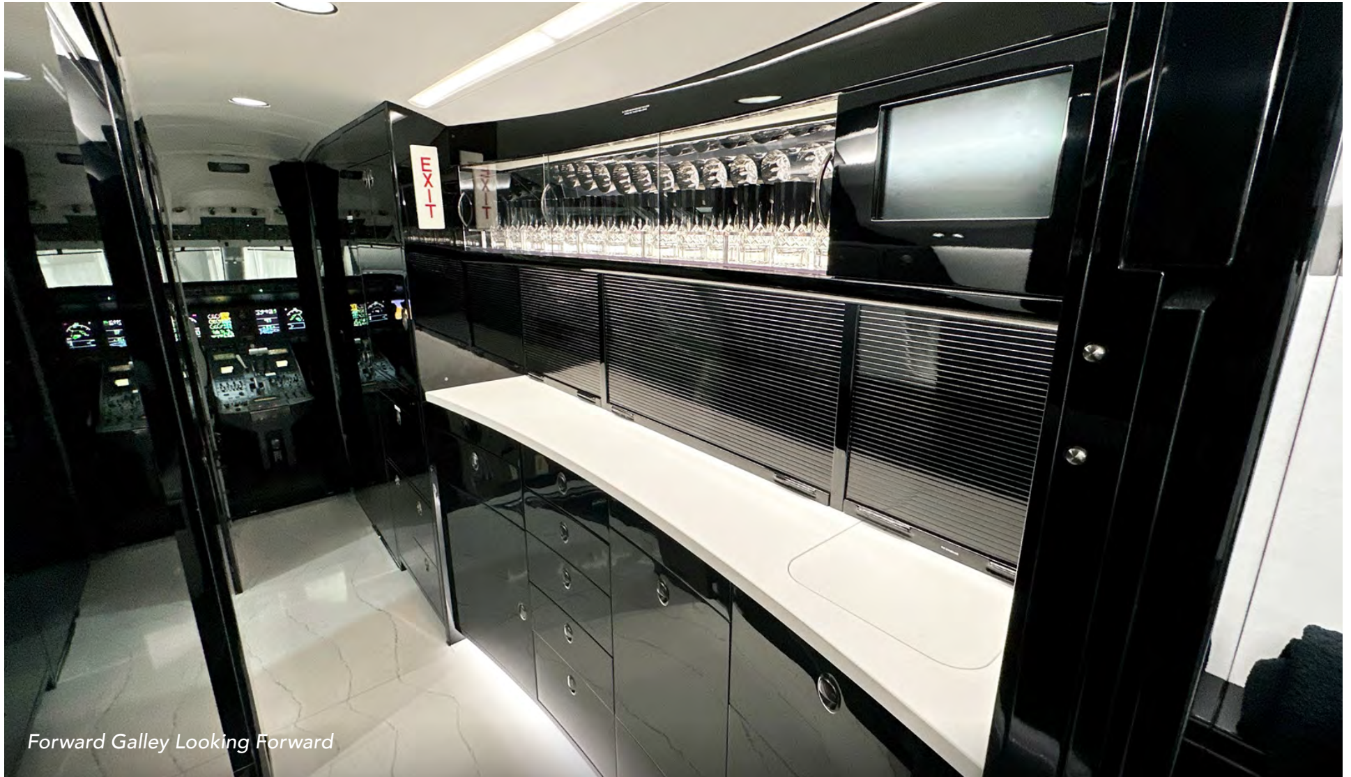
Forward Galley Looking Forward

Specifications and/or descriptions are provided as introductory information only and do not constitute representations or warranties. Verification of specifications remain the sole responsibility of purchaser. Aircraft is subject to prior sale, lease, and/or removal from the market without prior notice. SPECIFICATIONS AS OF APRIL 24, 2023.