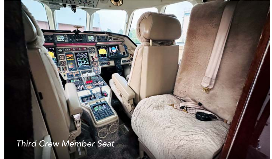
Third Crew Member Seat