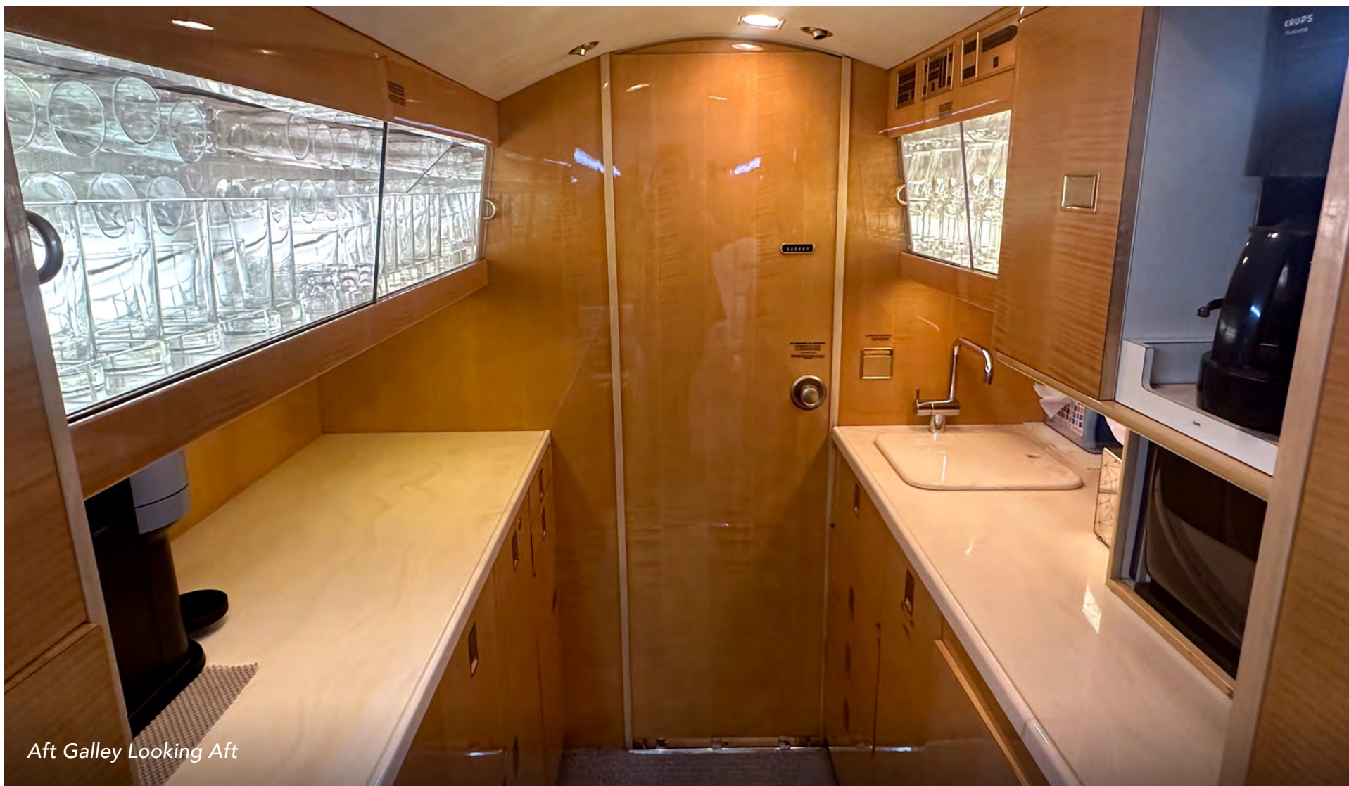
Aft Galley Looking Aft

Specifications and/or descriptions are provided as introductory information only and do not constitute representations or warranties. Verification of specifications remain the sole responsibility of purchaser. Photographs and images may have been modified to remove logos, registration marks, or other identifying information to protect the privacy of the Aircraft's current owner. Aircraft is subject to prior sale, lease, and/or removal from the market without prior notice. SPECIFICATIONS AS OF MARCH 18, 2024.