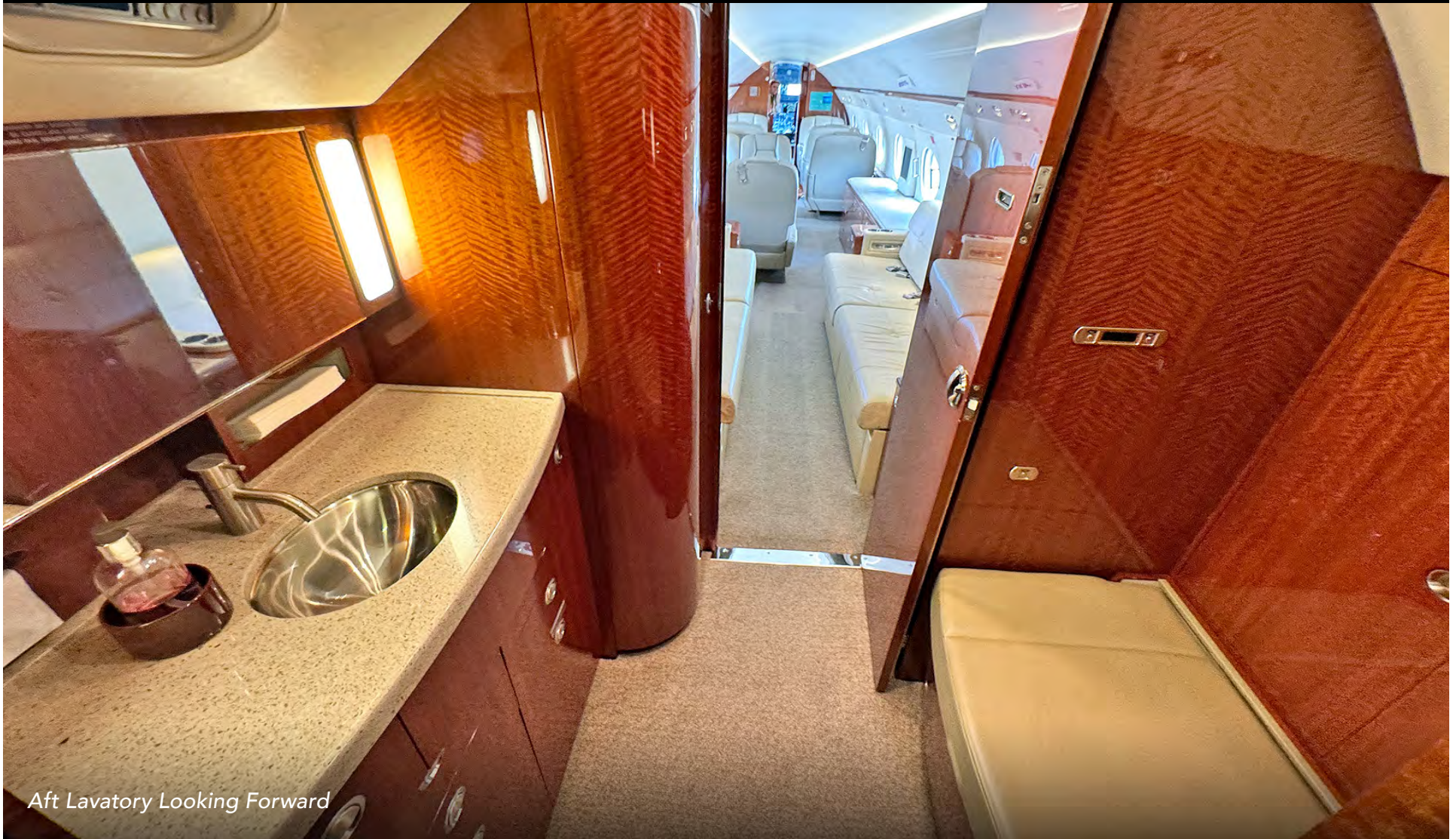
Aft Lavatory Looking Forward

NOW AVAILABLE FOR SALE OR LEASE. LET'S TALK!