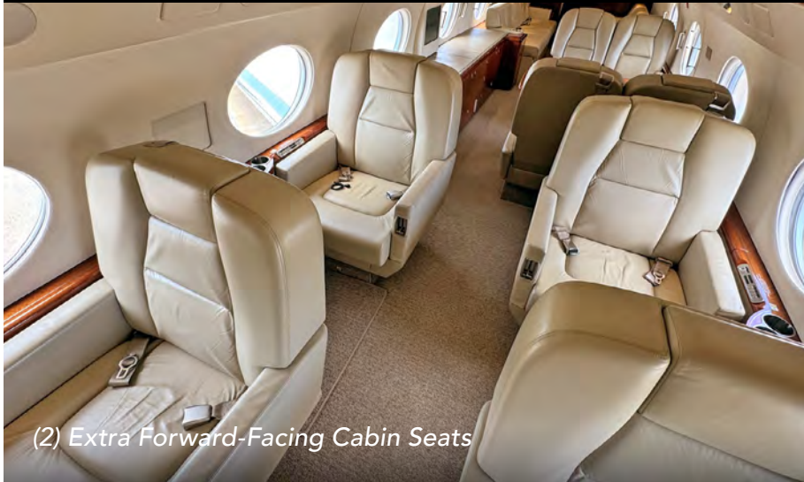
(2) Extra Forward-Facing Cabin Seats

NOW AVAILABLE FOR SALE OR LEASE. LET'S TALK!