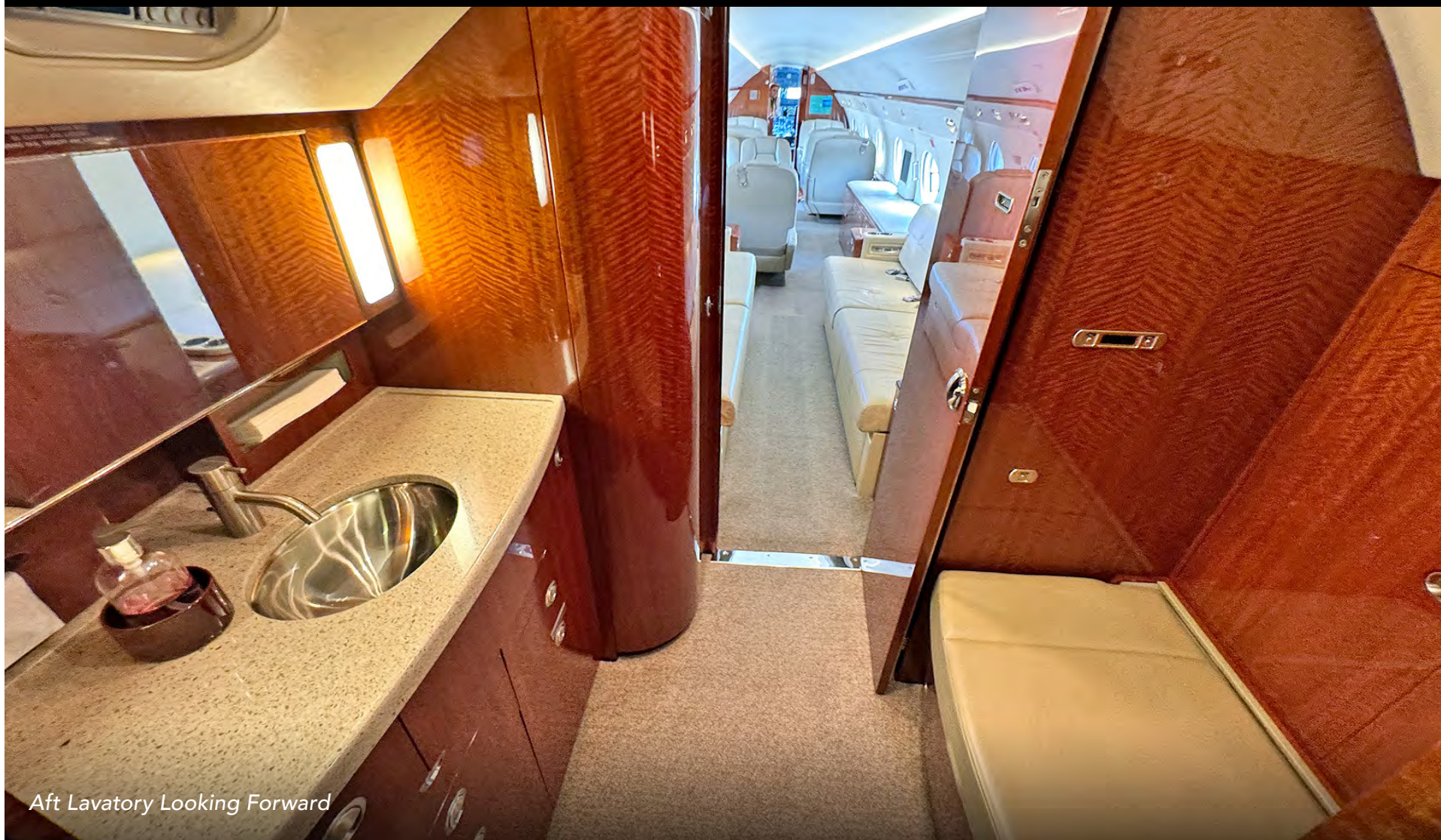
Aft Lavatory Looking Forward

READY FOR IMMEDIATE SALE OR LEASE. PRIVATE SHOWINGS AVAILABLE AT KCPS.