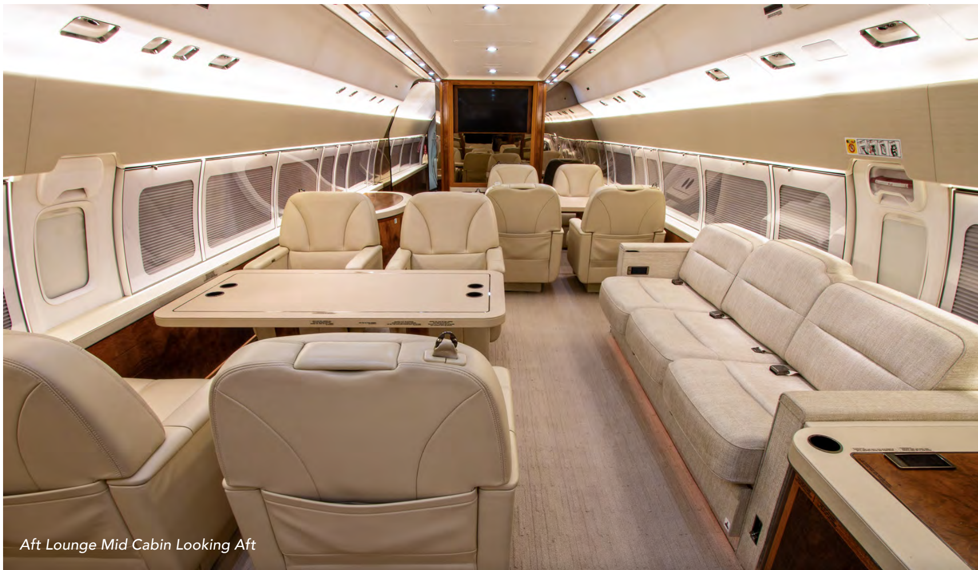
Aft Lounge Mid Cabin Looking Aft

Specifications and/or descriptions are provided as introductory information only and do not constitute representations or warranties. Verification of specifications remain the sole responsibility of purchaser. Photographs and images may have been modified to remove logos, registration marks, or other identifying information to protect the privacy of the Aircraft's current owner. Aircraft is subject to prior sale, lease, and/or removal from the market without prior notice. SPECIFICATIONS AS OF JUNE 26, 2025.