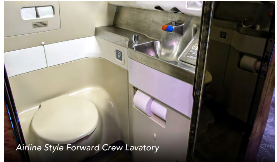
Airline Style Forward Crew Lavatory