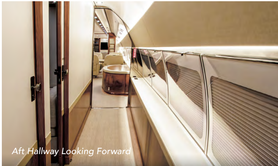
Aft Hallway Looking Forward