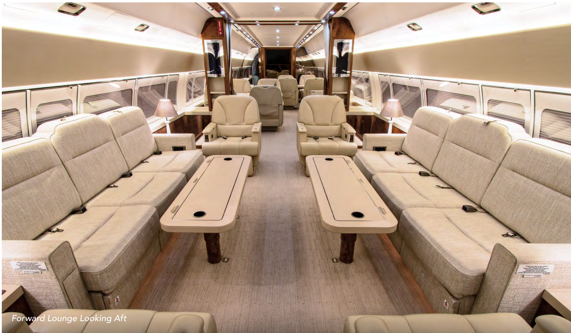
Forward Lounge Looking Aft

Specifications and/or descriptions are provided as introductory information only and do not constitute representations or warranties. Verification of specifications remain the sole responsibility of purchaser. Photographs and images may have been modified to remove logos, registration marks, or other identifying information to protect the privacy of the Aircraft's current owner. Aircraft is subject to prior sale, lease, and/or removal from the market without prior notice. SPECIFICATIONS AS OF JUNE 26, 2025.