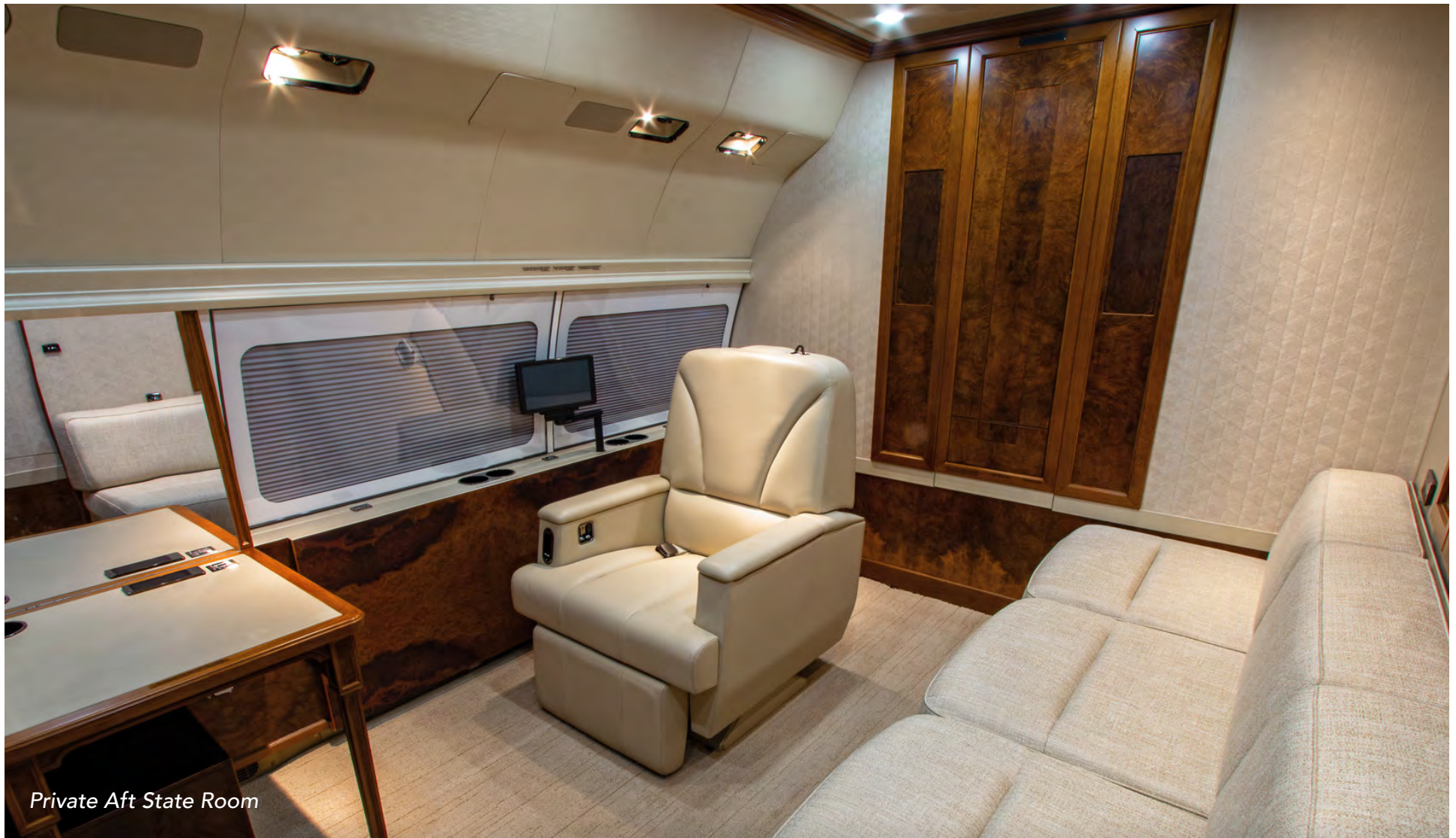
Private Aft State Room

Specifications and/or descriptions are provided as introductory information only and do not constitute representations or warranties. Verification of specifications remain the sole responsibility of purchaser. Photographs and images may have been modified to remove logos, registration marks, or other identifying information to protect the privacy of the Aircraft's current owner. Aircraft is subject to prior sale, lease, and/or removal from the market without prior notice. SPECIFICATIONS AS OF JUNE 26, 2025.