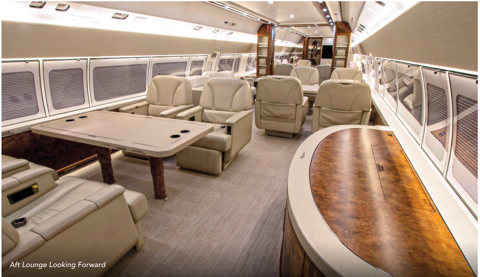
Aft Lounge Looking Forward

Specifications and/or descriptions are provided as introductory information only and do not constitute representations or warranties. Verification of specifications remain the sole responsibility of purchaser. Photographs and images may have been modified to remove logos, registration marks, or other identifying information to protect the privacy of the Aircraft's current owner. Aircraft is subject to prior sale, lease, and/or removal from the market without prior notice. SPECIFICATIONS AS OF JUNE 26, 2025.