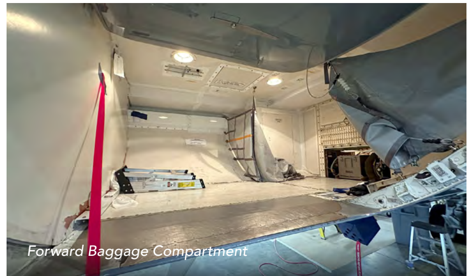
Forward Baggage Compartment

Specifications and/or descriptions are provided as introductory information only and do not constitute representations or warranties. Verification of specifications remain the sole responsibility of purchaser. Photographs and images may have been modified to remove logos, registration marks, or other identifying information to protect the privacy of the Aircraft's current owner. Aircraft is subject to prior sale, lease, and/or removal from the market without prior notice. SPECIFICATIONS AS OF JUNE 26, 2025.