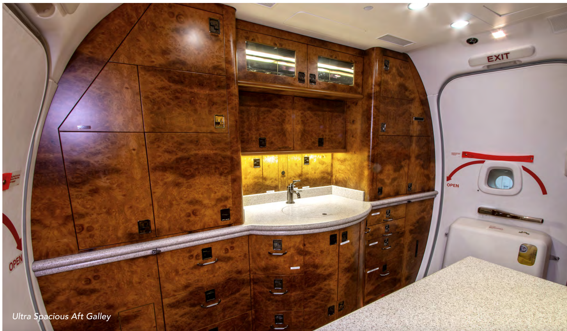
Ultra Spacious Aft Galley

Specifications and/or descriptions are provided as introductory information only and do not constitute representations or warranties. Verification of specifications remain the sole responsibility of purchaser. Photographs and images may have been modified to remove logos, registration marks, or other identifying information to protect the privacy of the Aircraft's current owner. Aircraft is subject to prior sale, lease, and/or removal from the market without prior notice. SPECIFICATIONS AS OF JUNE 26, 2025.