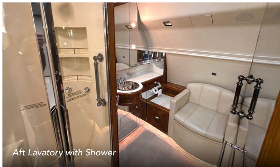
Aft Lavatory with Shower