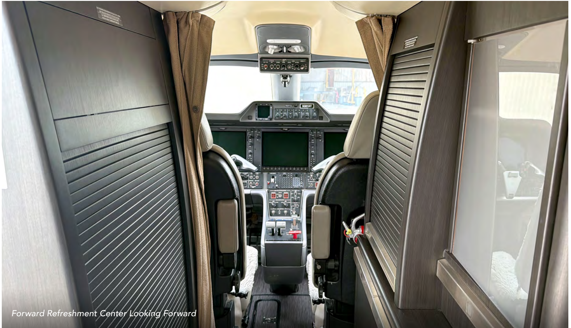
Forward Refreshment Center Looking Forward

Specifications and/or descriptions are provided as introductory information only and do not constitute representations or warranties. Verification of specifications remain the sole responsibility of purchaser. Photographs and images may have been modified to remove logos, registration marks, or other identifying information to protect the privacy of the Aircraft's current owner. Aircraft is subject to prior sale, lease, and/or removal from the market without prior notice. SPECIFICATIONS AS OF MAY 7, 2026.