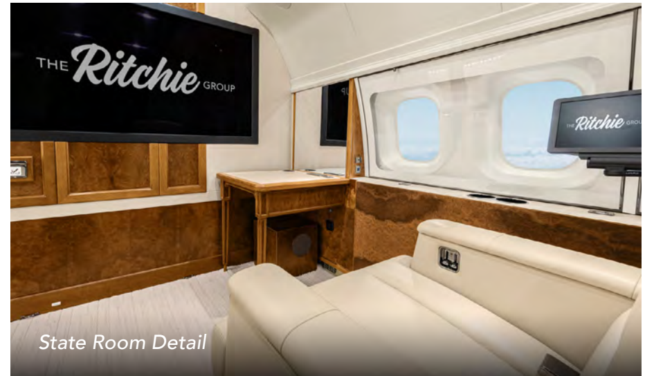
State Room Detail