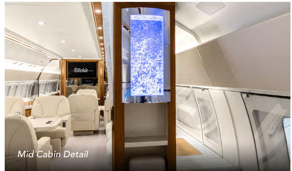
Mid Cabin Detail

Specifications and/or descriptions are provided as introductory information only and do not constitute representations or warranties. Verification of specifications remain the sole responsibility of purchaser. Photographs and images may have been modified to remove logos, registration marks, or other identifying information to protect the privacy of the Aircraft's current owner. Aircraft is subject to prior sale, lease, and/or removal from the market without prior notice. SPECIFICATIONS AS OF MAY 19, 2026.