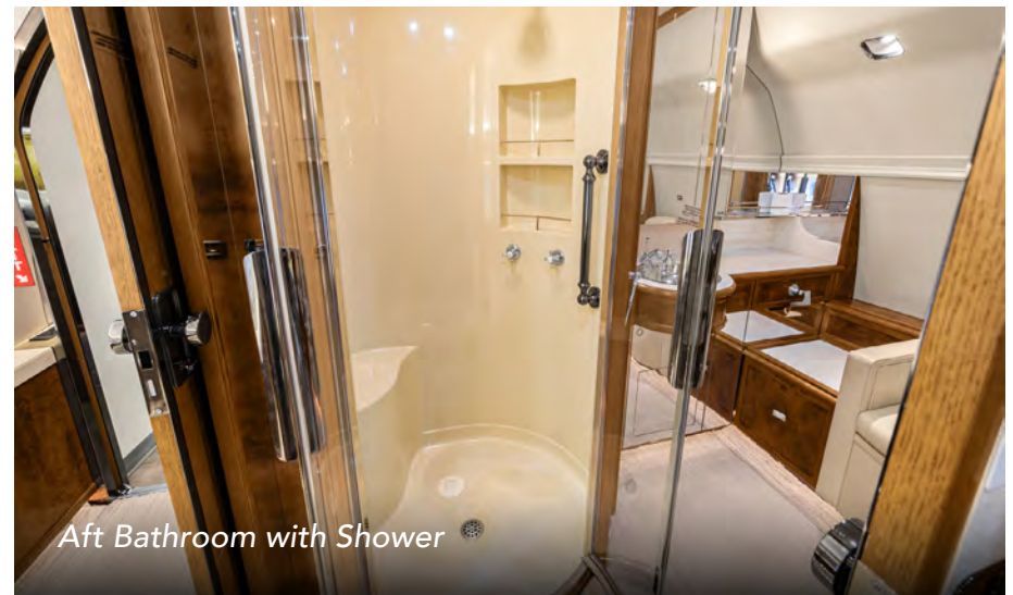
Aft Bathroom with Shower

Specifications and/or descriptions are provided as introductory information only and do not constitute representations or warranties. Verification of specifications remain the sole responsibility of purchaser. Photographs and images may have been modified to remove logos, registration marks, or other identifying information to protect the privacy of the Aircraft's current owner. Aircraft is subject to prior sale, lease, and/or removal from the market without prior notice. SPECIFICATIONS AS OF MAY 19, 2026.