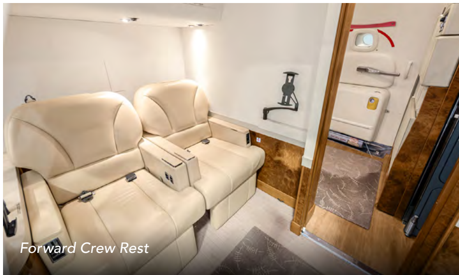
Forward Crew Rest