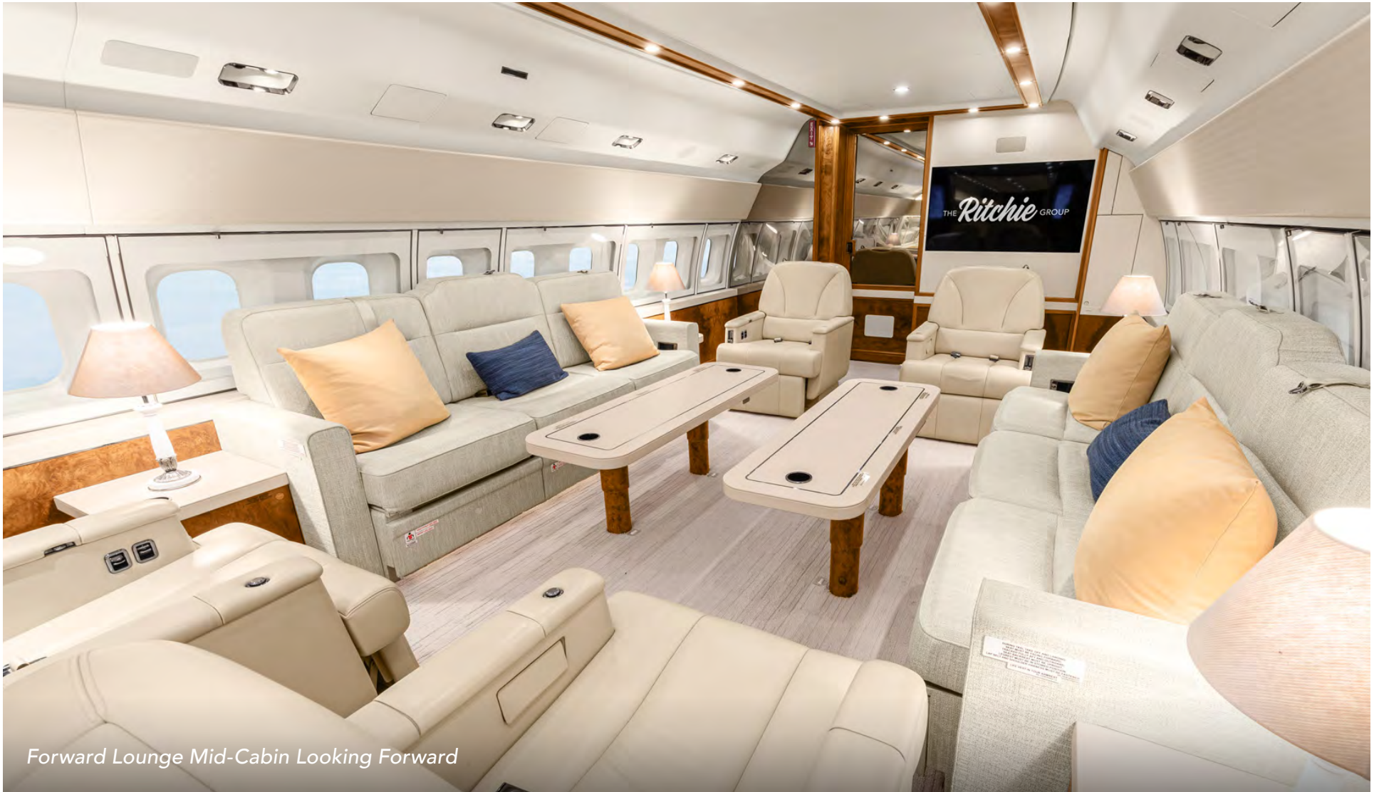
Forward Lounge Mid-Cabin Looking Forward

Specifications and/or descriptions are provided as introductory information only and do not constitute representations or warranties. Verification of specifications remain the sole responsibility of purchaser. Photographs and images may have been modified to remove logos, registration marks, or other identifying information to protect the privacy of the Aircraft's current owner. Aircraft is subject to prior sale, lease, and/or removal from the market without prior notice. SPECIFICATIONS AS OF MAY 19, 2026.