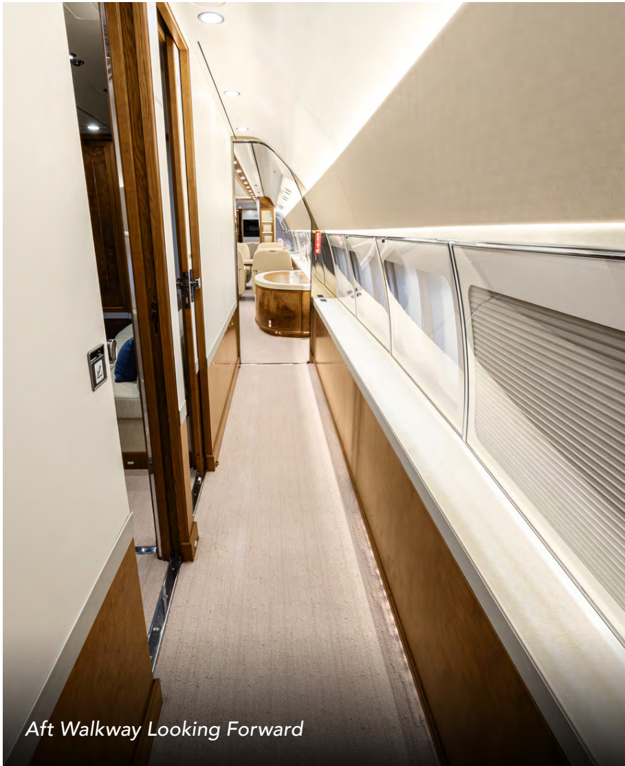
Aft Walkway Looking Forward