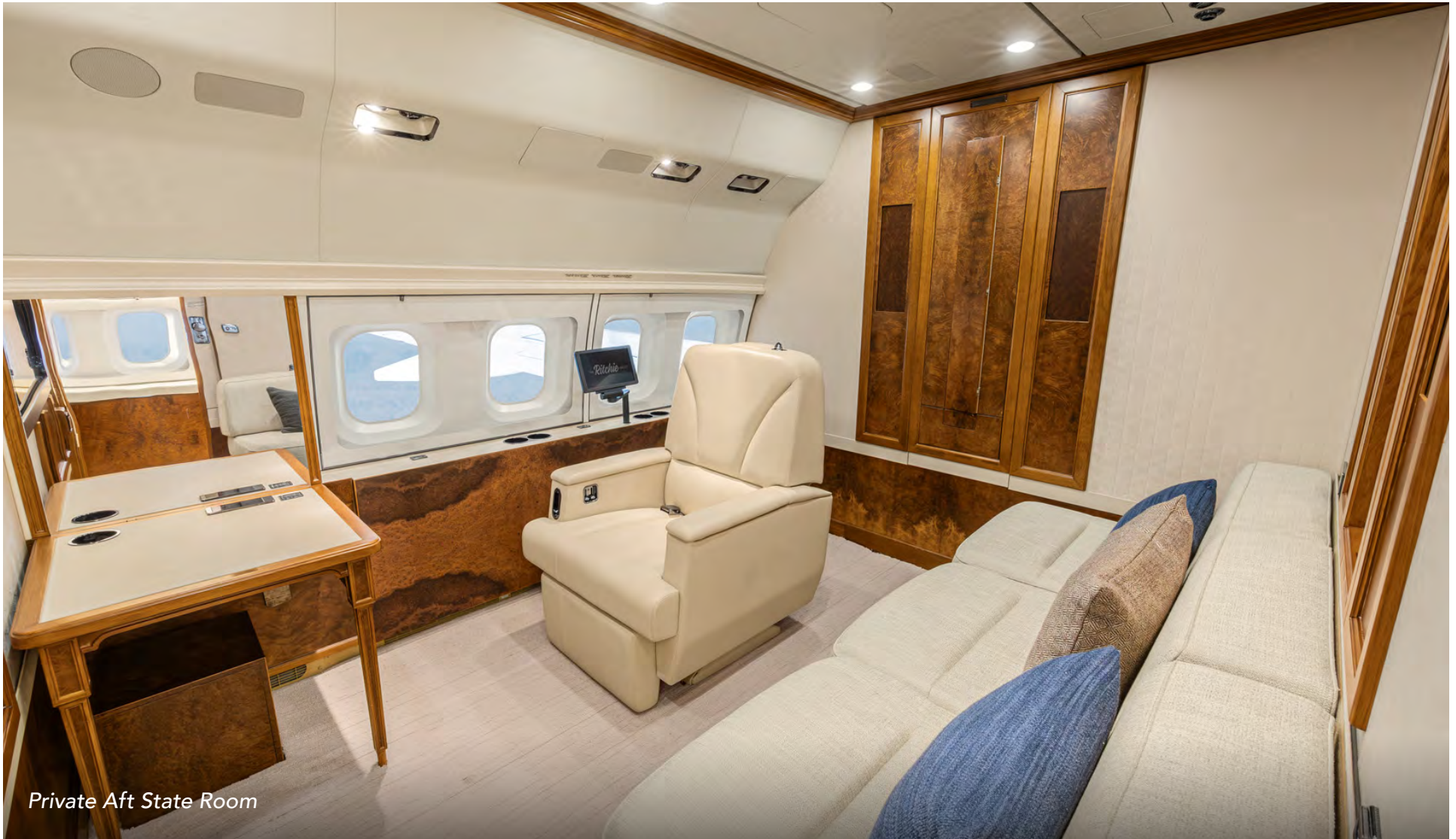
Private Aft State Room

Specifications and/or descriptions are provided as introductory information only and do not constitute representations or warranties. Verification of specifications remain the sole responsibility of purchaser. Photographs and images may have been modified to remove logos, registration marks, or other identifying information to protect the privacy of the Aircraft's current owner. Aircraft is subject to prior sale, lease, and/or removal from the market without prior notice. SPECIFICATIONS AS OF MAY 19, 2026.