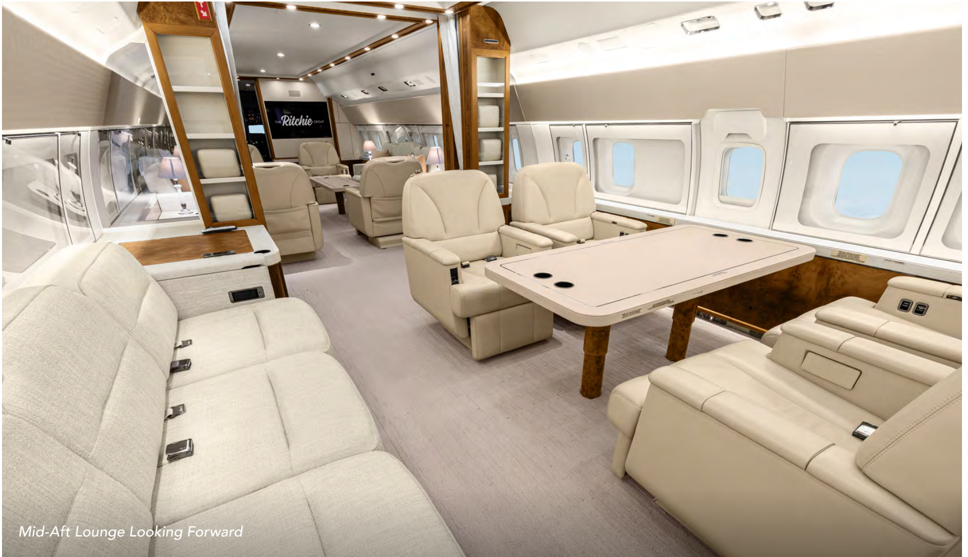
Mid-Aft Lounge Looking Forward

Specifications and/or descriptions are provided as introductory information only and do not constitute representations or warranties. Verification of specifications remain the sole responsibility of purchaser. Photographs and images may have been modified to remove logos, registration marks, or other identifying information to protect the privacy of the Aircraft's current owner. Aircraft is subject to prior sale, lease, and/or removal from the market without prior notice. SPECIFICATIONS AS OF MAY 19, 2026.