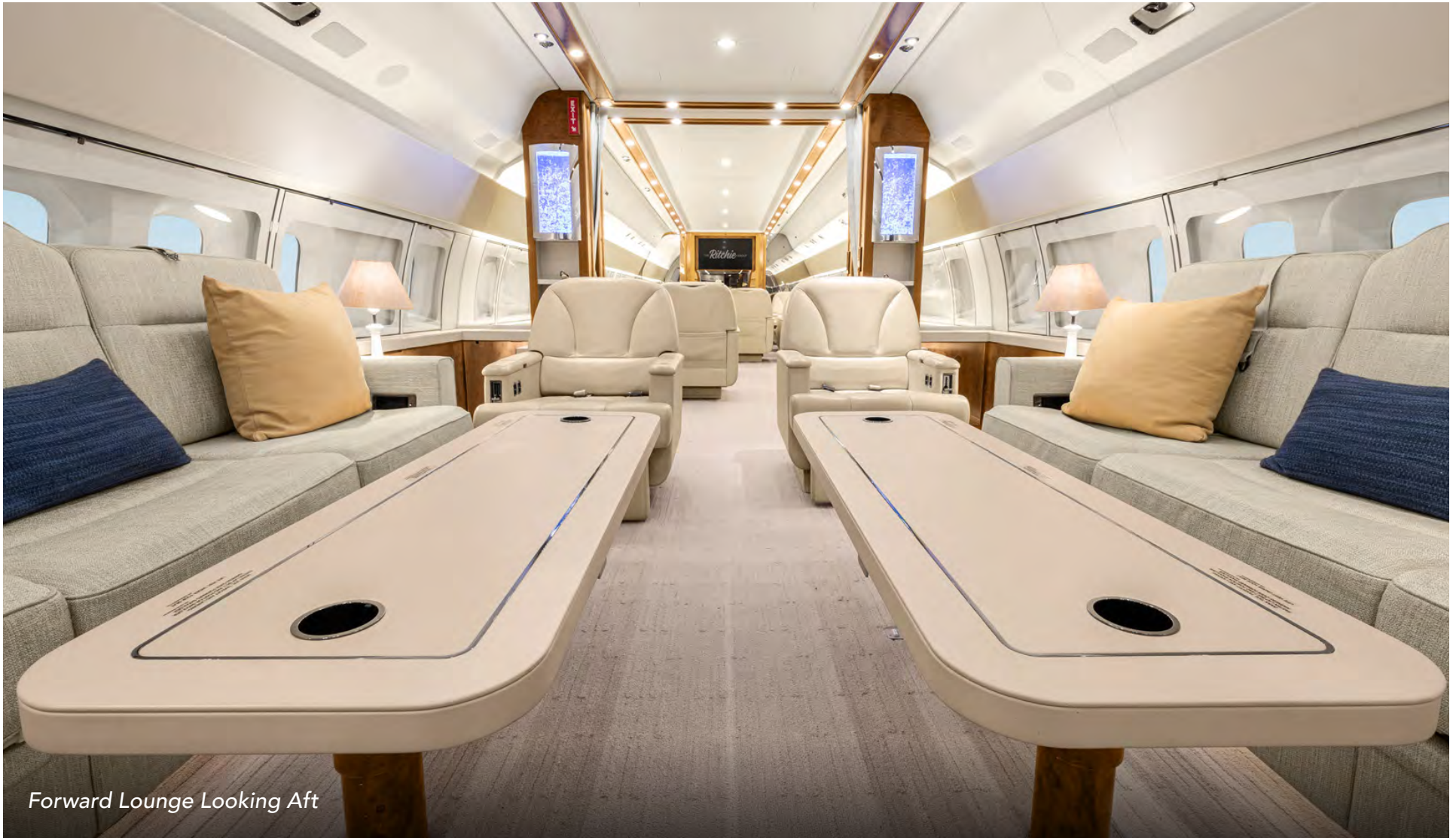
Forward Lounge Looking Aft

Specifications and/or descriptions are provided as introductory information only and do not constitute representations or warranties. Verification of specifications remain the sole responsibility of purchaser. Photographs and images may have been modified to remove logos, registration marks, or other identifying information to protect the privacy of the Aircraft's current owner. Aircraft is subject to prior sale, lease, and/or removal from the market without prior notice. SPECIFICATIONS AS OF MAY 19, 2026.