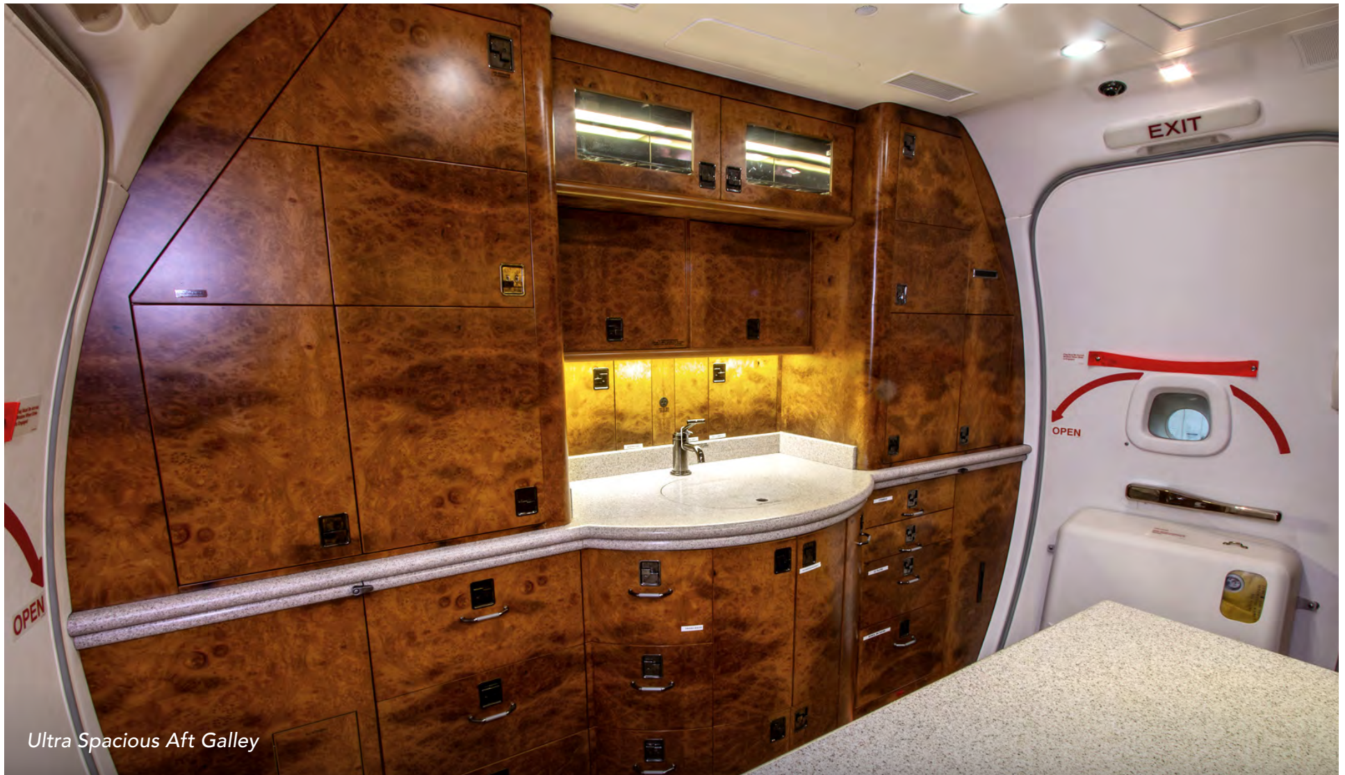
Ultra Spacious Aft Galley

Specifications and/or descriptions are provided as introductory information only and do not constitute representations or warranties. Verification of specifications remain the sole responsibility of purchaser. Photographs and images may have been modified to remove logos, registration marks, or other identifying information to protect the privacy of the Aircraft's current owner. Aircraft is subject to prior sale, lease, and/or removal from the market without prior notice. SPECIFICATIONS AS OF MAY 19, 2026.