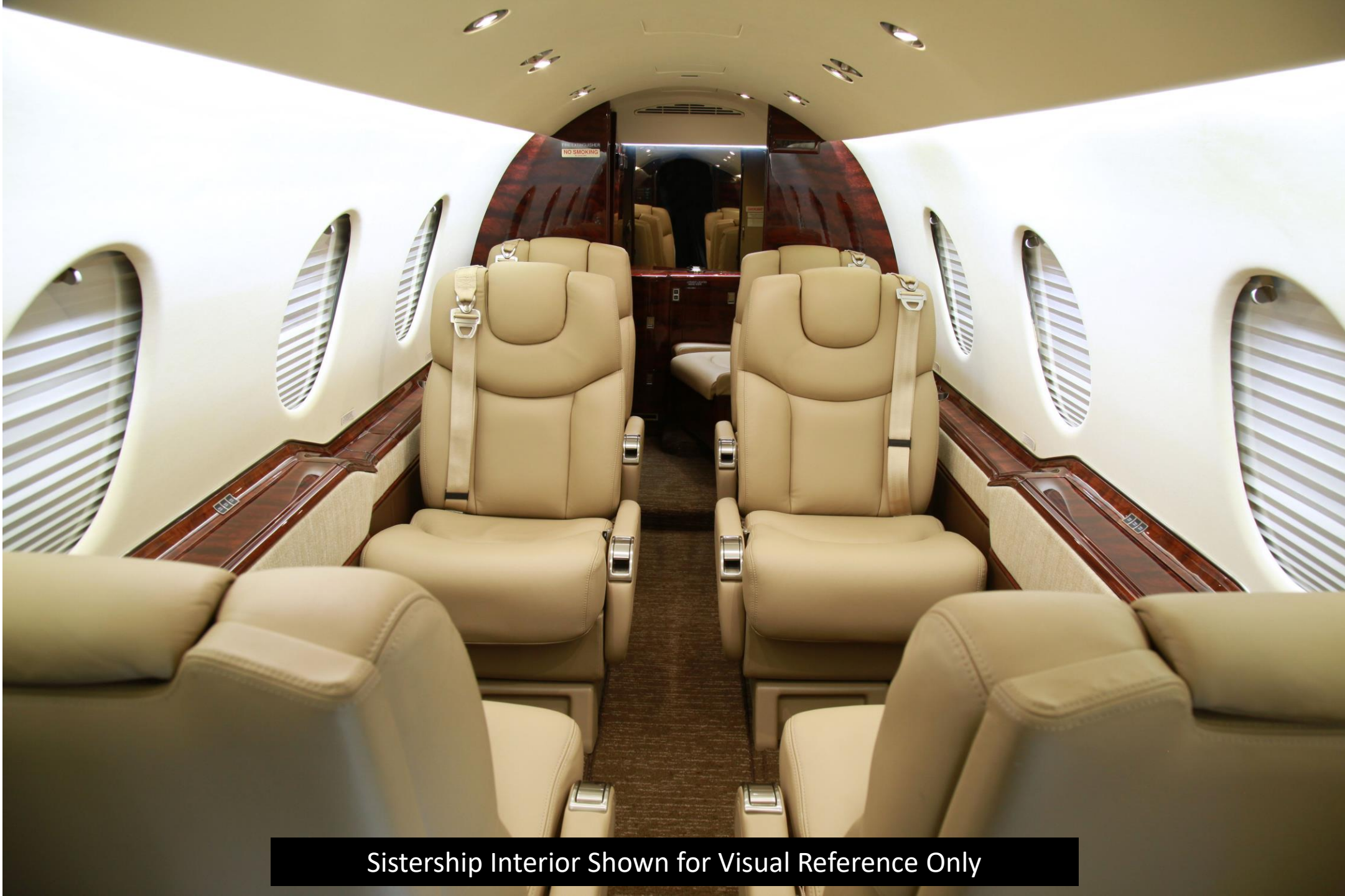
Sistership Interior Shown for Visual Reference Only