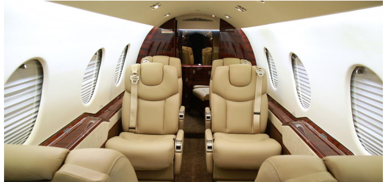
Sistership Interior Shown for Visual Reference Only