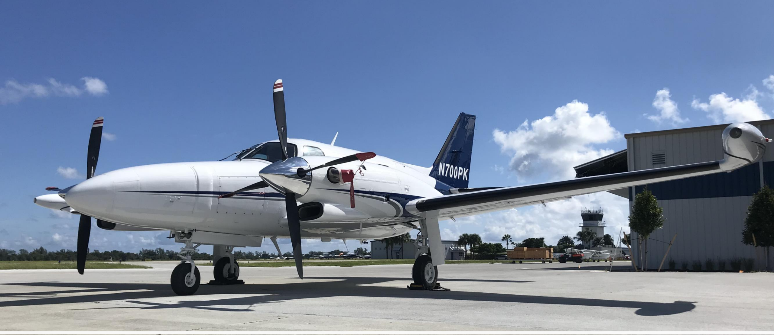
1980 CHEYENNE 1