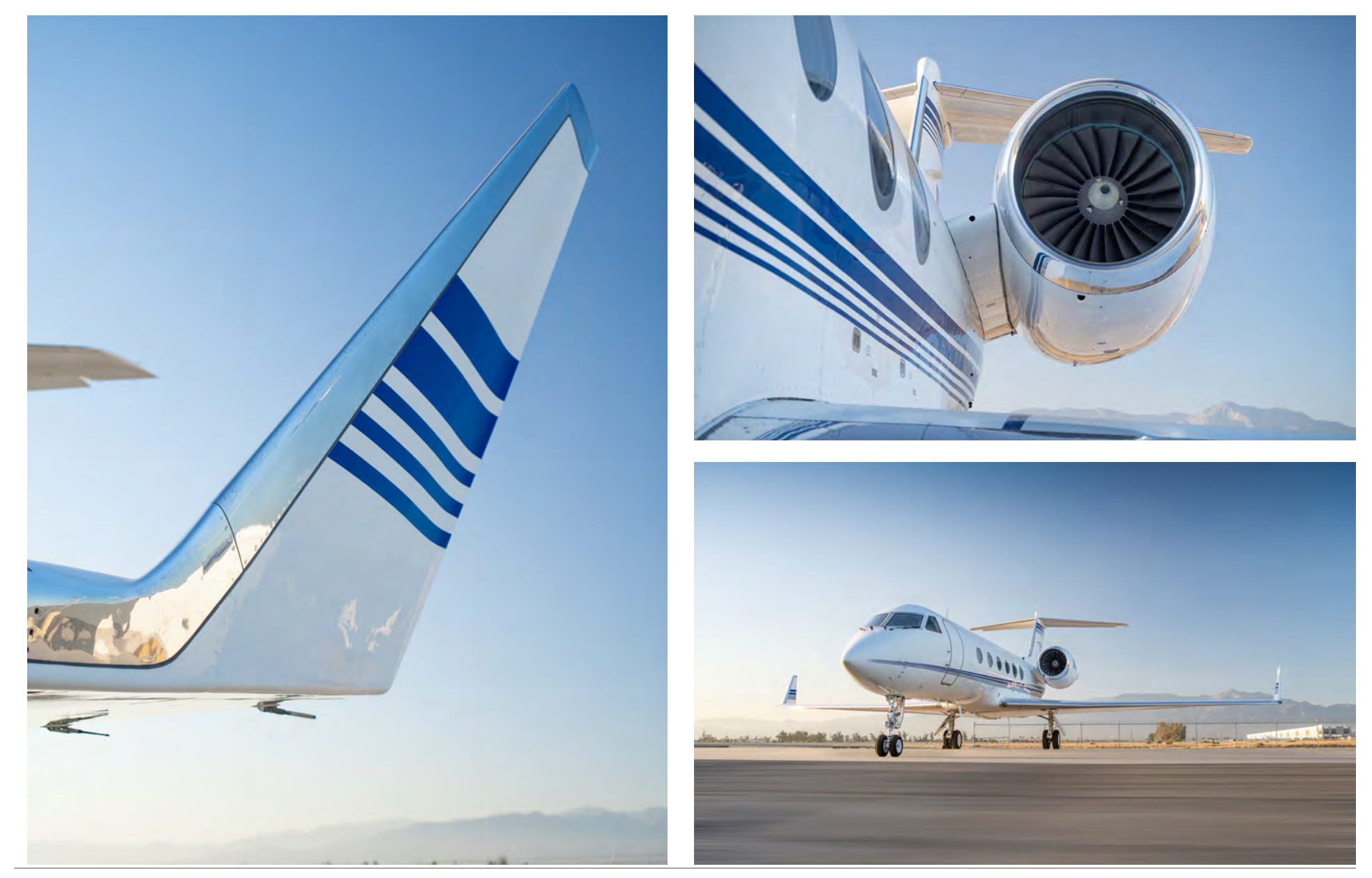
SPECIFICATIONS ARE PROVIDED FOR INFORMATIONAL PURPOSES ONLY AND DO NOT CONSTITUTE REPRESENTATIONS OR WARRANTIES. THESE SPECIFICATIONS ARE SUBJECT TO BUYER'S INDEPENDENT VERIFICATION UPON INSPECTION. THE AIRCRAFT IS SUBJECT TO PRIOR SALE, LEASE AND/OR REMOVAL FROM THE MARKET WITHOUT PRIOR NOTICE. MAY 18, 2022 2:42 PM