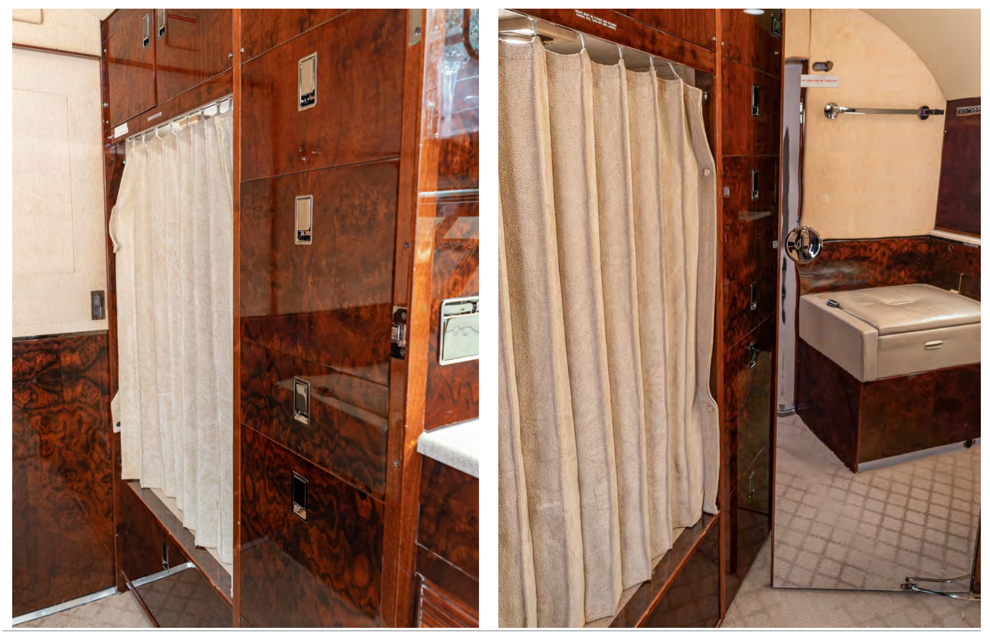
SPECIFICATIONS ARE PROVIDED FOR INFORMATIONAL PURPOSES ONLY AND DO NOT CONSTITUTE REPRESENTATIONS OR WARRANTIES. THESE SPECIFICATIONS ARE SUBJECT TO BUYER'S INDEPENDENT VERIFICATION UPON INSPECTION. THE AIRCRAFT IS SUBJECT TO PRIOR SALE, LEASE AND/OR REMOVAL FROM THE MARKET WITHOUT PRIOR NOTICE. MAY 18, 2022 2:42 PM