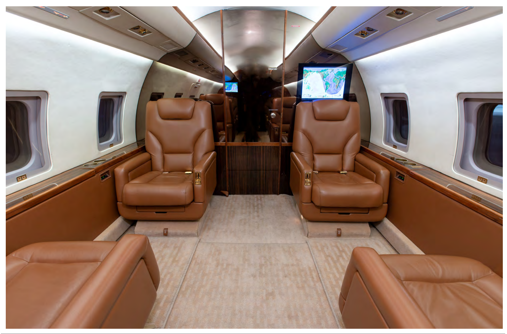
SPECIFICATIONS ARE PROVIDED FOR INFORMATIONAL PURPOSES ONLY AND DO NOT CONSTITUTE REPRESENTATIONS OR WARRANTIES. THESE SPECIFICATIONS ARE SUBJECT TO BUYER'S INDEPENDENT VERIFICATION UPON INSPECTION. THE AIRCRAFT IS SUBJECT TO PRIOR SALE, LEASE AND/OR REMOVAL FROM THE MARKET WITHOUT PRIOR NOTICE. JUNE 16, 2021 9:57 AM