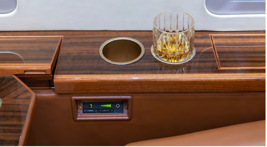
SPECIFICATIONS ARE PROVIDED FOR INFORMATIONAL PURPOSES ONLY AND DO NOT CONSTITUTE REPRESENTATIONS OR WARRANTIES. THESE SPECIFICATIONS ARE SUBJECT TO BUYER'S INDEPENDENT VERIFICATION UPON INSPECTION. THE AIRCRAFT IS SUBJECT TO PRIOR SALE, LEASE AND/OR REMOVAL FROM THE MARKET WITHOUT PRIOR NOTICE. JUNE 16, 2021 9:57 AM