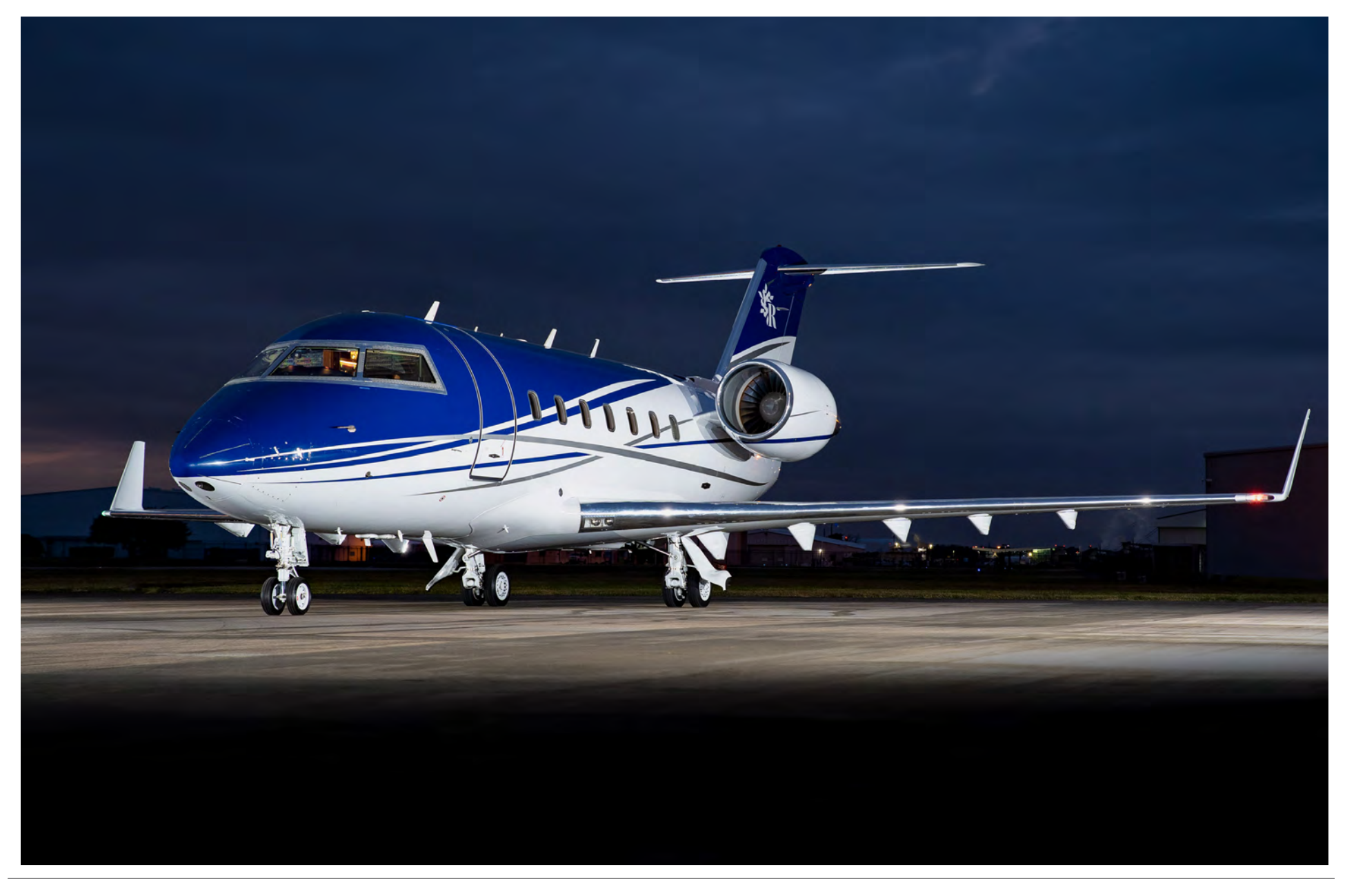
SPECIFICATIONS ARE PROVIDED FOR INFORMATIONAL PURPOSES ONLY AND DO NOT CONSTITUTE REPRESENTATIONS OR WARRANTIES. THESE SPECIFICATIONS ARE SUBJECT TO BUYER'S INDEPENDENT VERIFICATION UPON INSPECTION THE AIRCRAFT IS SUBJECT TO PRIOR SALE, LEASE AND/OR REMOVAL FROM THE MARKET WITHOUT PRIOR NOTICE. JUNE 16, 2021 9:57 AM