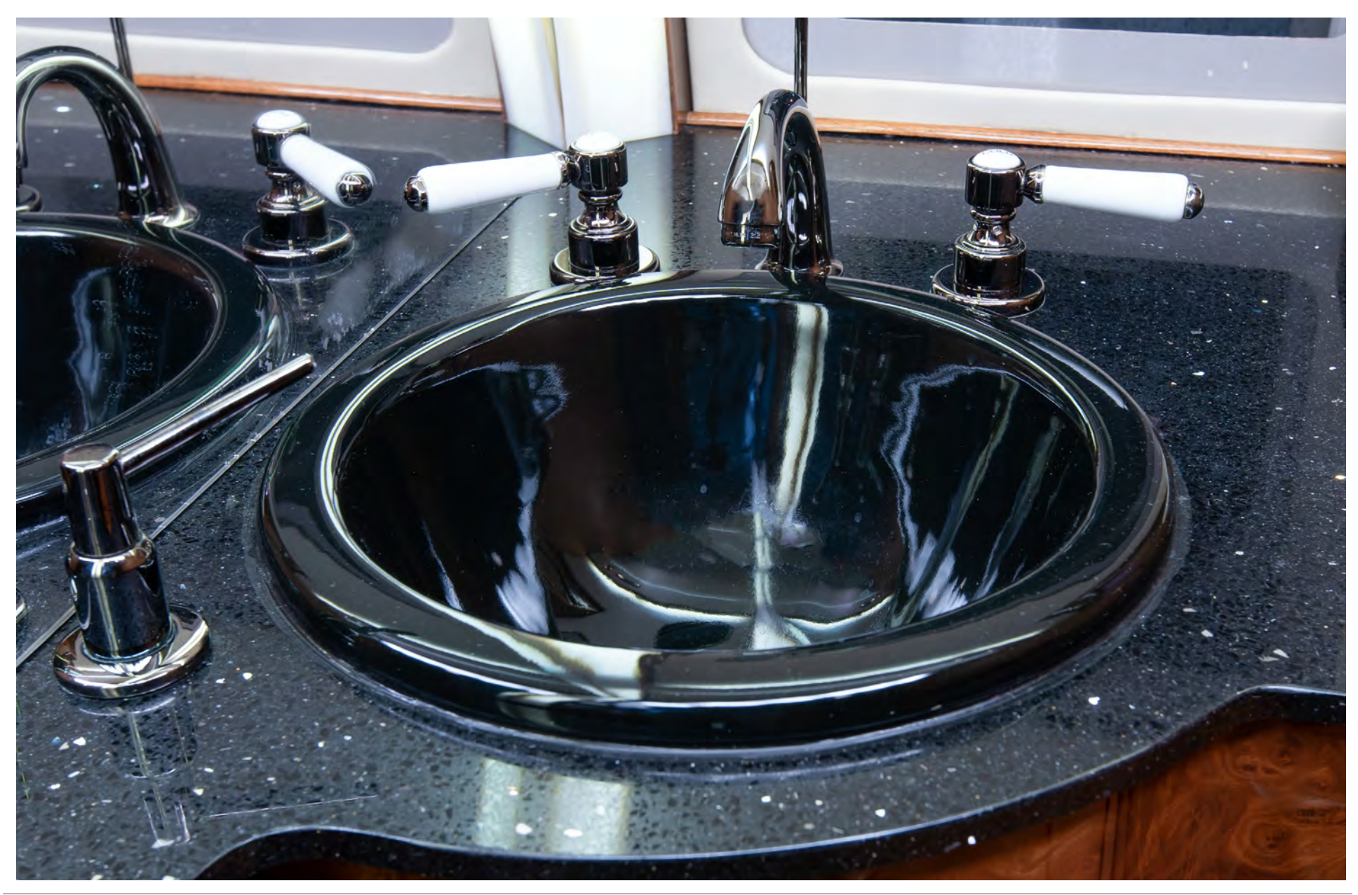
SPECIFICATIONS ARE PROVIDED FOR INFORMATIONAL PURPOSES ONLY AND DO NOT CONSTITUTE REPRESENTATIONS OR WARRANTIES. THESE SPECIFICATIONS ARE SUBJECT TO BUYER'S INDEPENDENT VERIFICATION UPON INSPECTION THE AIRCRAFT IS SUBJECT TO PRIOR SALE, LEASE AND/OR REMOVAL FROM THE MARKET WITHOUT PRIOR NOTICE. JUNE 16, 2021 9:57 AM