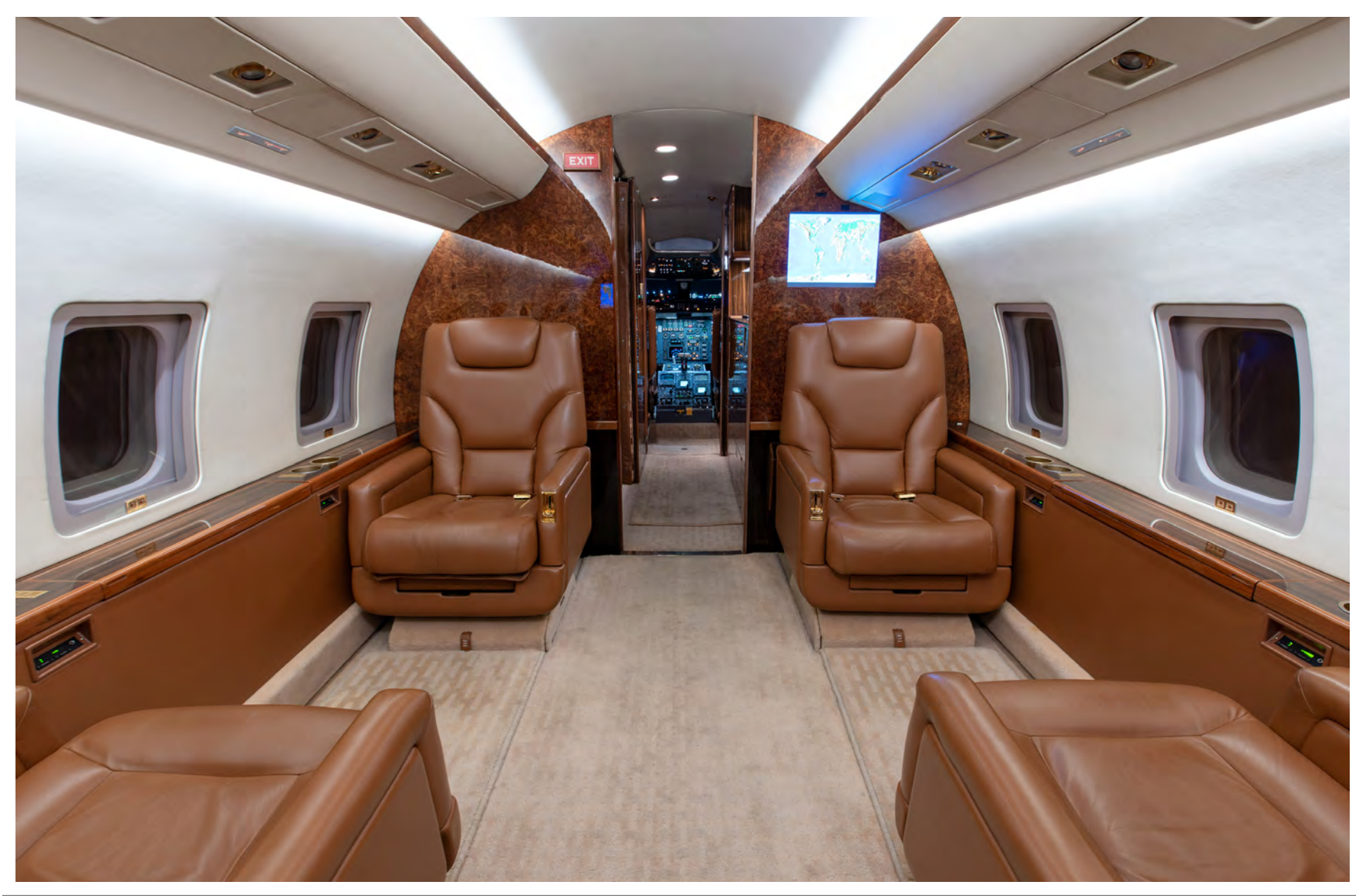
SPECIFICATIONS ARE PROVIDED FOR INFORMATIONAL PURPOSES ONLY AND DO NOT CONSTITUTE REPRESENTATIONS OR WARRANTIES. THESE SPECIFICATIONS ARE SUBJECT TO BUYER'S INDEPENDENT VERIFICATION UPON INSPECTION THE AIRCRAFT IS SUBJECT TO PRIOR SALE, LEASE AND/OR REMOVAL FROM THE MARKET WITHOUT PRIOR NOTICE. JUNE 16, 2021 9:57 AM