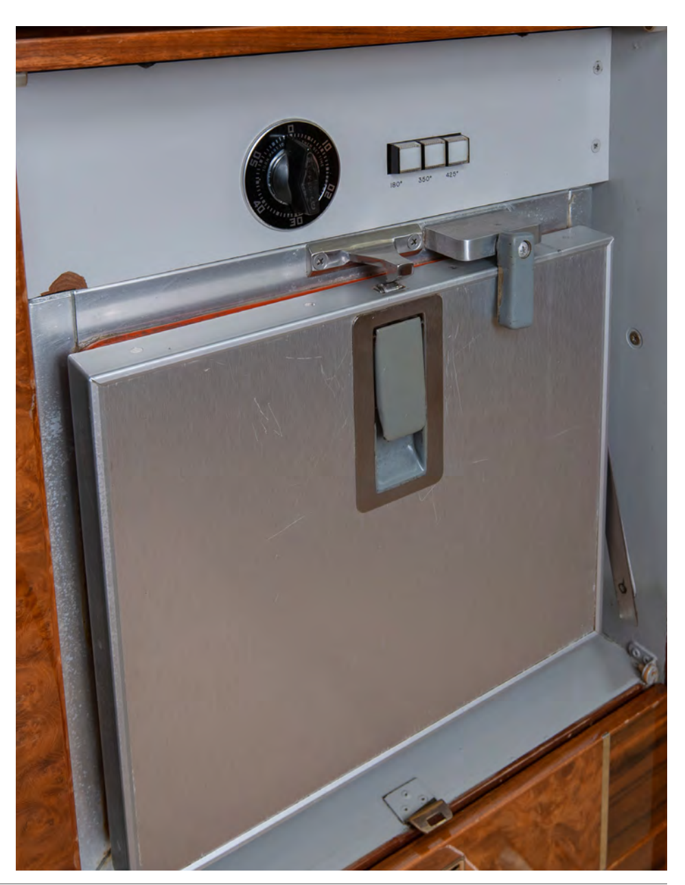
SPECIFICATIONS ARE PROVIDED FOR INFORMATIONAL PURPOSES ONLY AND DO NOT CONSTITUTE REPRESENTATIONS OR WARRANTIES. THESE SPECIFICATIONS ARE SUBJECT TO BUYER'S INDEPENDENT VERIFICATION UPON INSPECTION. THE AIRCRAFT IS SUBJECT TO PRIOR SALE, LEASE AND/OR REMOVAL FROM THE MARKET WITHOUT PRIOR NOTICE. JUNE 16, 2021 9:57 AM