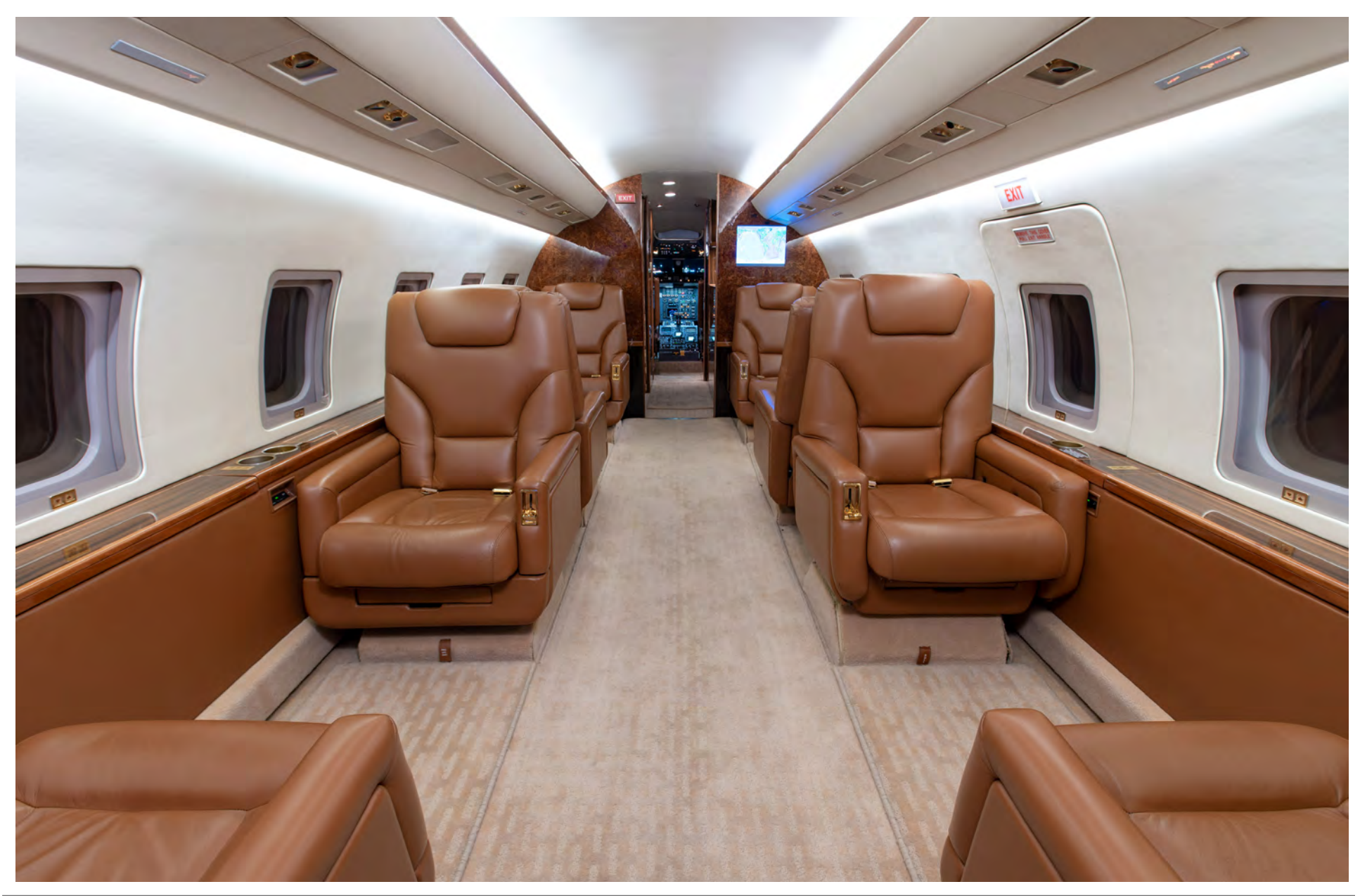
SPECIFICATIONS ARE PROVIDED FOR INFORMATIONAL PURPOSES ONLY AND DO NOT CONSTITUTE REPRESENTATIONS OR WARRANTIES. THESE SPECIFICATIONS ARE SUBJECT TO BUYER'S INDEPENDENT VERIFICATION UPON INSPECTION THE AIRCRAFT IS SUBJECT TO PRIOR SALE, LEASE AND/OR REMOVAL FROM THE MARKET WITHOUT PRIOR NOTICE. JUNE 16, 2021 9:57 AM