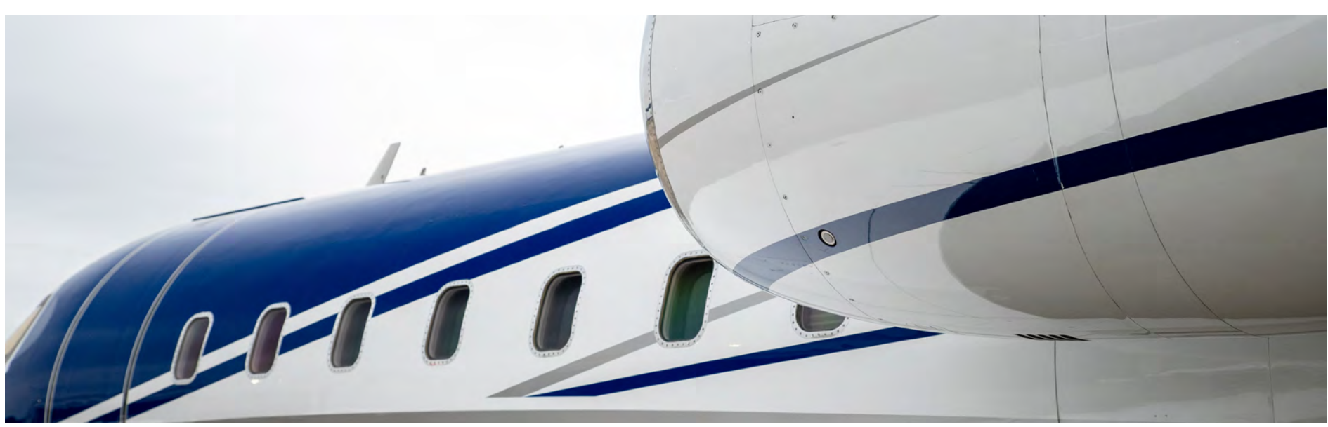
SPECIFICATIONS ARE PROVIDED FOR INFORMATIONAL PURPOSES ONLY AND DO NOT CONSTITUTE REPRESENTATIONS OR WARRANTIES. THESE SPECIFICATIONS ARE SUBJECT TO BUYER'S INDEPENDENT VERIFICATION UPON INSPECTION THE AIRCRAFT IS SUBJECT TO PRIOR SALE, LEASE AND/OR REMOVAL FROM THE MARKET WITHOUT PRIOR NOTICE. JUNE 16, 2021 9:57 AM