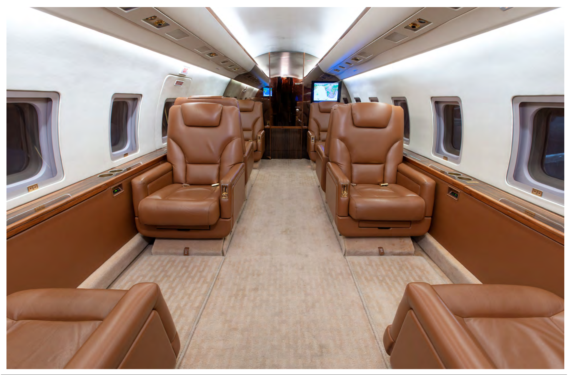
SPECIFICATIONS ARE PROVIDED FOR INFORMATIONAL PURPOSES ONLY AND DO NOT CONSTITUTE REPRESENTATIONS OR WARRANTIES. THESE SPECIFICATIONS ARE SUBJECT TO BUYER'S INDEPENDENT VERIFICATION UPON INSPECTION THE AIRCRAFT IS SUBJECT TO PRIOR SALE, LEASE AND/OR REMOVAL FROM THE MARKET WITHOUT PRIOR NOTICE. JUNE 16, 2021 9:57 AM