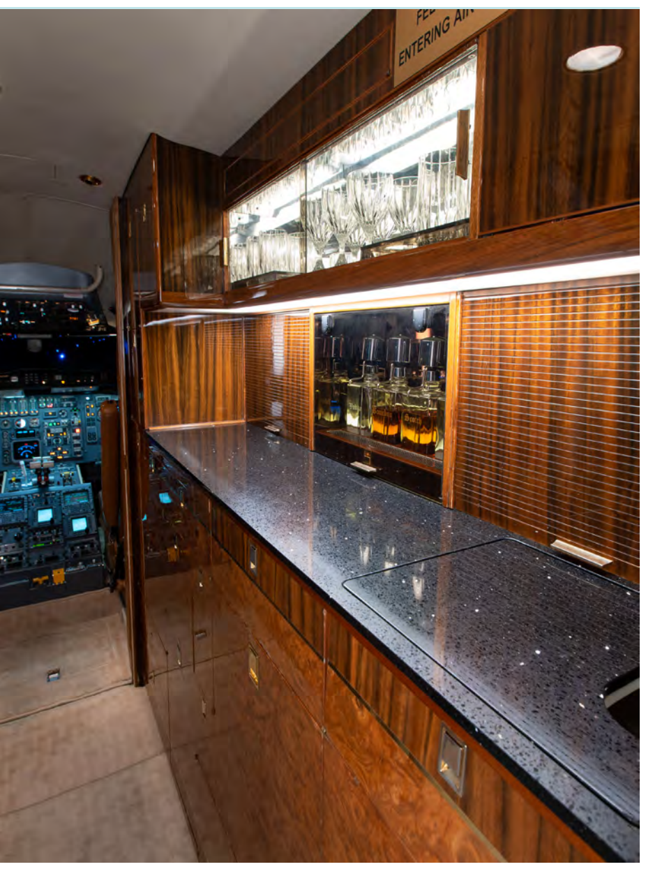
THE AIRCRAFT IS SUBJECT TO PRIOR SALE, LEASE AND/OR REMOVAL FROM THE MARKET WITHOUT PRIOR NOTICE. JUNE 16, 2021 9:57 AM