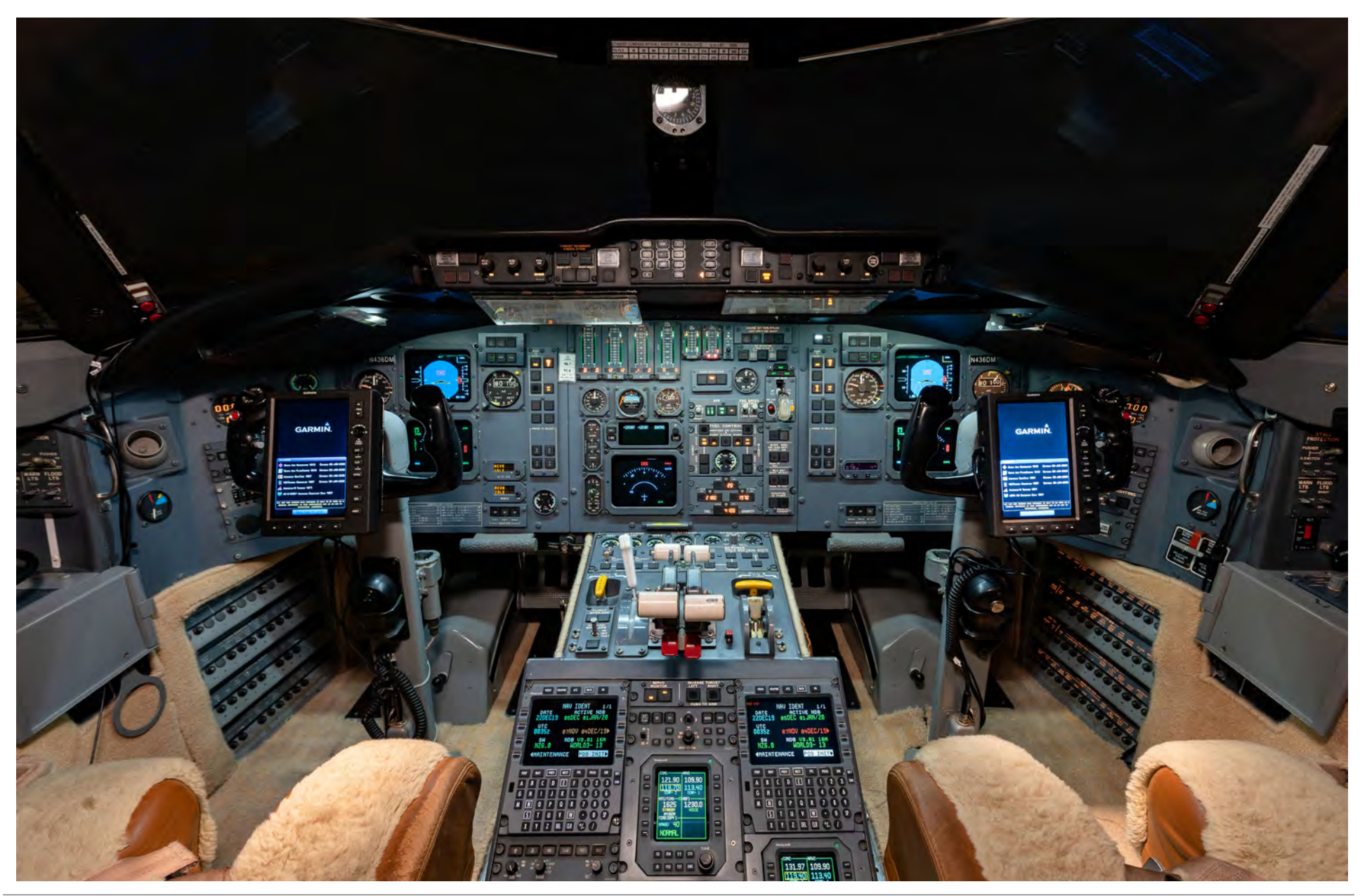
SPECIFICATIONS ARE PROVIDED FOR INFORMATIONAL PURPOSES ONLY AND DO NOT CONSTITUTE REPRESENTATIONS OR WARRANTIES. THESE SPECIFICATIONS ARE SUBJECT TO BUYER'S INDEPENDENT VERIFICATION UPON INSPECTION. THE AIRCRAFT IS SUBJECT TO PRIOR SALE, LEASE AND/OR REMOVAL FROM THE MARKET WITHOUT PRIOR NOTICE. JUNE 16, 2021 9:57 AM