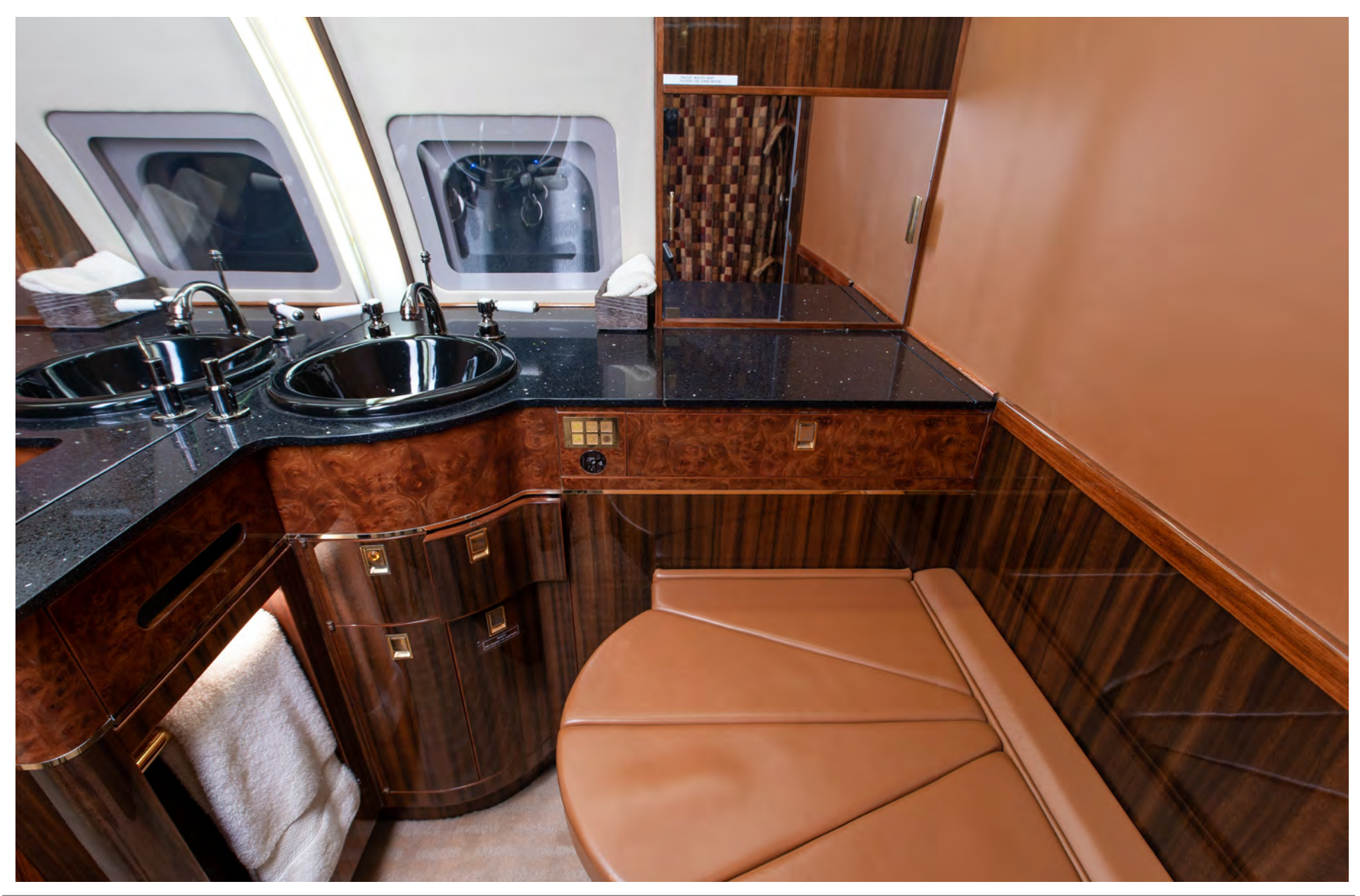
SPECIFICATIONS ARE PROVIDED FOR INFORMATIONAL PURPOSES ONLY AND DO NOT CONSTITUTE REPRESENTATIONS OR WARRANTIES. THESE SPECIFICATIONS ARE SUBJECT TO BUYER'S INDEPENDENT VERIFICATION UPON INSPECTION. THE AIRCRAFT IS SUBJECT TO PRIOR SALE, LEASE AND/OR REMOVAL FROM THE MARKET WITHOUT PRIOR NOTICE. JUNE 16, 2021 9:57 AM