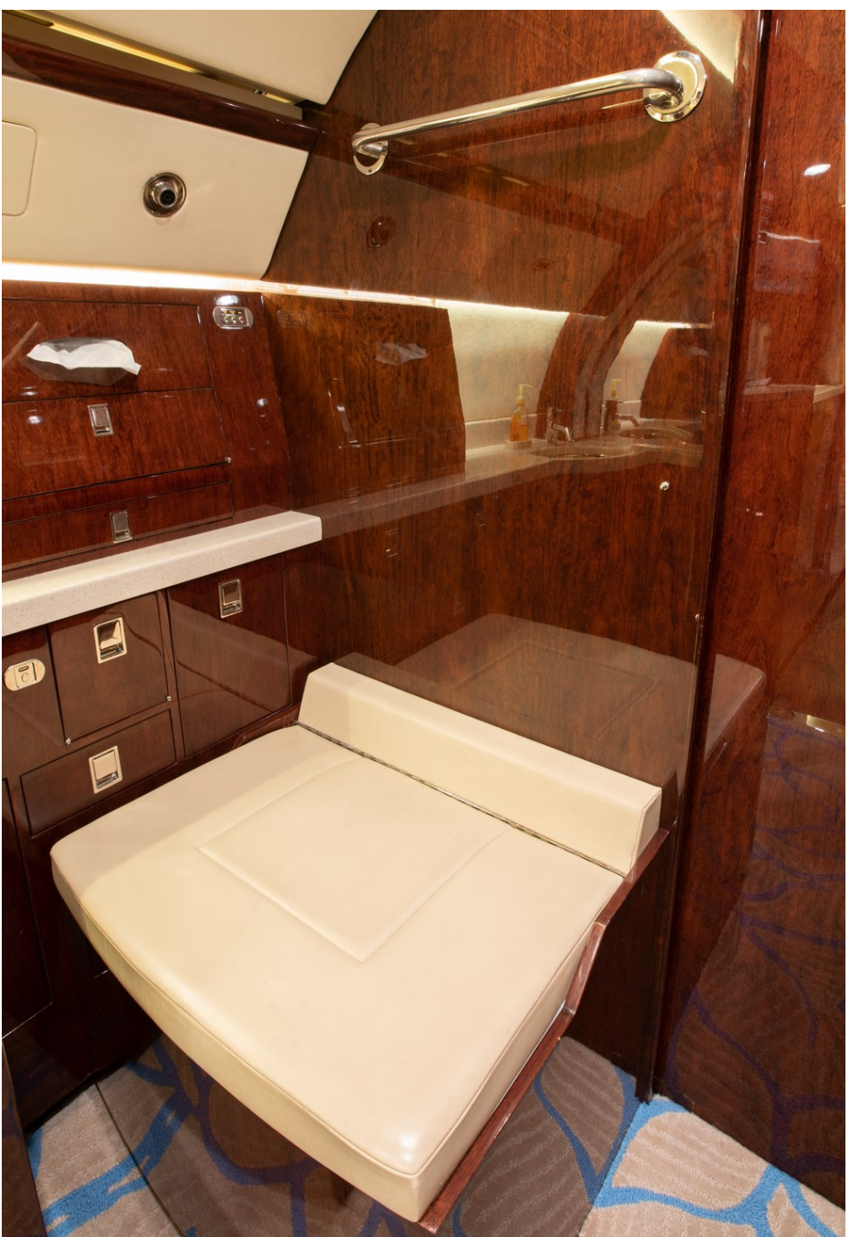
SPECIFICATIONS ARE SUBJECT TO VERIFICATION UPON INSPECTION & SUBJECT TO PRIOR SALE OR MARKET REMOVAL