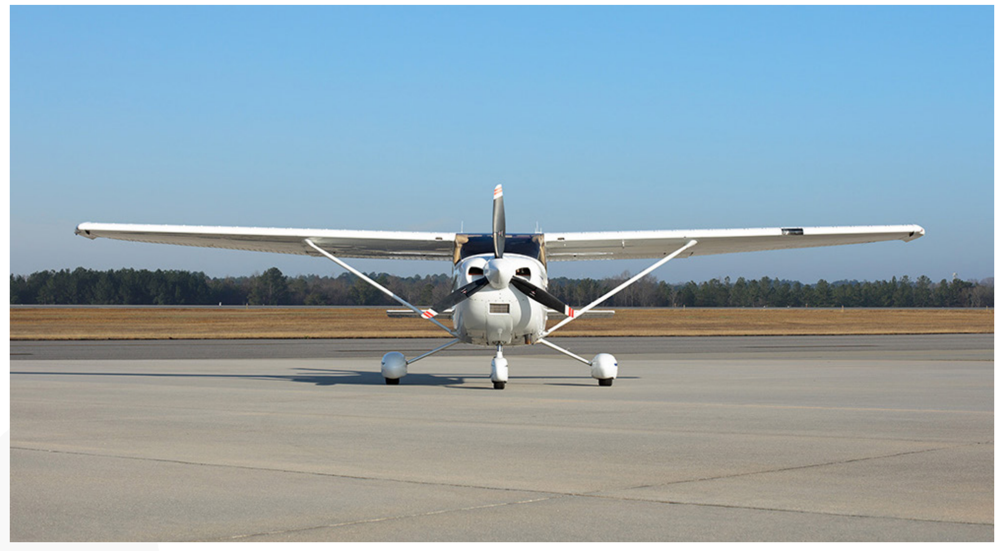
Aircraft Specifications Subject To Verification Upon Inspection. Aircraft Subject to Prior Sale or Withdrawal from Market.