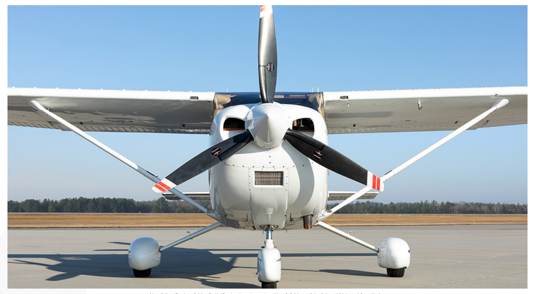
Aircraft Specifications Subject To Verification Upon Inspection. Aircraft Subject to Prior Sale or Withdrawal from Market.

SERIAL NUMBER: T18208026 • REGISTRATION NUMBER: N1204C