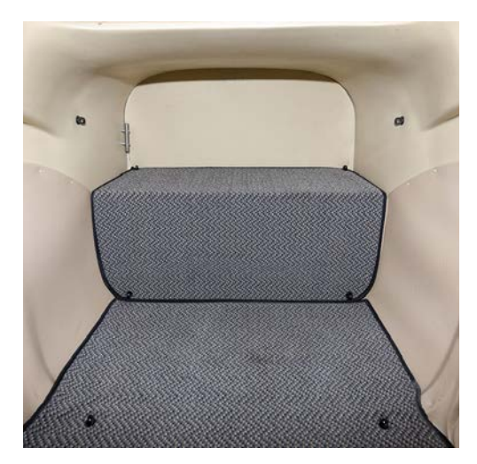
Aircraft Specifications Subject To Verification Upon Inspection. Aircraft Subject to Prior Sale or Withdrawal from Market.