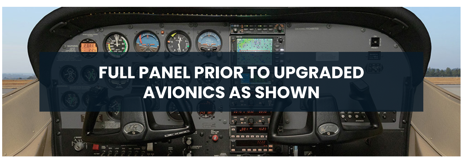
Aircraft Specifications Subject To Verification Upon Inspection. Aircraft Subject to Prior Sale or Withdrawal from Market.