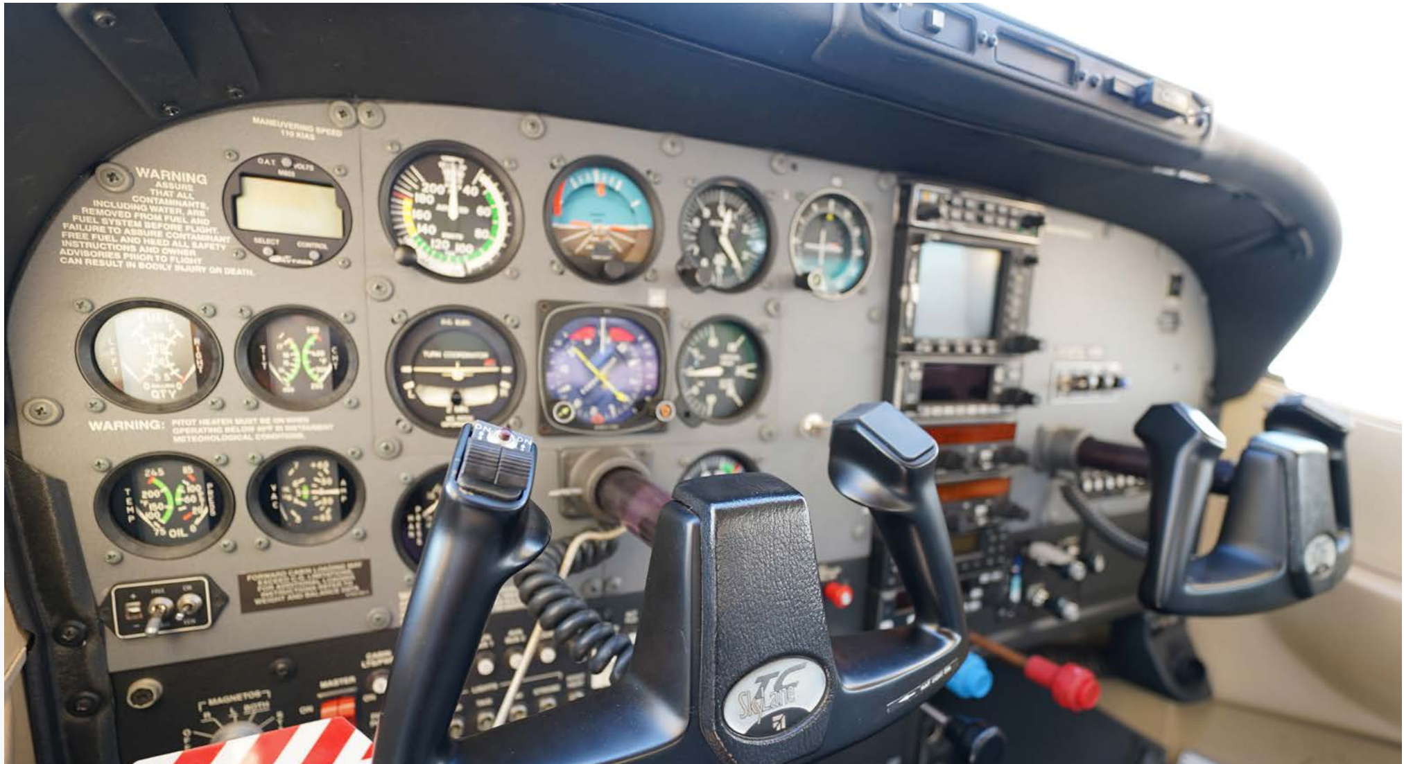
Aircraft Specifications Subject To Verification Upon Inspection. Aircraft Subject to Prior Sale or Withdrawal from Market.