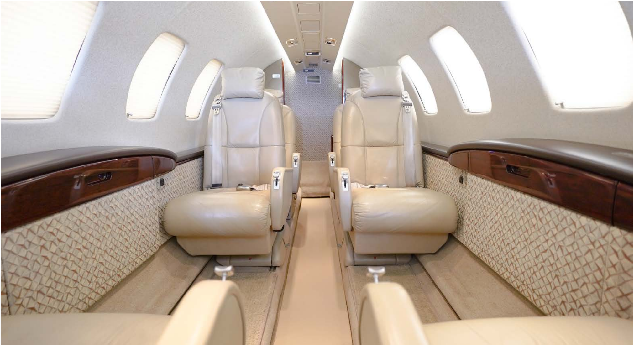
Aircraft Specifications Subject To Verification Upon Inspection. Aircraft Subject to Prior Sale or Withdrawal from Market.