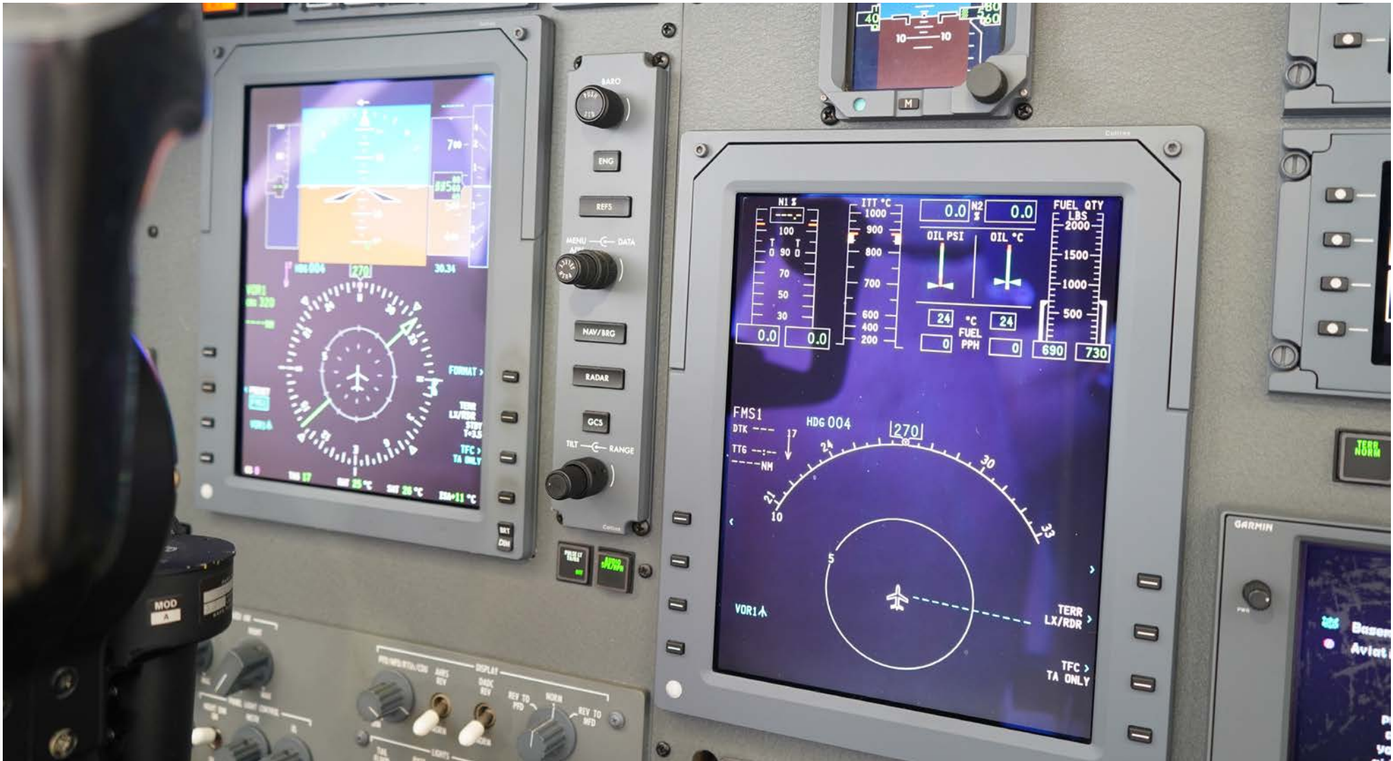
Aircraft Specifications Subject To Verification Upon Inspection. Aircraft Subject to Prior Sale or Withdrawal from Market.