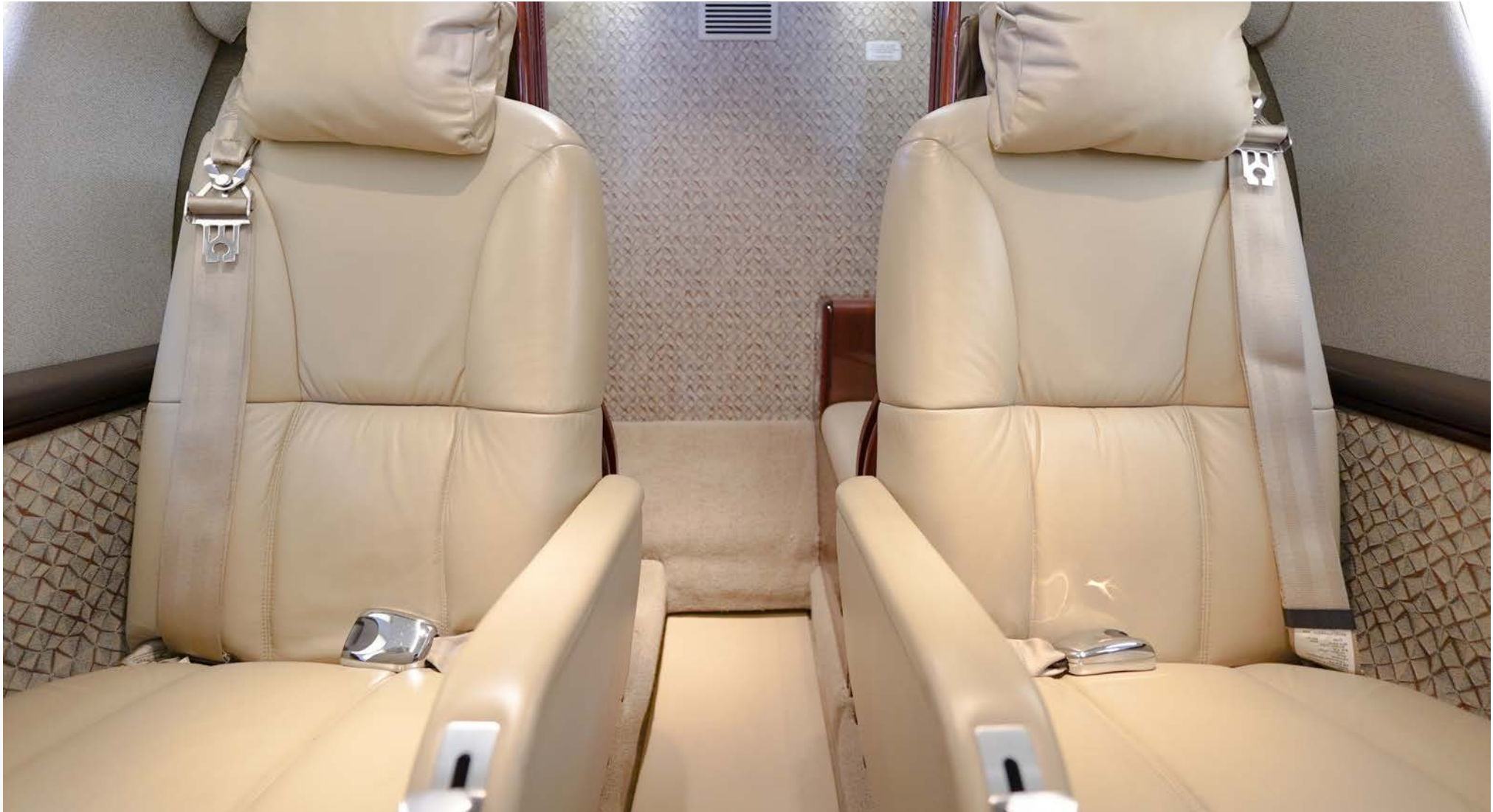
Aircraft Specifications Subject To Verification Upon Inspection. Aircraft Subject to Prior Sale or Withdrawal from Market.