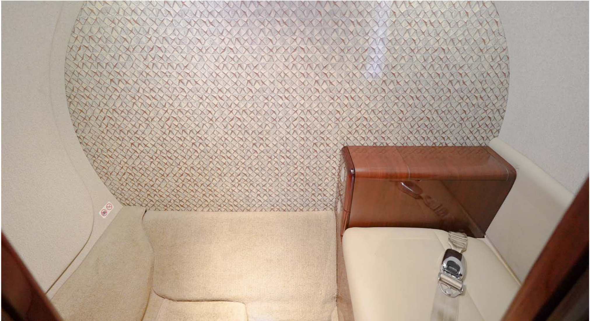
Aircraft Specifications Subject To Verification Upon Inspection. Aircraft Subject to Prior Sale or Withdrawal from Market.