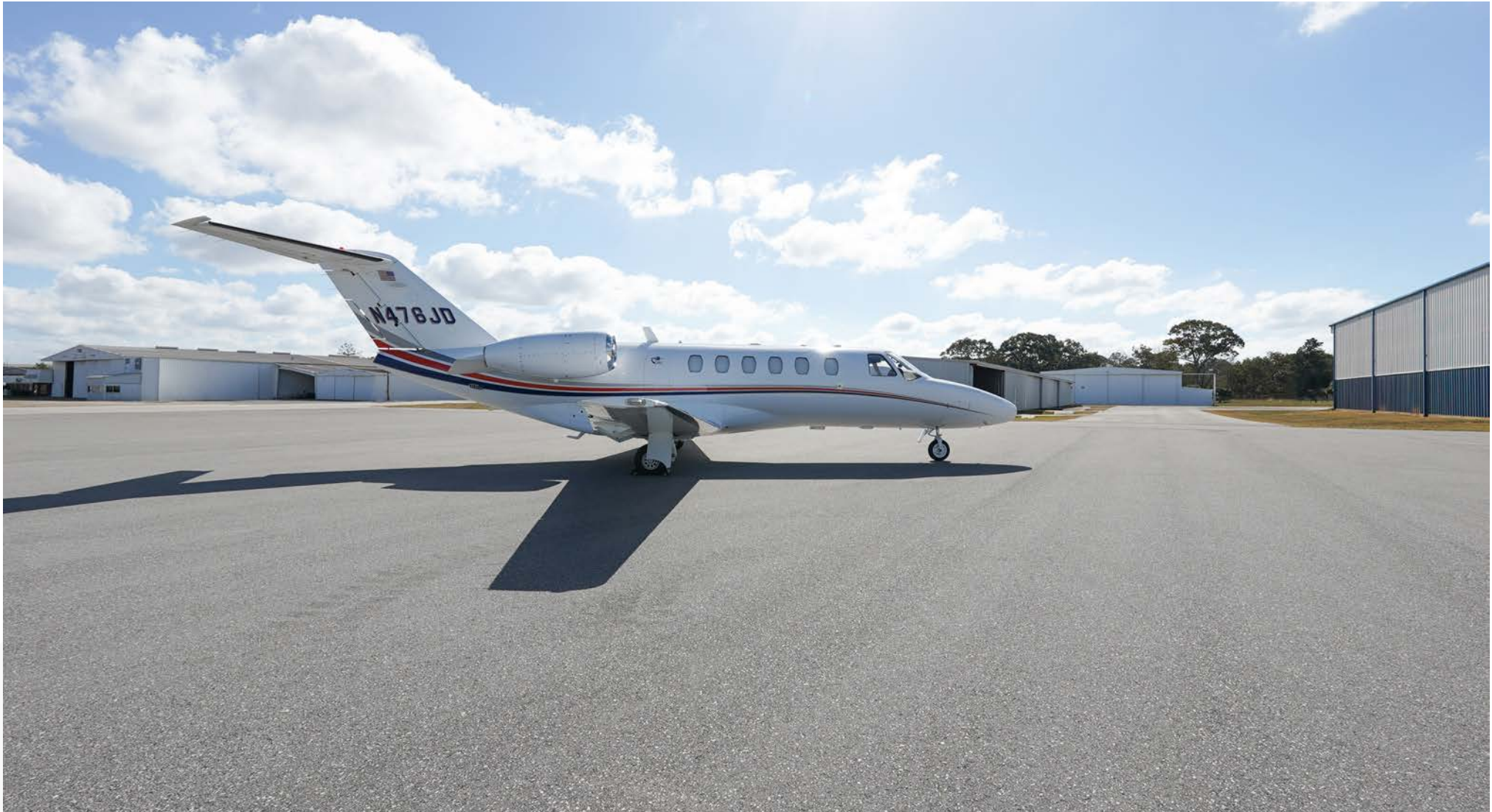
Aircraft Specifications Subject To Verification Upon Inspection. Aircraft Subject to Prior Sale or Withdrawal from Market.