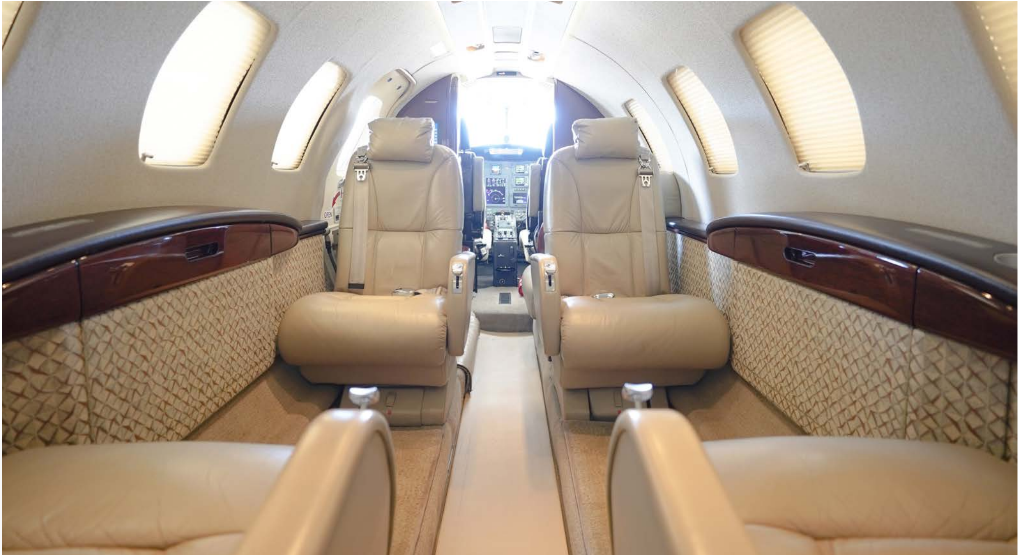
Aircraft Specifications Subject To Verification Upon Inspection. Aircraft Subject to Prior Sale or Withdrawal from Market.