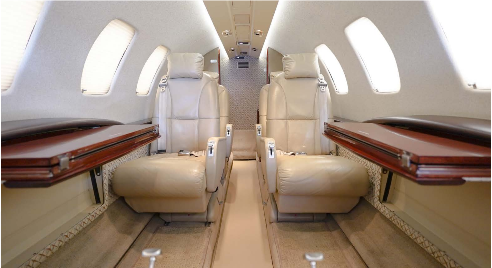
Aircraft Specifications Subject To Verification Upon Inspection. Aircraft Subject to Prior Sale or Withdrawal from Market.