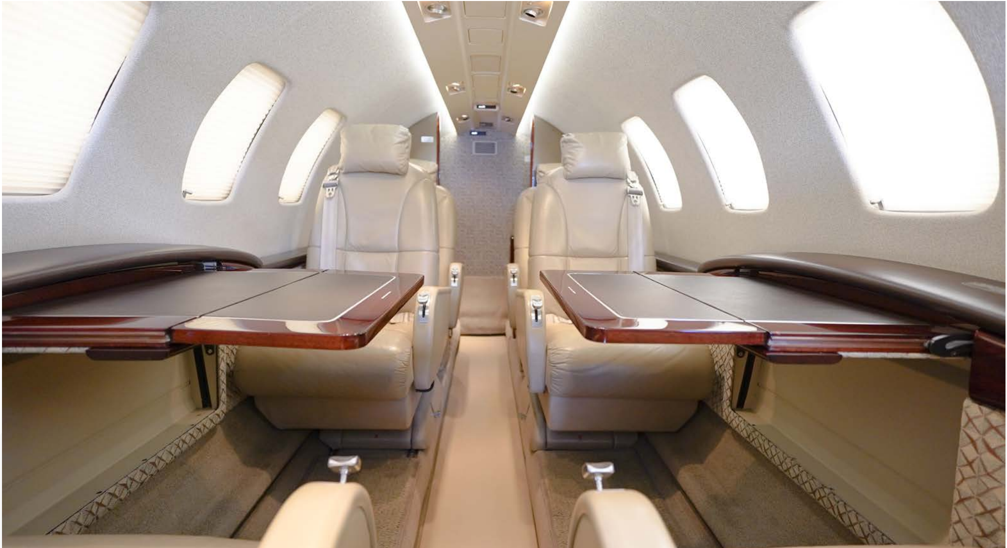
Aircraft Specifications Subject To Verification Upon Inspection. Aircraft Subject to Prior Sale or Withdrawal from Market.